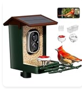
Figure 7: Day & Night Bird Watching. This image illustrates the feeder's capability to provide clear visuals of birds both during the day and at night.