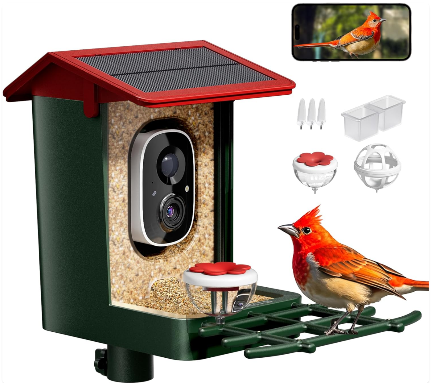
Figure 1: HEAPETS Smart Bird Feeder with Camera. This image displays the feeder unit, a red cardinal perched on it, and a smartphone screen showing a live feed from the camera.