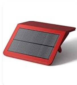
Figure 2: Effortless Power. This diagram illustrates the solar panel and rechargeable battery, emphasizing the need for initial Type-C

Before initial installation, ensure the camera is fully charged via the provided Type-C power cable. For optimal solar charging, install the feeder in a sun-facing location with over 4 hours of daily sunlight.