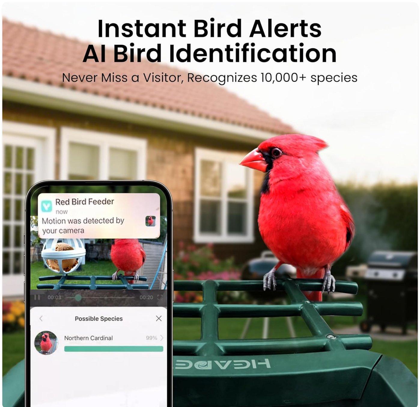
Figure 8: Instant Bird Alerts AI Bird Identification. This image demonstrates the app's notification feature for bird arrivals and its AI-driven species identification capability.

The feeder features AI-powered recognition that can identify over 10,000 bird species. You will receive instant app notifications when birds arrive, allowing you to view live or check recorded footage. A one-month free trial for AI recognition is included, with subscription options available thereafter.