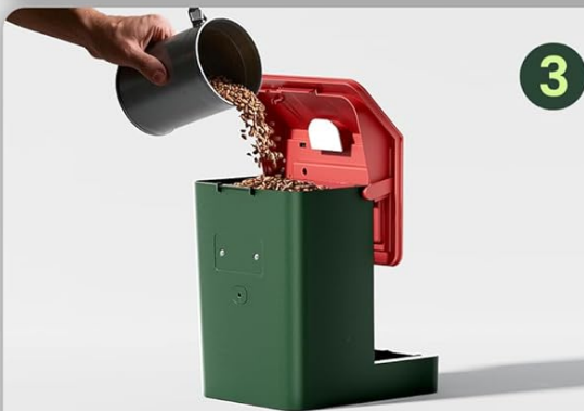
Adding Bird Seed