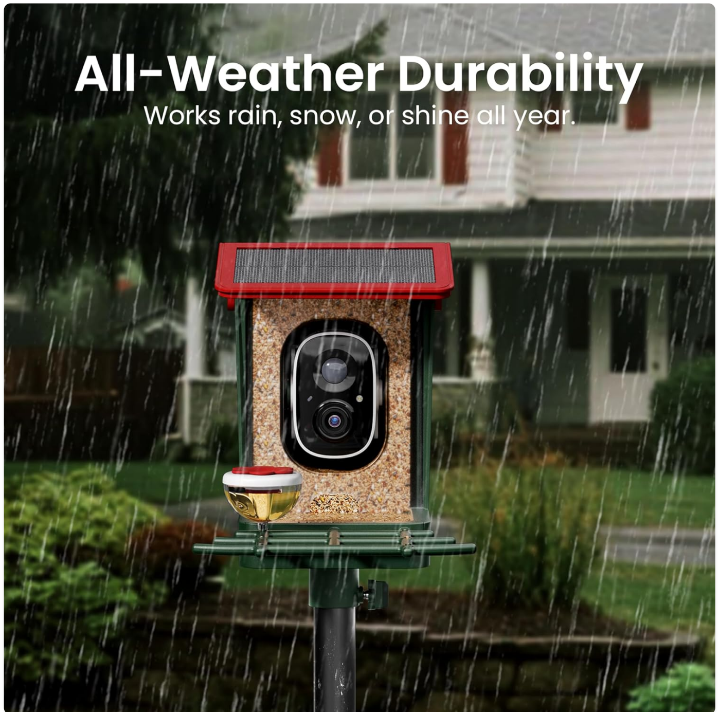
Figure 14: All-Weather Durability. This image highlights the feeder's ability to function effectively in rainy conditions.

The HEAPETS Smart Bird Feeder is designed to be weatherproof and built to last. It is rainproof, snow-resistant, and heat-tolerant, ensuring reliable operation year-round in various climates.