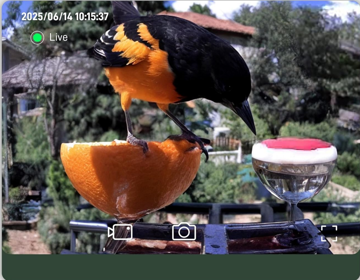
Figure 5: 2K HD Camera. This image shows a clear, high-definition view of a bird captured by the feeder's camera, as seen on a smartphone screen.