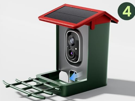
Remove & Store Outlet Valve