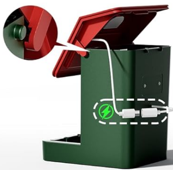
Assemble Feeder Cover