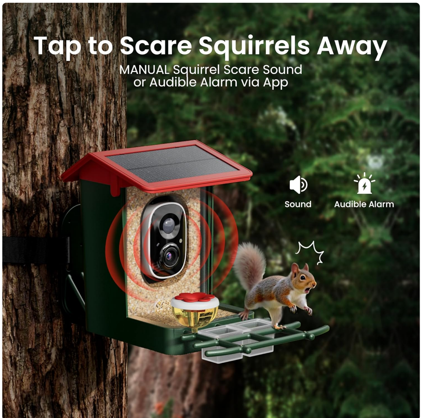
Figure 10: Tap to Scare Squirrels Away. This image illustrates the feeder's capability to deter squirrels using sound or an audible alarm.

The feeder features a feature to deter squirrels. You can manually activate a squirrel scare sound or an audible alarm via the app if unwanted visitors are detected.