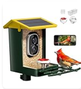
Figure 12: Capture the Joy. Share the Moment. This image highlights the ability to share birdwatching moments with others and view live feeds simultaneously.