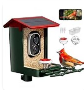
Figure 6: Clear Footage, Close-Up Views. This image set demonstrates the camera's ability to capture crystal-clear video of various bird species visiting the feeder.