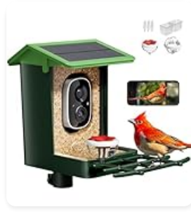
Figure 9: Learn About 10,000+ Bird Species. This image highlights the app's feature to provide detailed information about identified bird species.