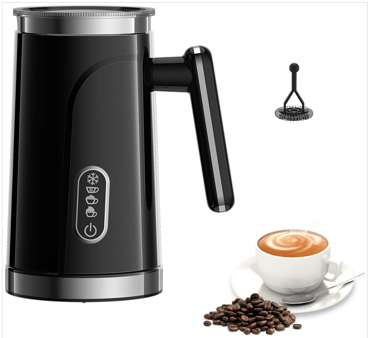
Image: The BioloMix BMF101 Electric Milk Frother in black, accompanied by a cup of frothed coffee and scattered coffee beans.