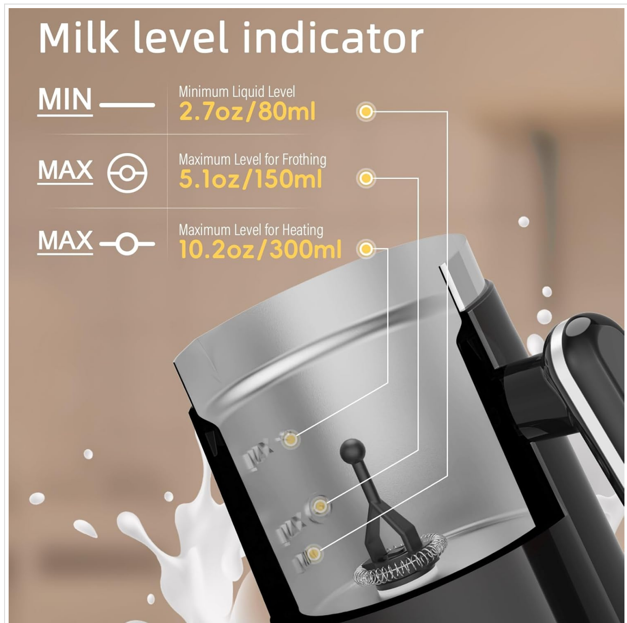
Image: The interior of the frother jug displaying the minimum liquid level (2.7oz/80ml), maximum level for frothing (5.1oz/150ml), and maximum level for heating (10.2oz/300ml).

is added between the MIN and MAX fill lines indicated inside the jug.