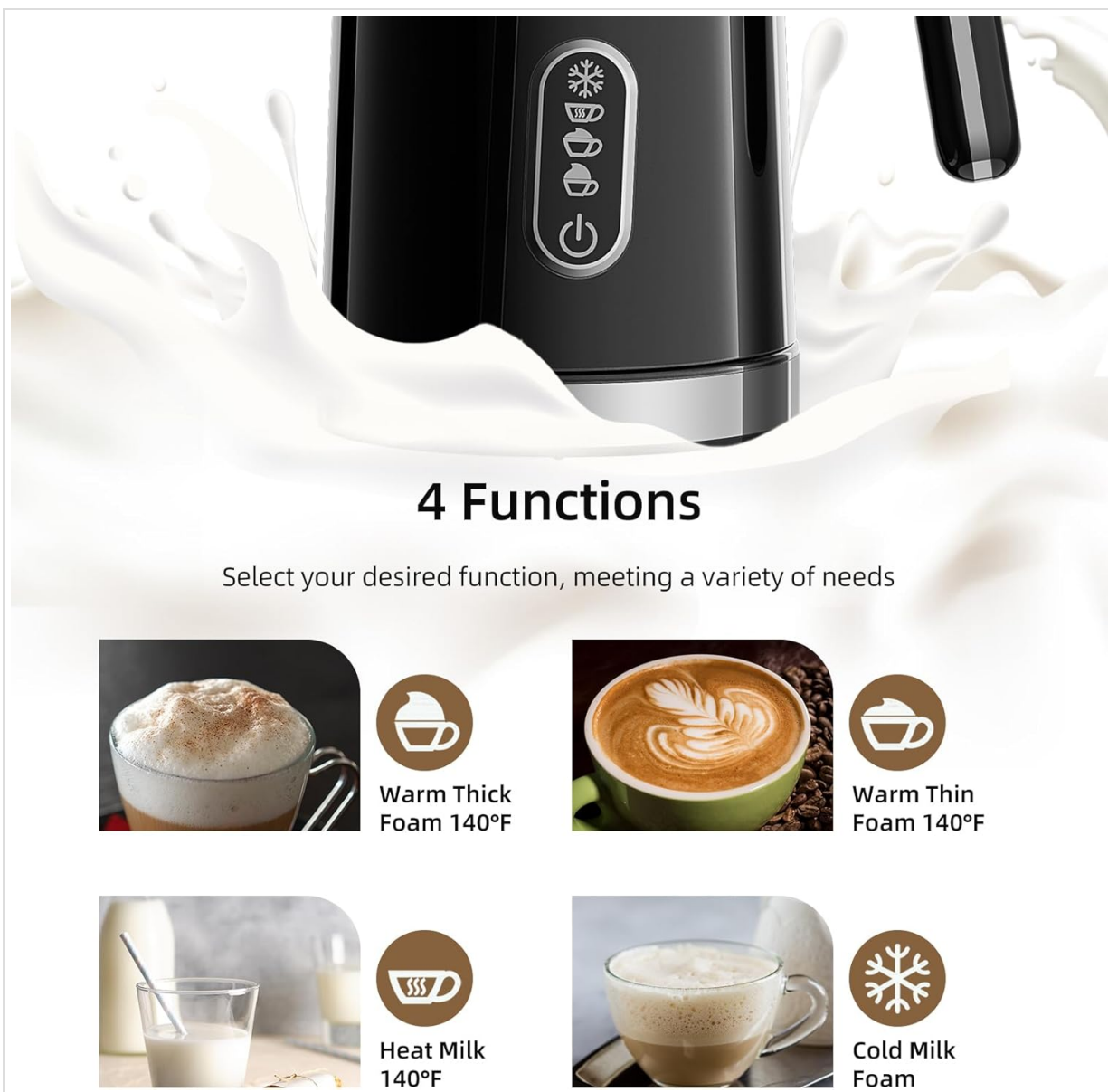
Image: The control panel of the frother illustrating the four functions: Warm Thick Foam (140°F), Warm Thin Foam (140°F), Heat Milk (140°F), and Cold Milk Foam.