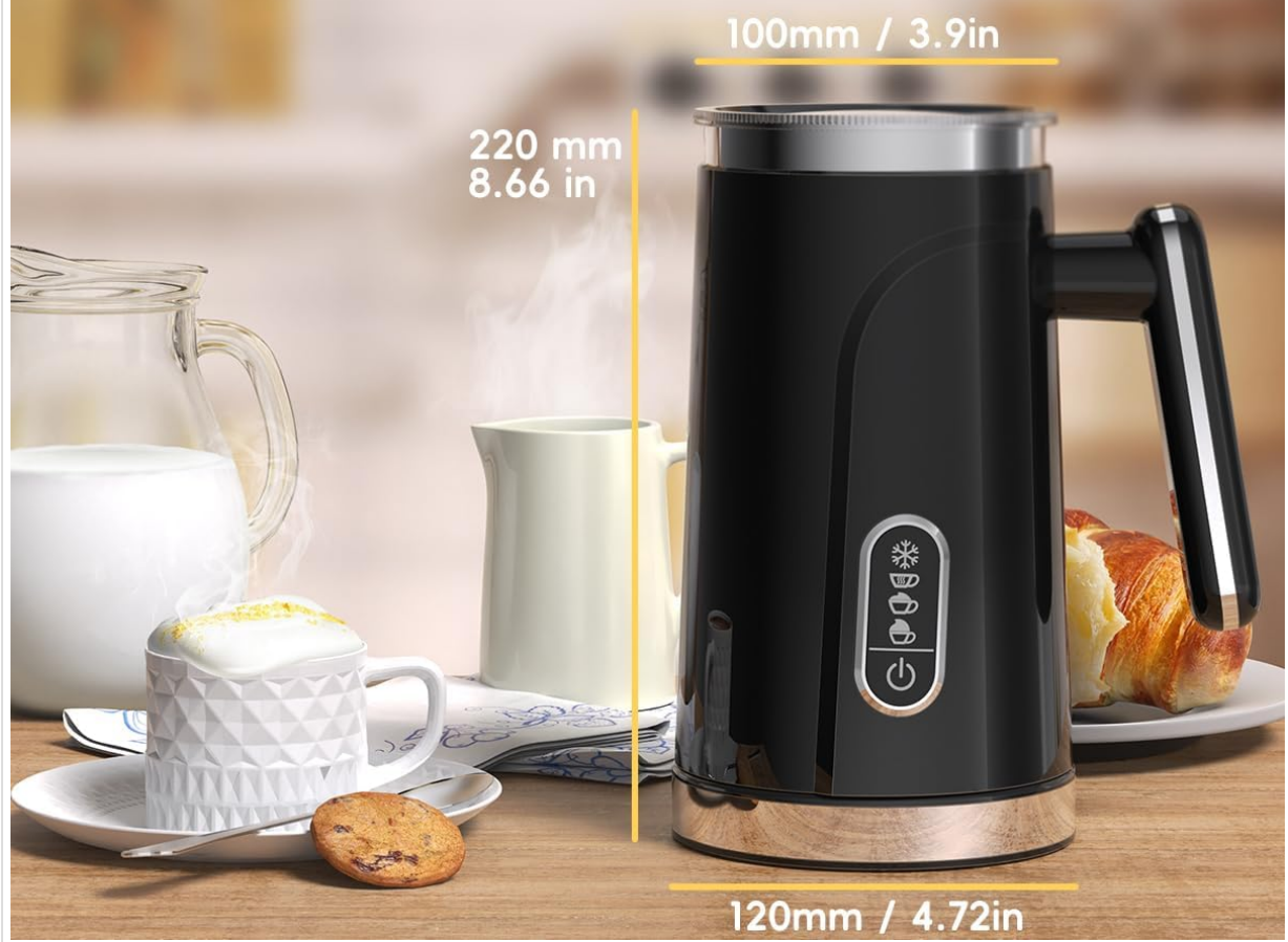
Image: The BioloMix BMF101 Electric Milk Frother showing its dimensions (100mm/3.9in width, 220mm/8.66in height, 120mm/4.72in base width).