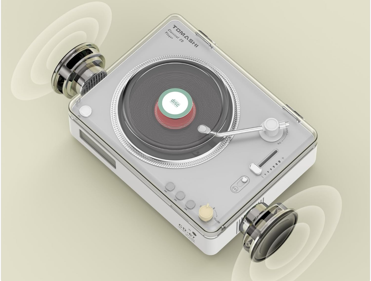
Figure 3.1: Independent enclosed cavity design with dual stereo speakers for high-fidelity sound.

Experience a hi-fi level of sound quality even with a CD player