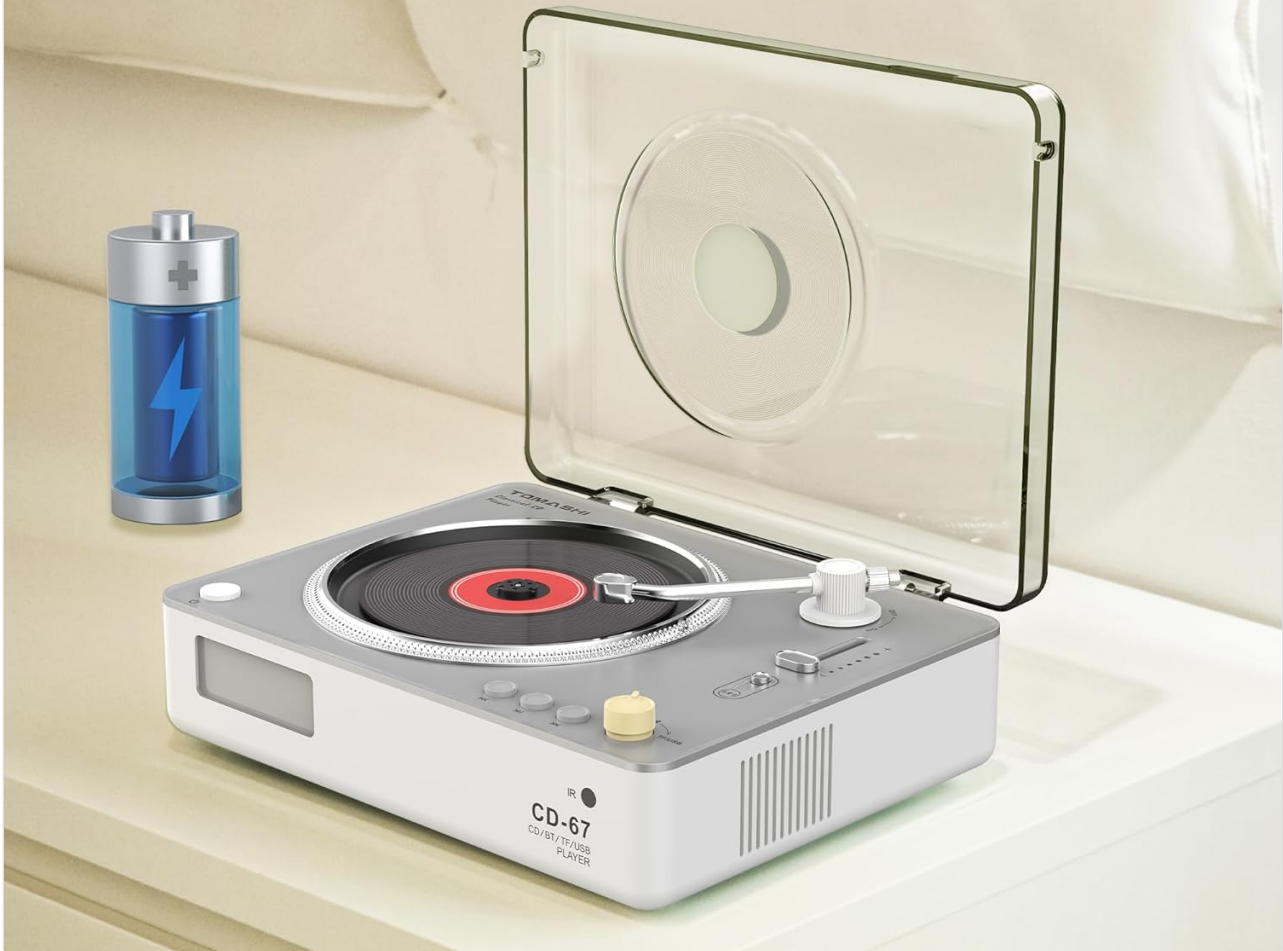
Figure 6.1: The CD player is equipped with a built-in lithium battery for extended playback.

playback at medium volume for 6-8 hours when fully charged The TYPE-C charging interface makes charging more convenient