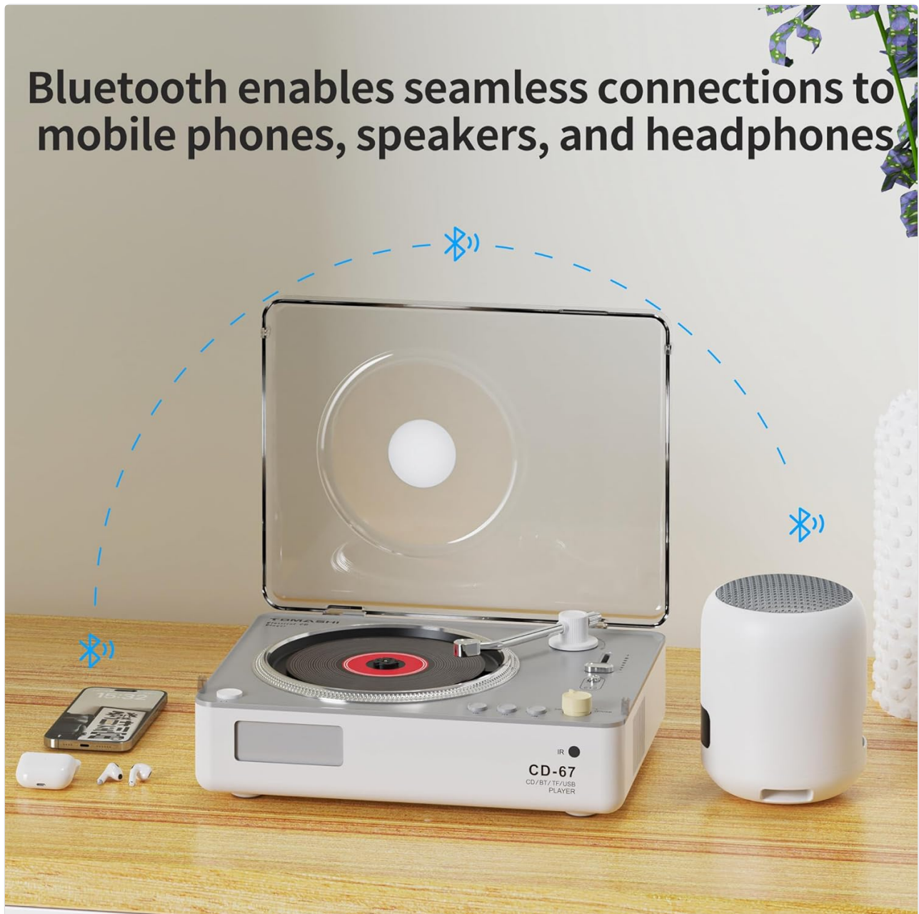
Figure 5.1: Bluetooth connectivity allows pairing with mobile phones, speakers, and headphones.