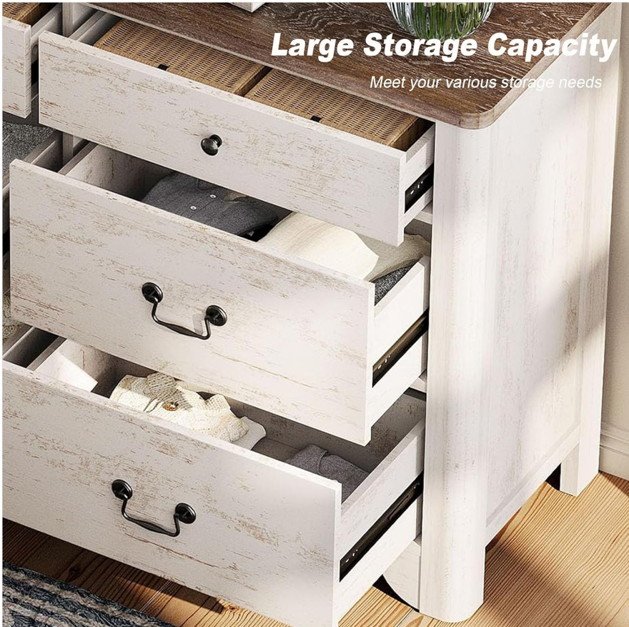
Image: Dresser drawers open, showcasing the internal storage space.