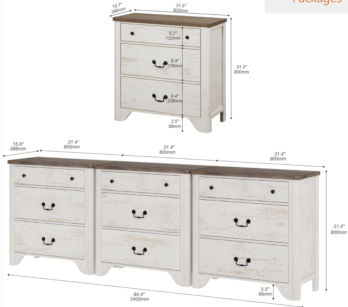
Image: Overview of the dresser dimensions and packaging information.