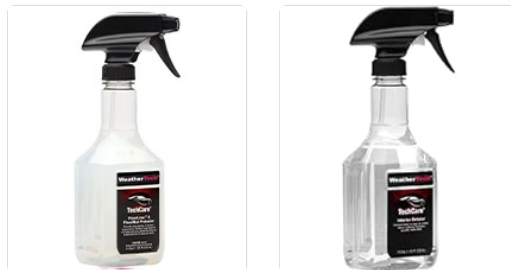
Image 4.2: WeatherTech TechCare cleaning and protection products for FloorLiners.