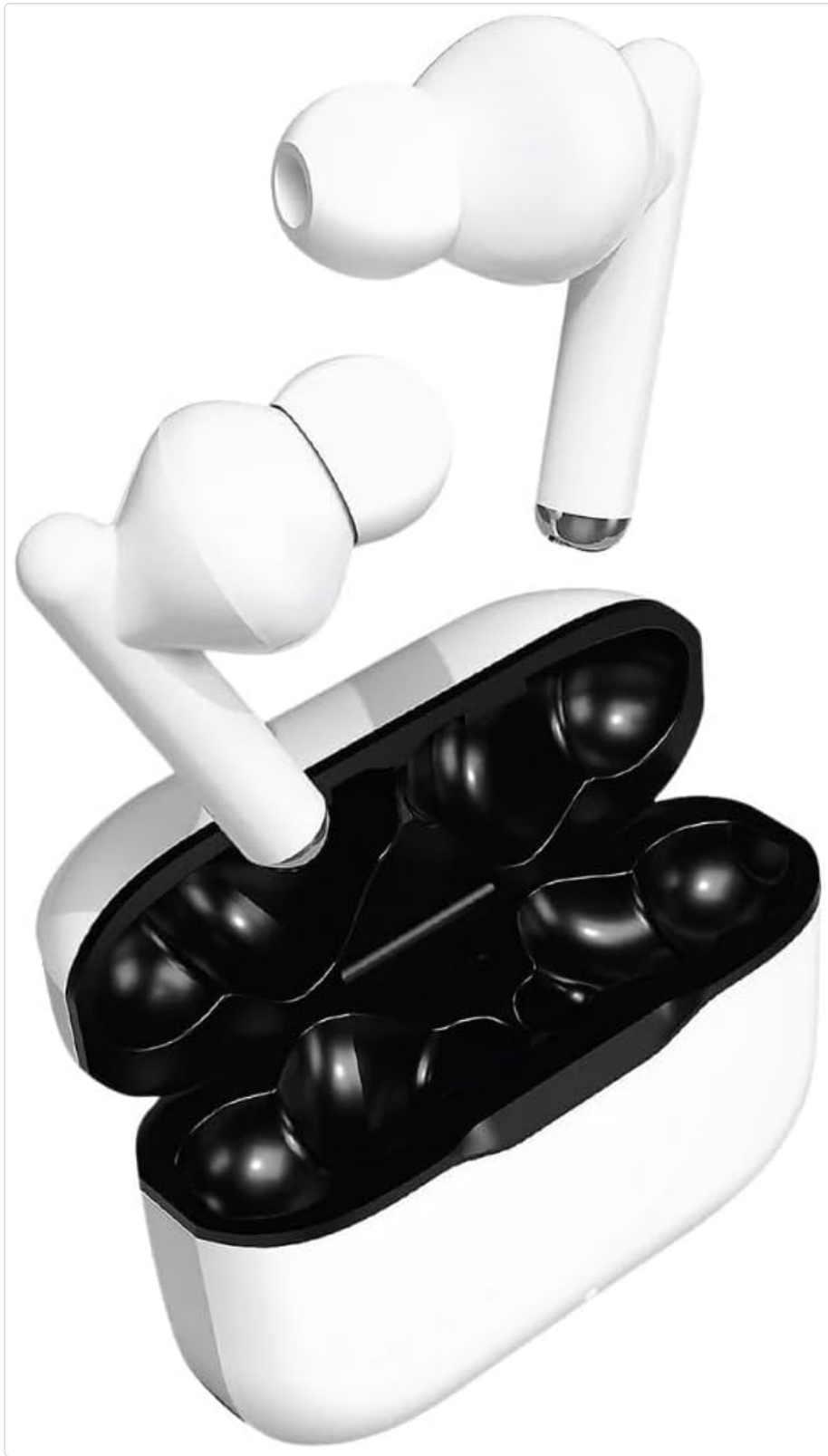
Image: The Replay Audio Pro 2 True Wireless Bluetooth Earbuds shown outside their open charging case, highlighting their sleek white design.