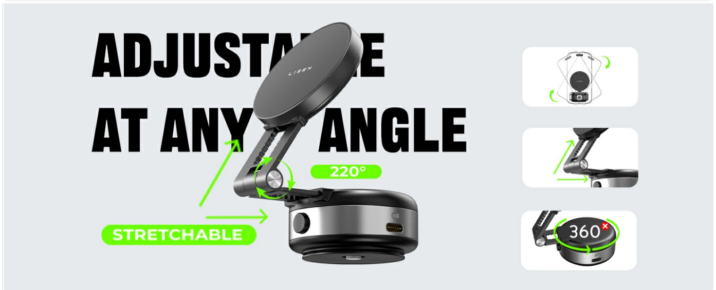
Figure 3: Charging the LISEN Phone Holder

Before first use, ensure the device is fully charged. Connect the provided USB-C cable to the charging port on the side of the holder and to a power source. A red light indicates charging. Once fully charged, the light will change (or turn off, depending on model). A full charge typically lasts approximately one month with normal use. Frequent movement of the holder may drain the battery faster.