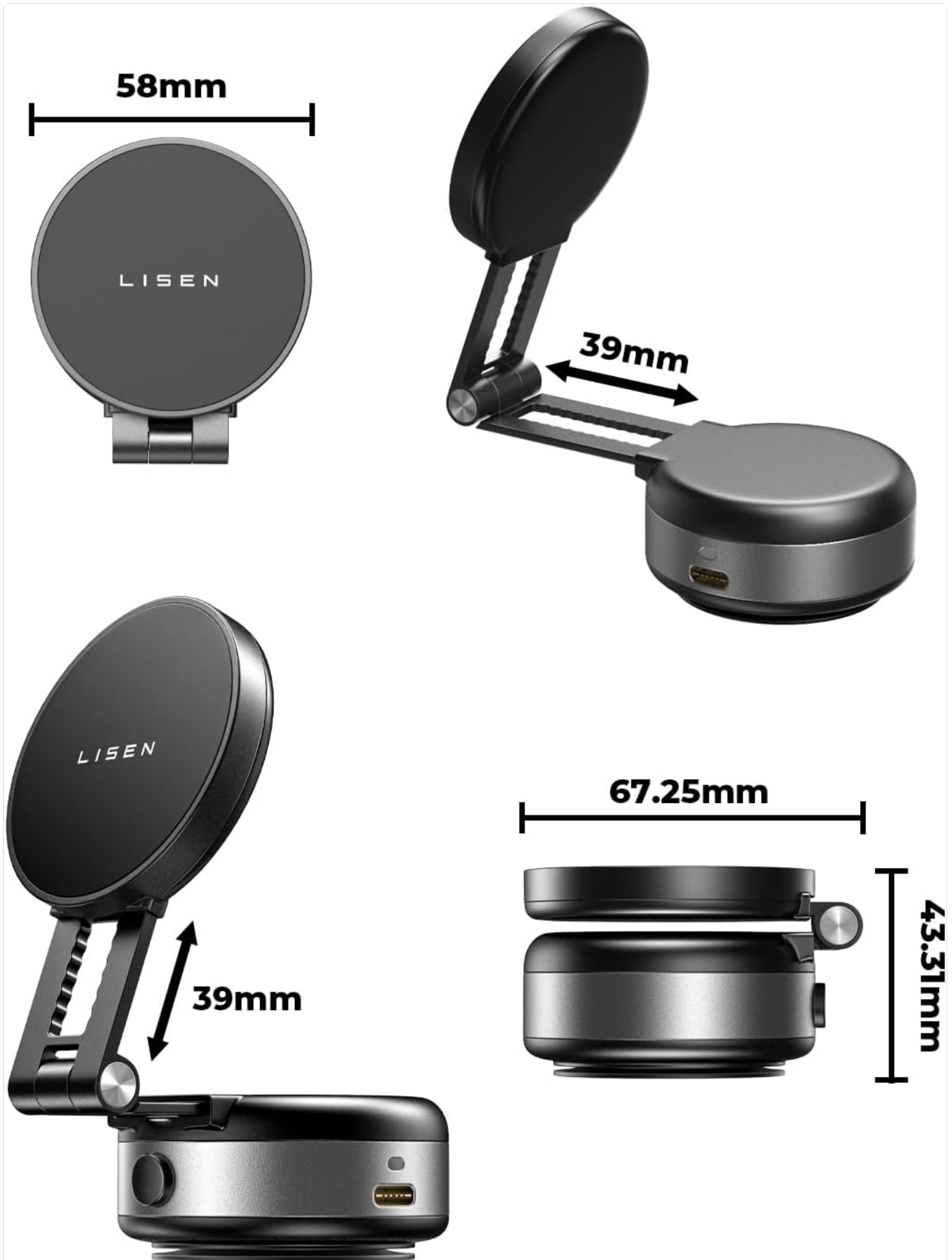
Figure 2: Product Dimensions

The LISEN phone holder features a foldable design for portability and an electric vacuum suction base for strong adhesion. It is equipped with a magnetic surface compatible with MagSafe-enabled iPhones.