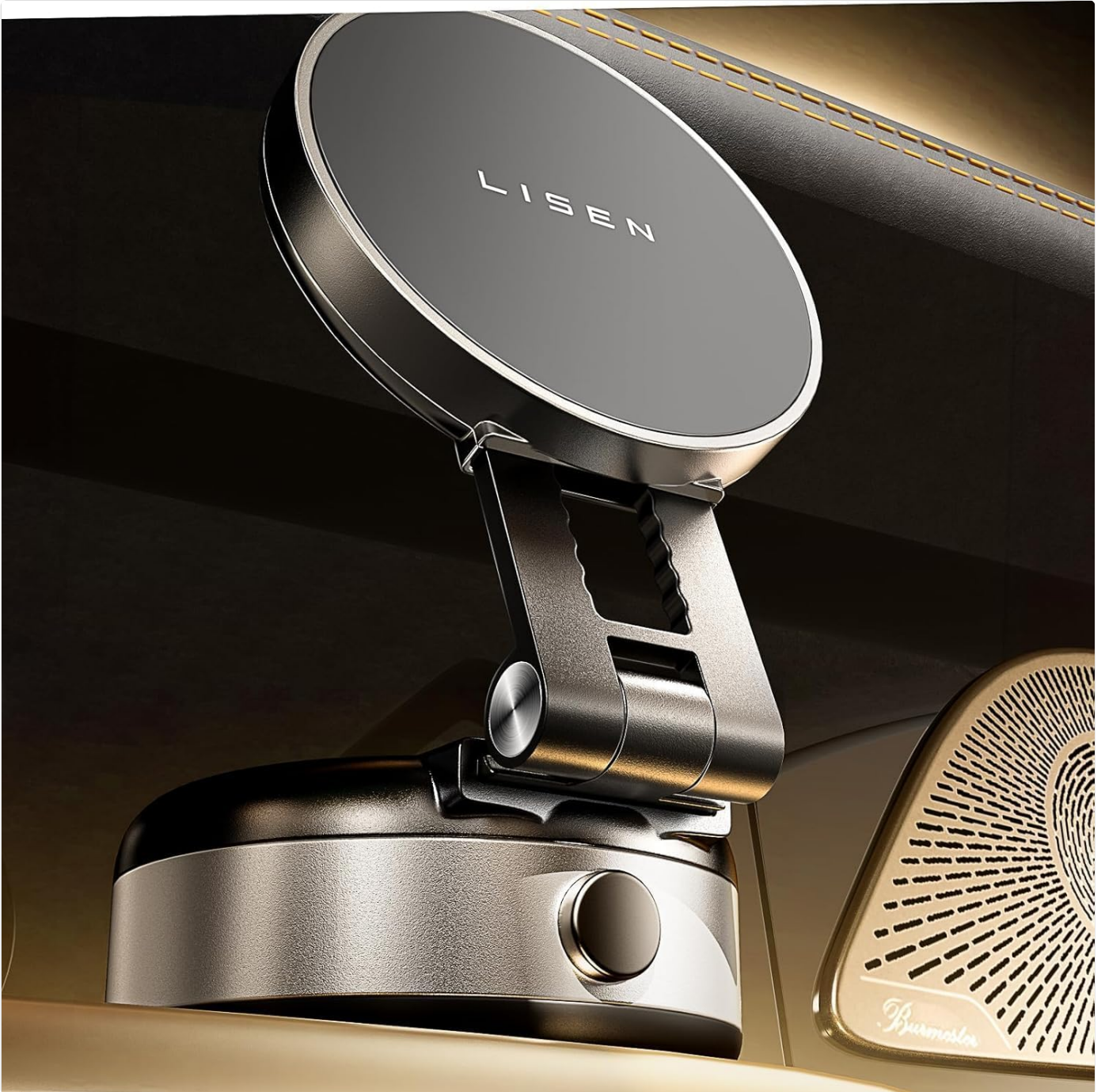
Figure 1: LISEN Portable Vacuum Magnetic Phone Holder Stand