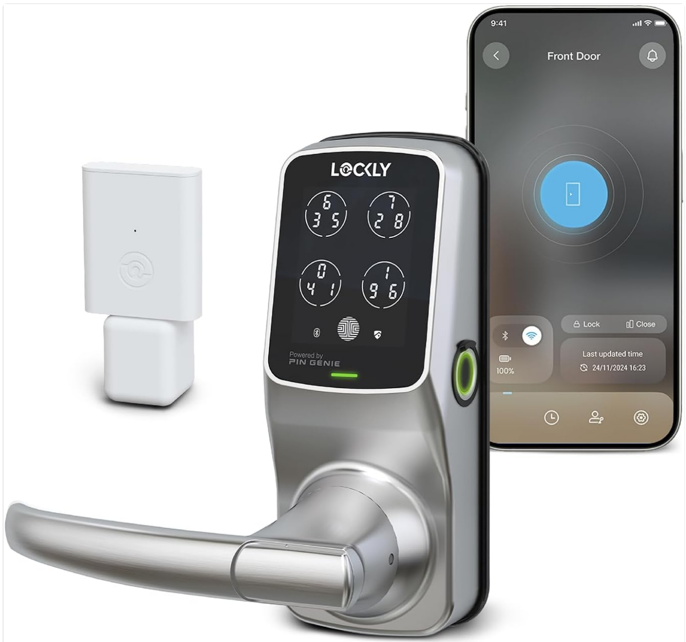
The Lockly Secure Pro Smart Lock system, including the lock, Wi-Fi hub, and a view of the companion mobile application.