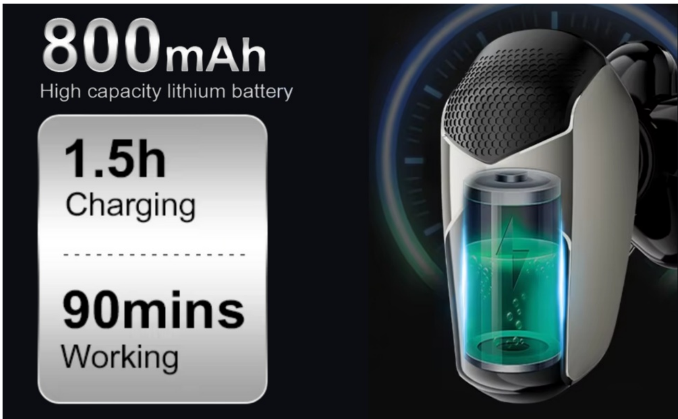
Image: An illustration showing the 800mAh lithium battery, indicating 1.5 hours charging time for 90 minutes working time (note: product specifications state 70 minutes runtime).