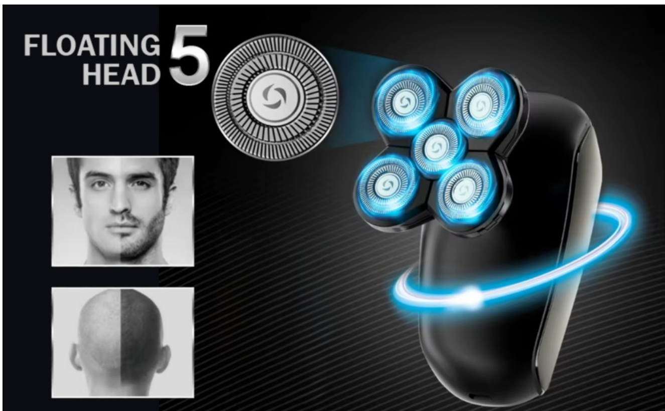
Image: The 5D floating head shaver demonstrating its flexible movement and close shaving capability for both face and head.