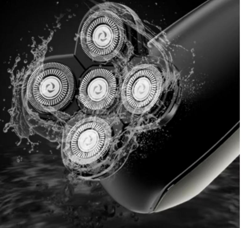
Image: The shaver head being rinsed under water, demonstrating its IPX6 (note: product description states IPX7) waterproof capability for easy cleaning.