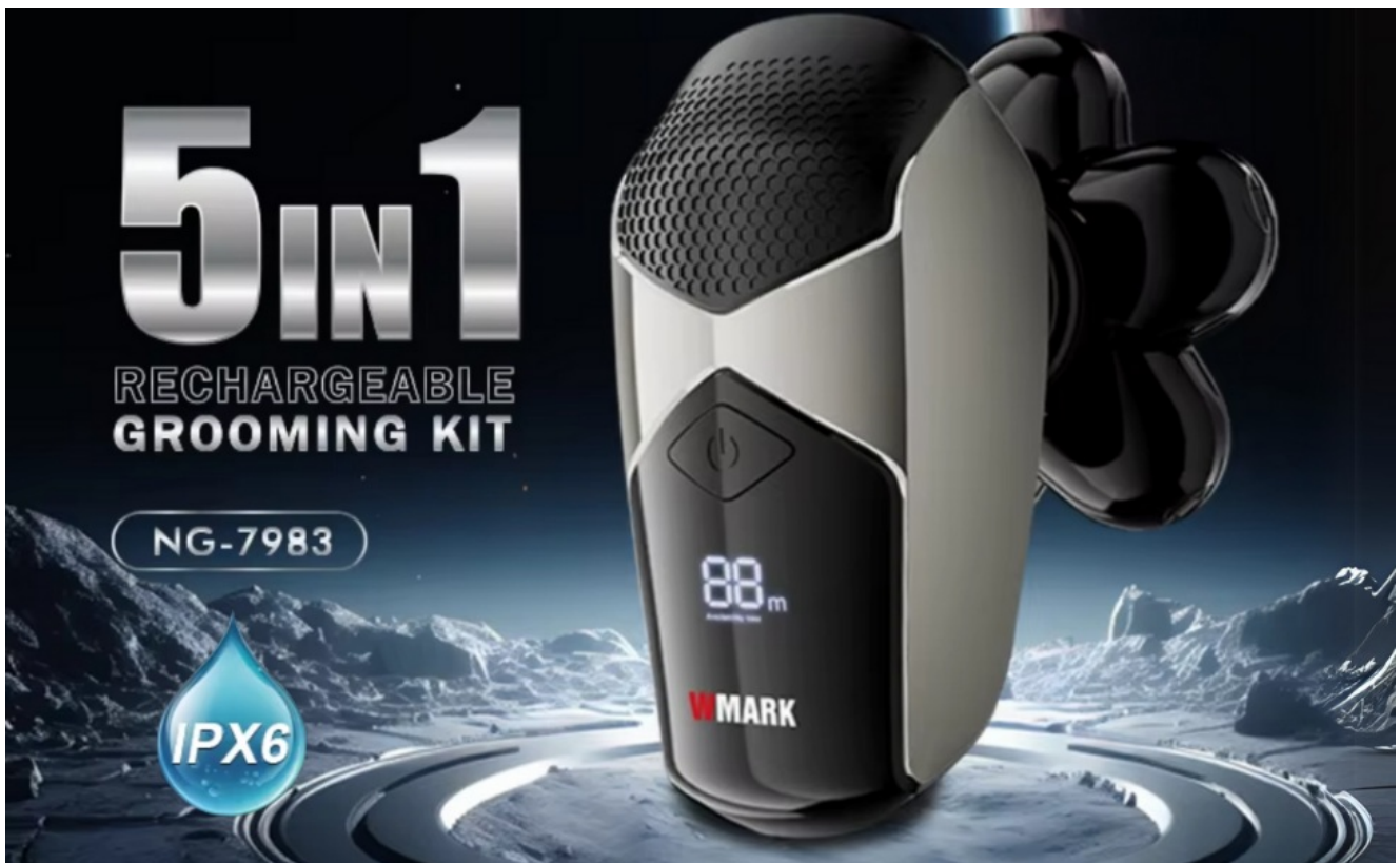
Image: The WMARK NG-7983 main unit with its five detachable grooming attachments, illustrating its multi-functional design.