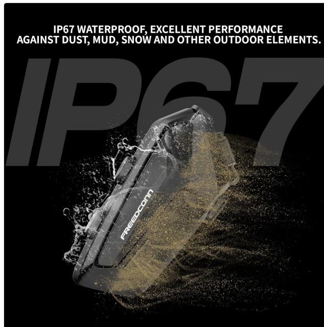
Image: IP67 waterproof rating.