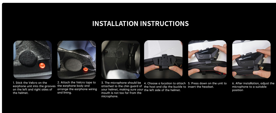
Image: Visual guide for headset installation.