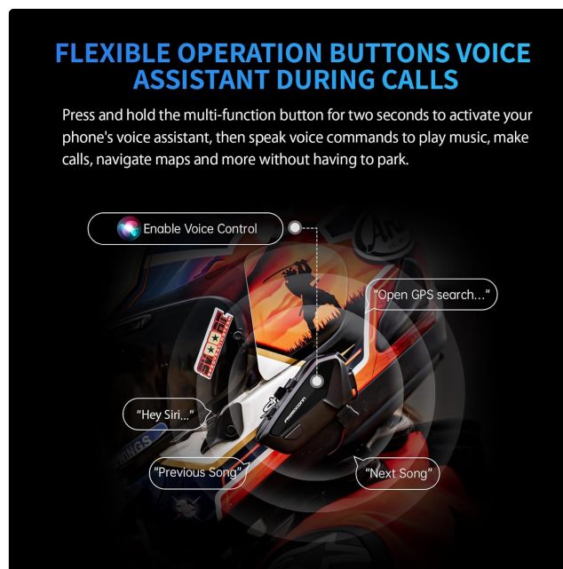
Image: Voice assistant activation and commands.

Press and hold the multi-function button for two seconds to activate your phone's voice assistant. You can then speak voice commands to play music, make calls, navigate maps, and more without needing to interact with your phone directly.