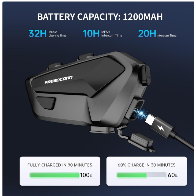
Image: Battery performance details.