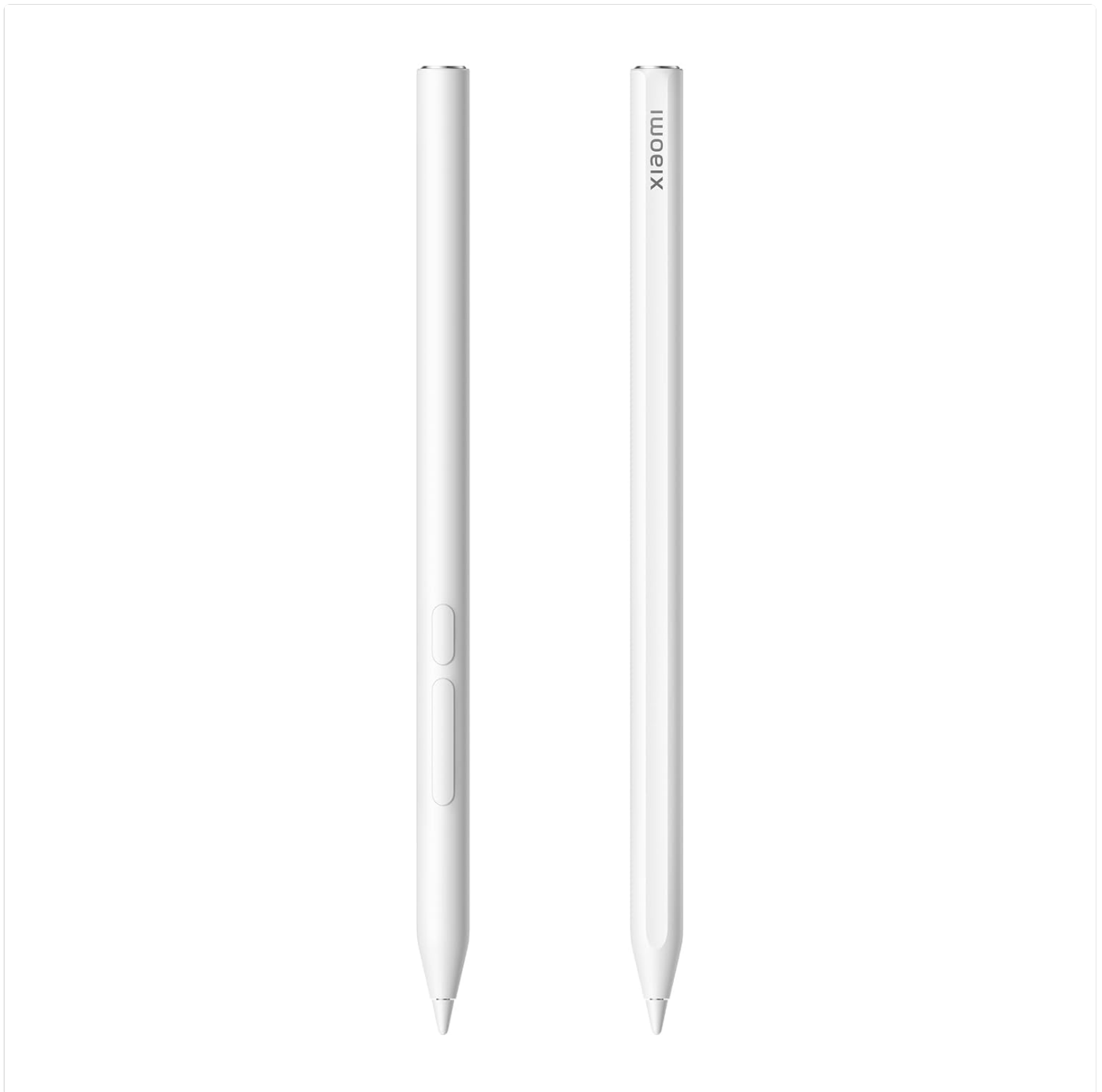
Image: Front and back view of the Xiaomi Focus Pen, showcasing its sleek white design.