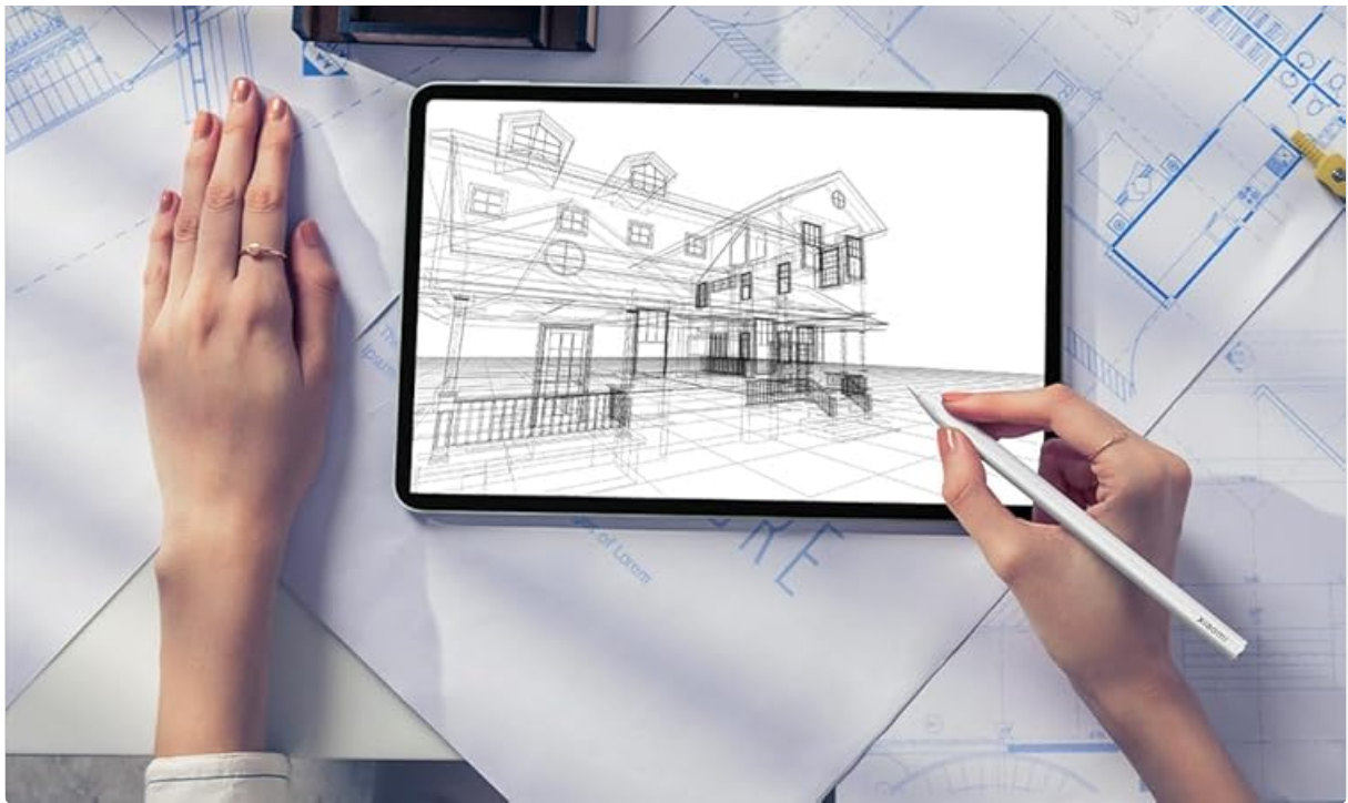
Image: A user demonstrating writing and drawing on a Xiaomi Pad 7 using the Focus Pen, emphasizing the 8192 levels of pressure sensitivity and 3ms latency for a fluid experience.