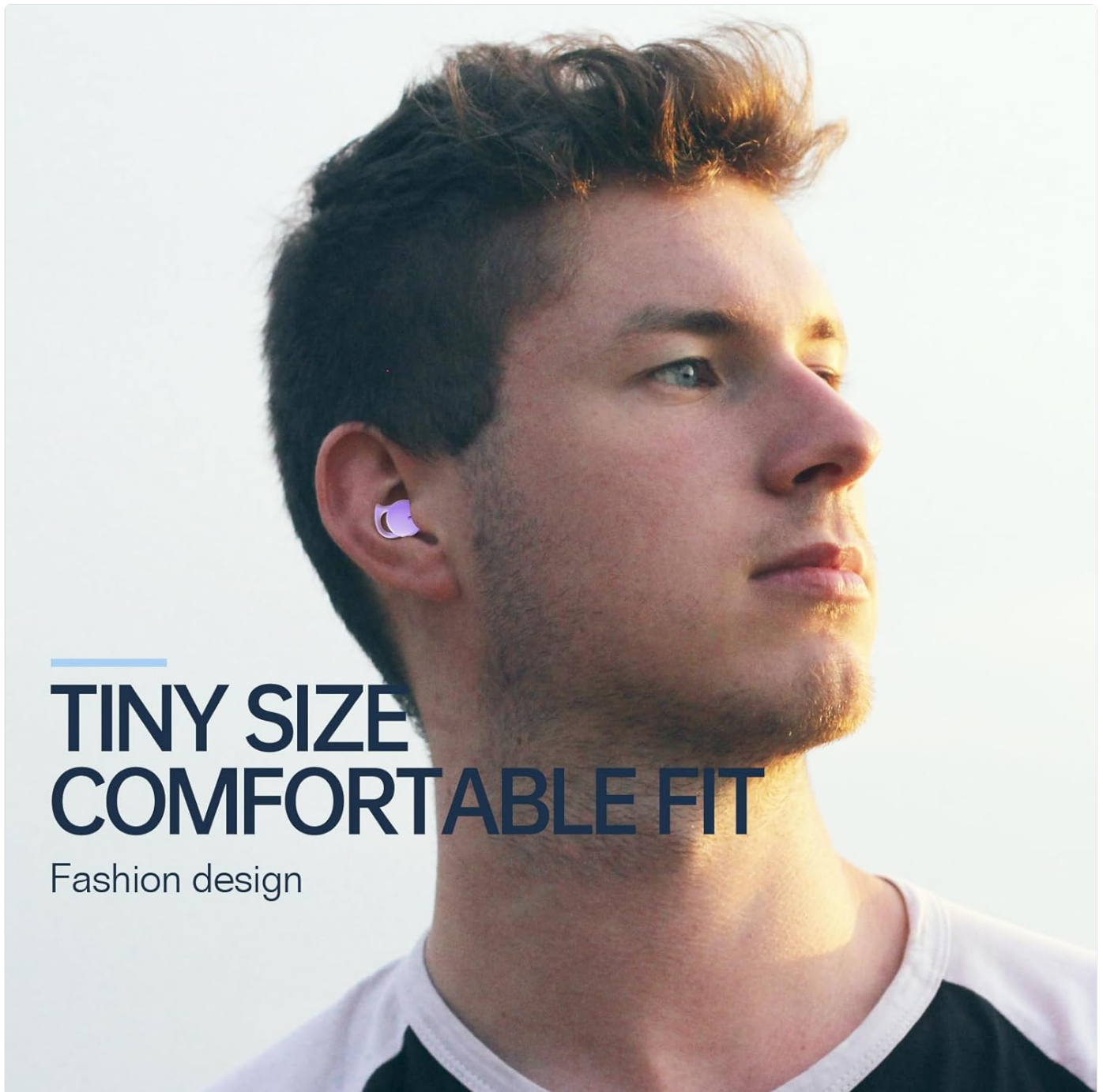
Figure 4: The compact design of the earbud ensures a discreet and comfortable fit.