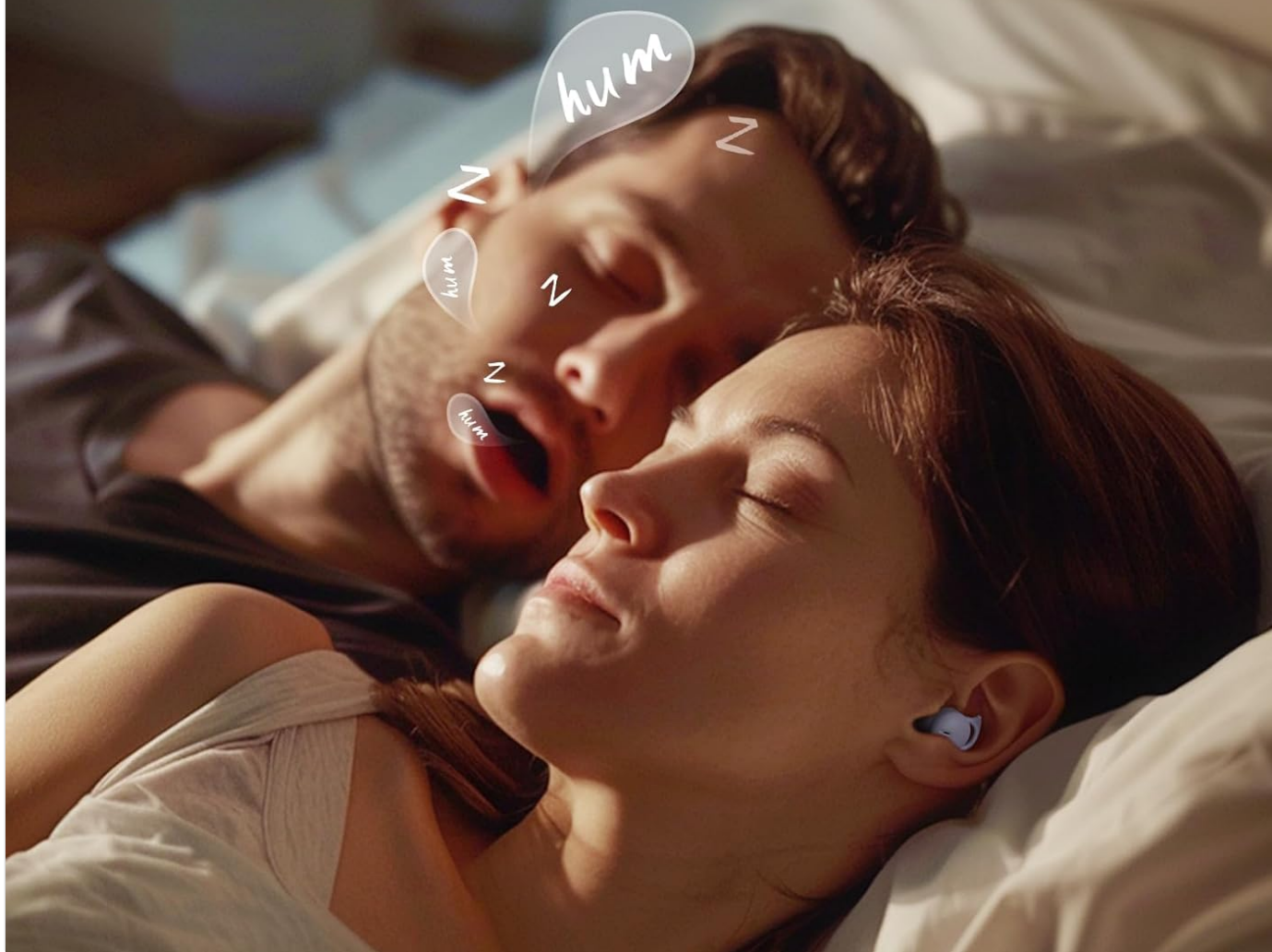
Figure 5: Earbuds provide a snug fit to naturally block out noise for peaceful sleep.

No longer hear annoying snoring. Naturally blocks out noise with its snug fit, ensuring peaceful sleep.