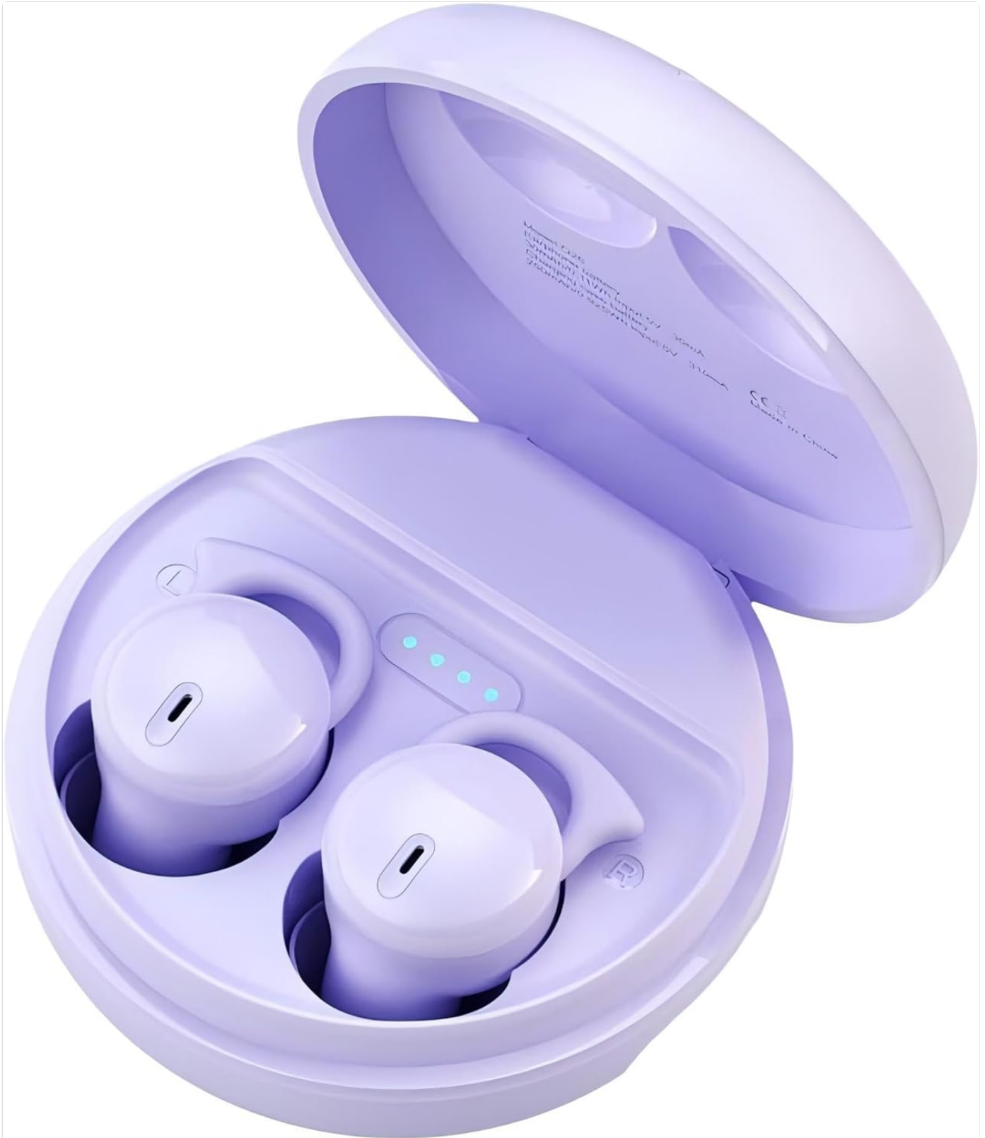
Figure 2: The charging case with earbuds inserted. The case features indicator lights to show battery status.