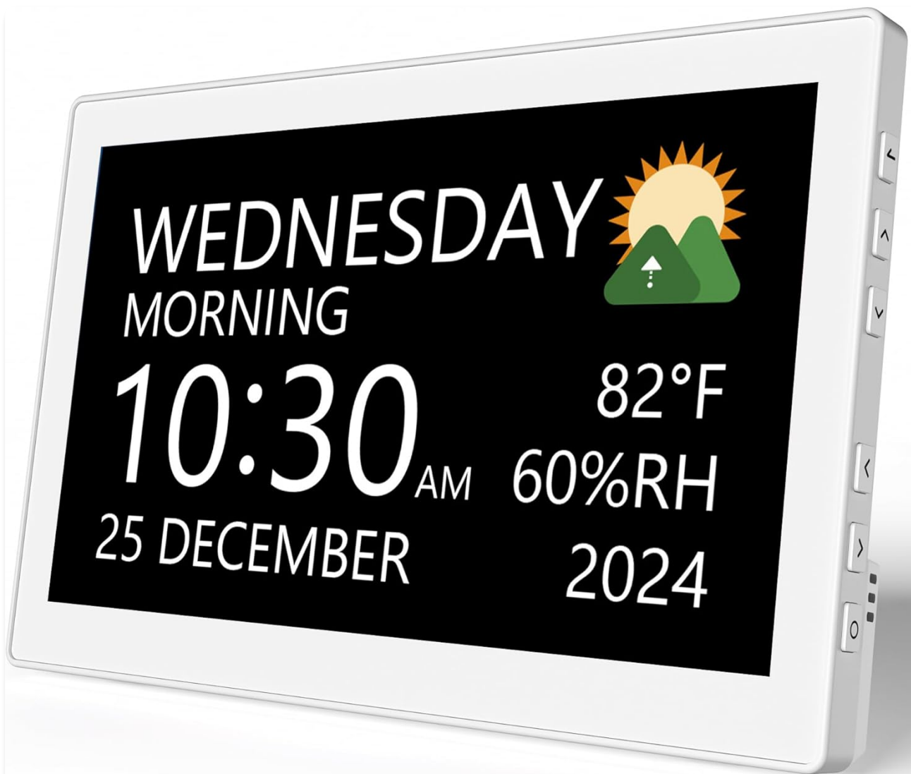
Figure 1: Raynic Digital Calendar Clock (White, 10.1 Inches)