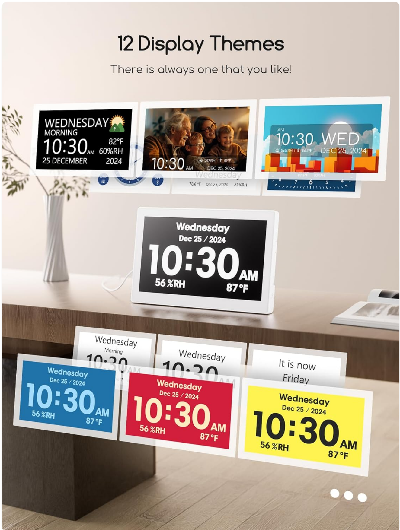
Figure 5: Available Display Themes

3. Press Select to apply your chosen theme.