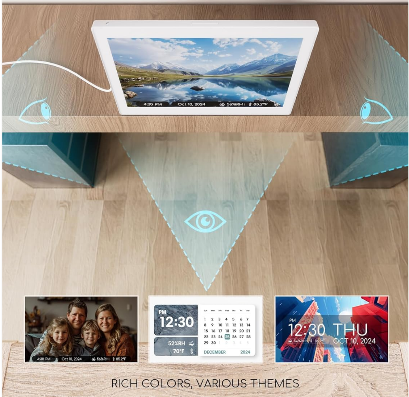
Figure 9: IPS Screen for Photo Display

178° wide in-plane switching for vibrant colors and clarity from any angle.