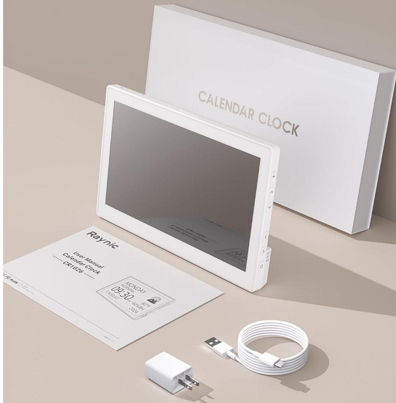
Figure 2: Packaging List