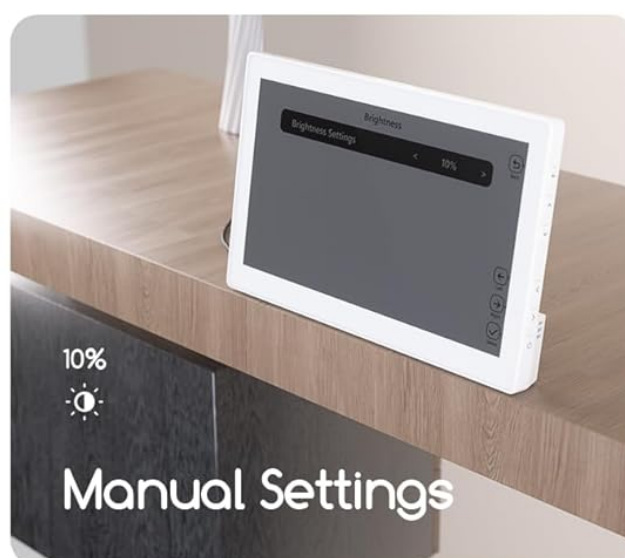
Figure 7: Brightness Adjustment Options