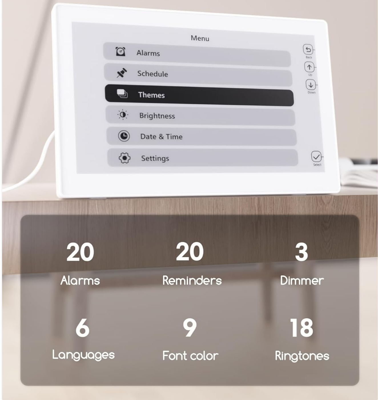
Figure 4: Main Menu Interface