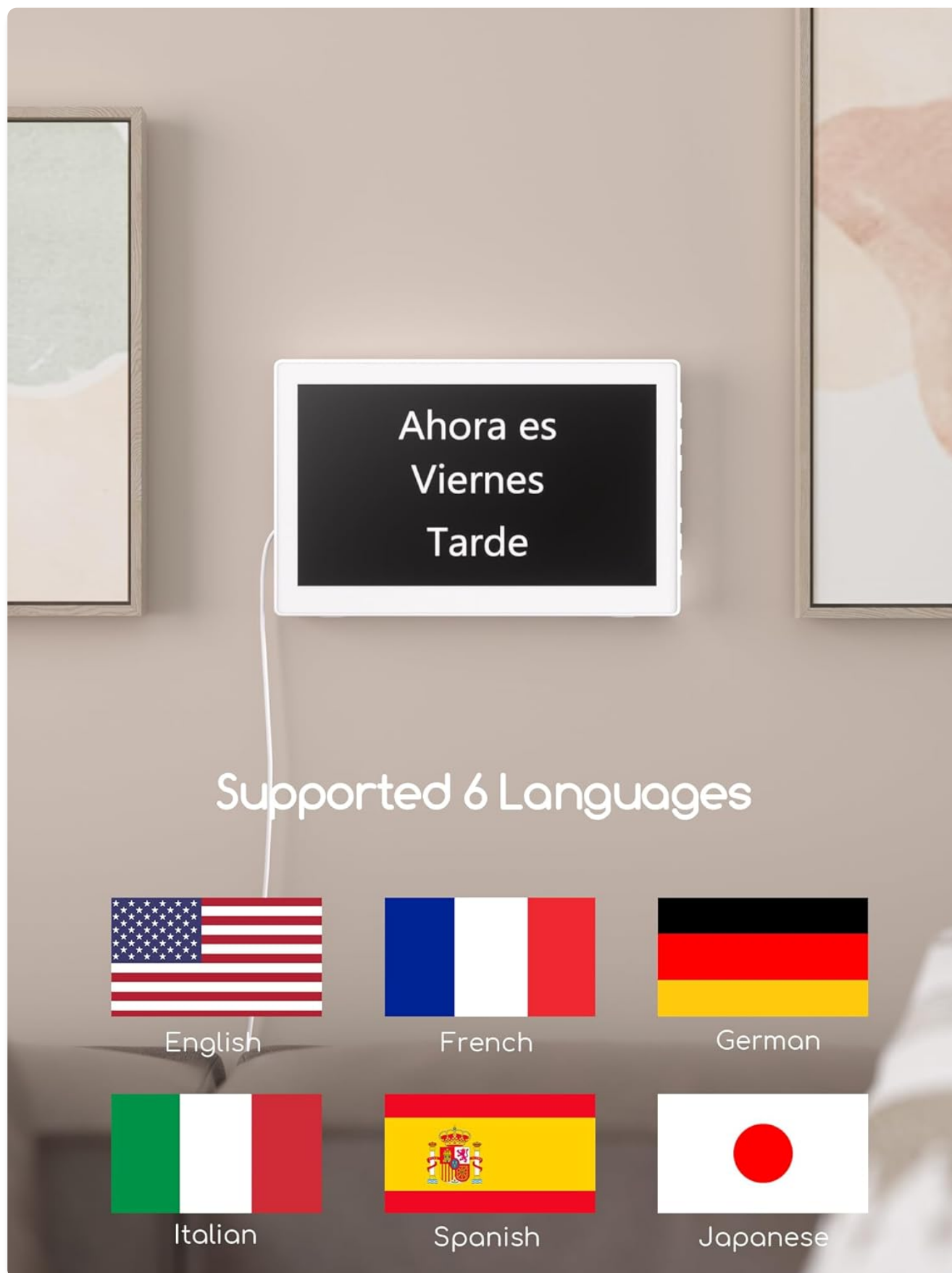
Figure 8: Supported Languages