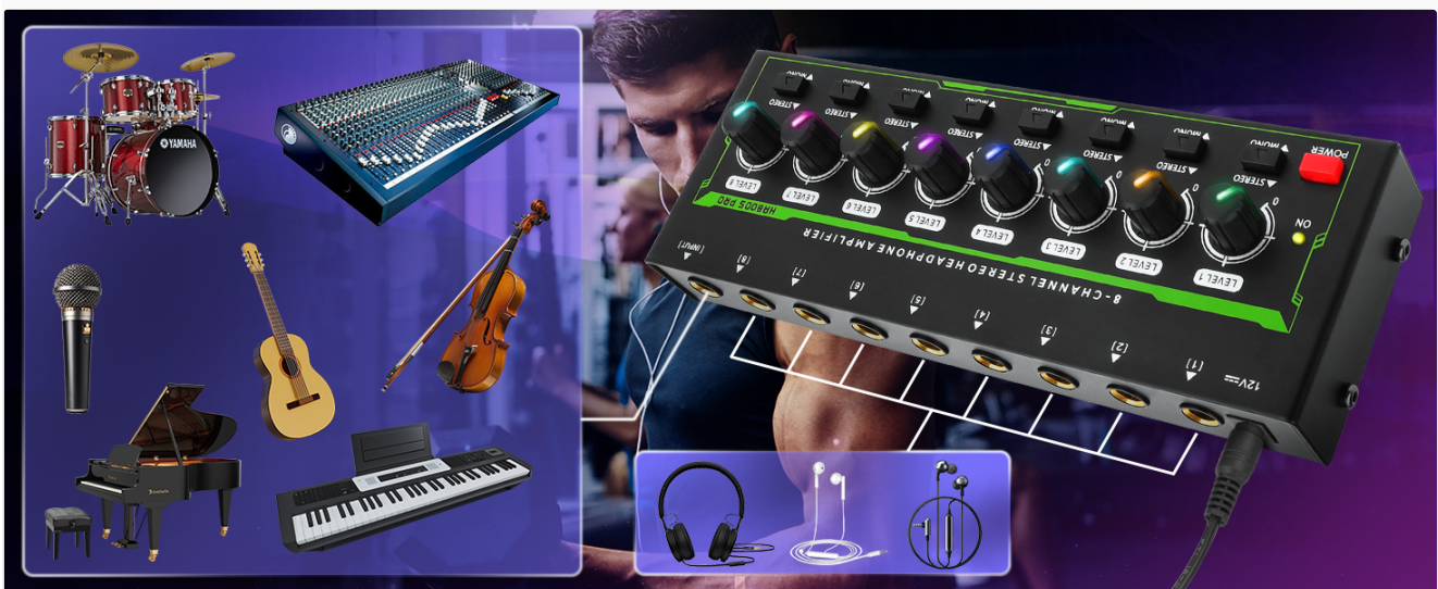
Image: A visual guide demonstrating how to connect the 12V power supply, the 6.35mm audio input, and up to eight 6.35mm headphone outputs to the HA800S Pro.