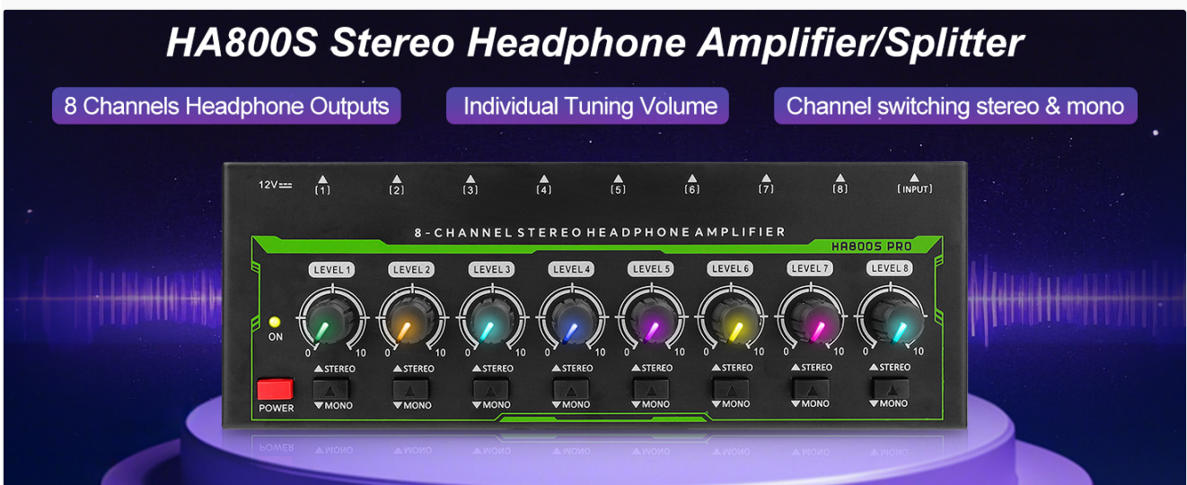
Image: A detailed view of the front panel, illustrating the stereo/mono switch buttons for each channel, allowing users to easily toggle between modes.