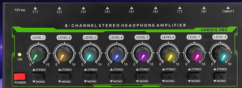
Image: The front panel of the HA800S Pro, featuring the power switch, 8 individual volume knobs with RGB lighting, and 8 stereo/mono selector buttons.