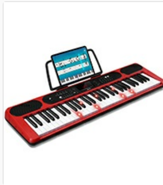
Image: Visual representation of the package contents, including the keyboard, music stand, X-style piano stand, power adapter, and user manual.

Video: An unboxing and tutorial video demonstrating the setup and basic functions of the LEKATO 61-Key Electronic Piano.