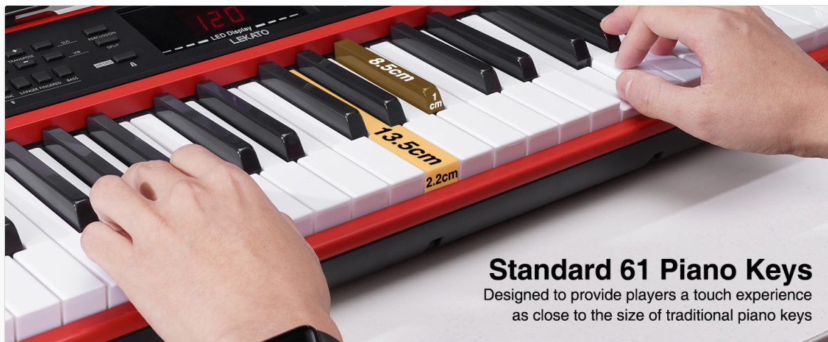
Image: The LEKATO 61-Key Keyboard Piano, emphasizing its lighted keys and beginner-friendly teaching modes.