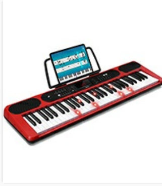
Image: A visual list of items included in the package, such as the keyboard, music stand, X-style piano stand, and power adapter.