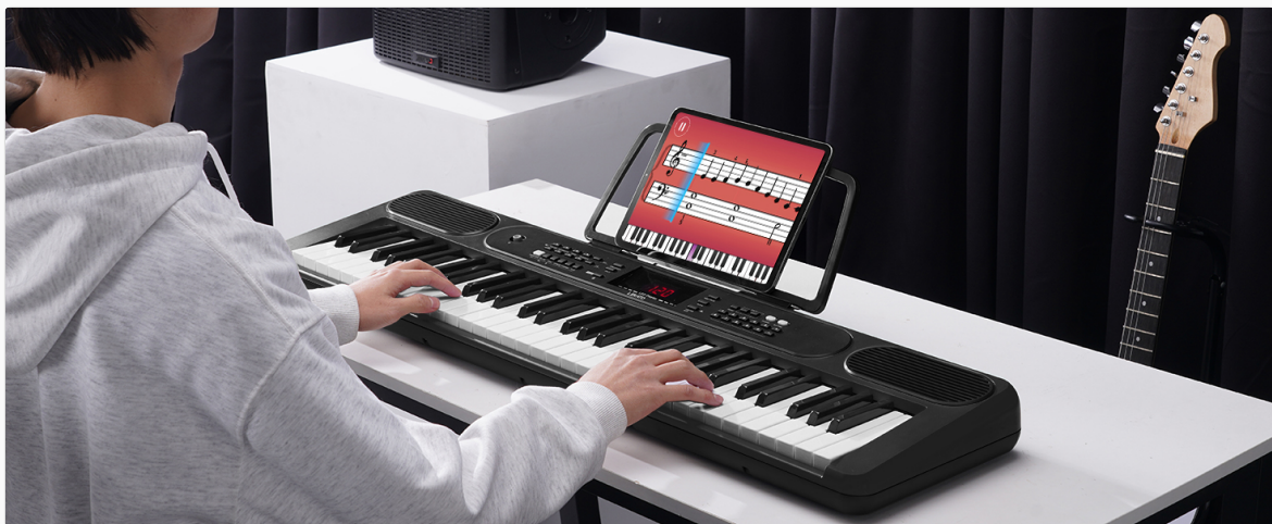
Image: LEKATO 61-Key Electronic Keyboard, highlighting its lighted keys and music stand.

Welcome to the world of music with your new LEKATO 61-Key Keyboard Piano. This digital piano is designed for both beginners and experienced musicians, offering a rich array of features to enhance your musical journey. With lighted keys, multiple teaching modes, and versatile connectivity, you can explore various sounds and rhythms with ease.