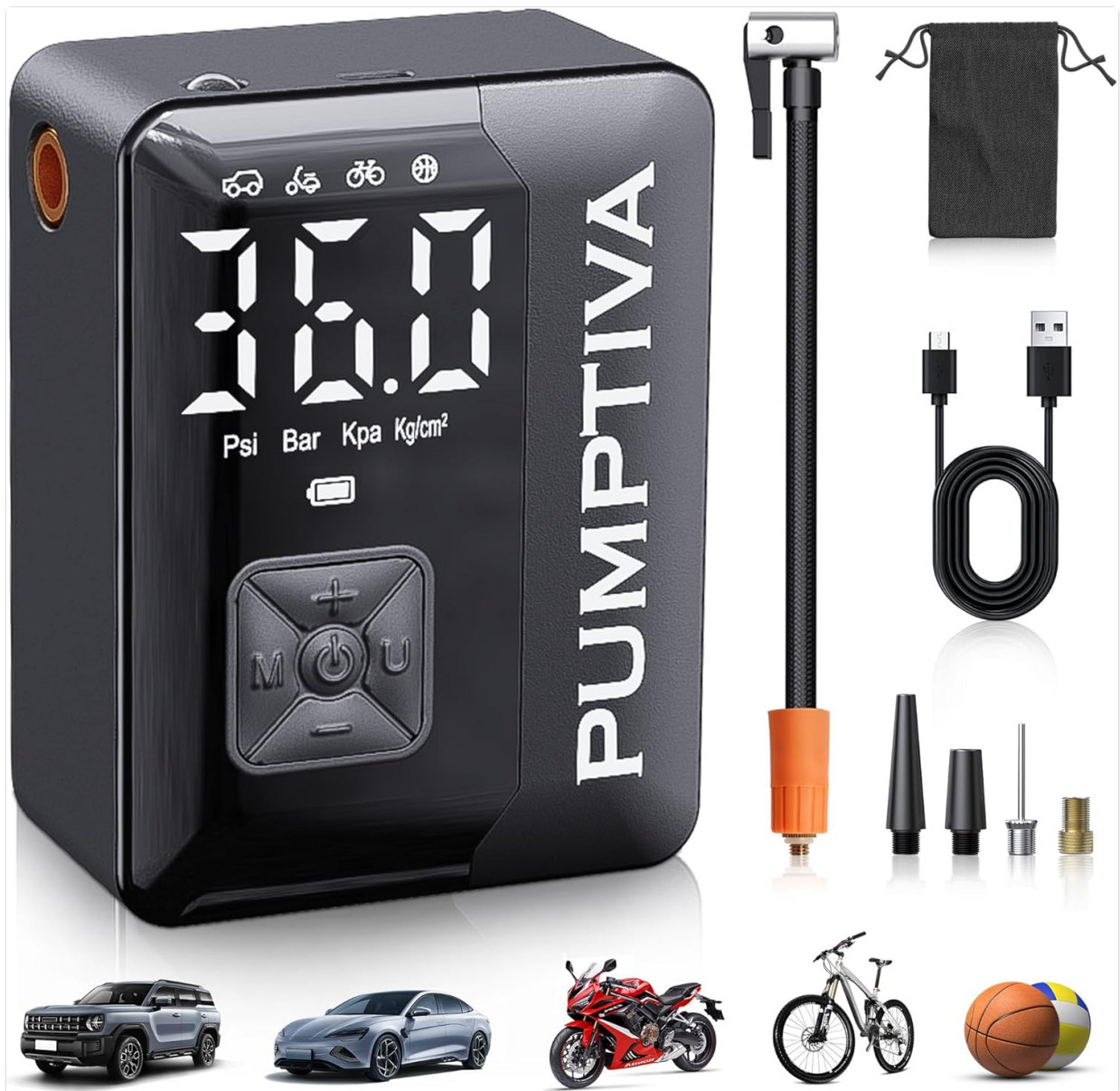
Image: The Pumptiva P011 Portable Tire Inflator shown with its included accessories, including various nozzles, charging cable, and storage bag.