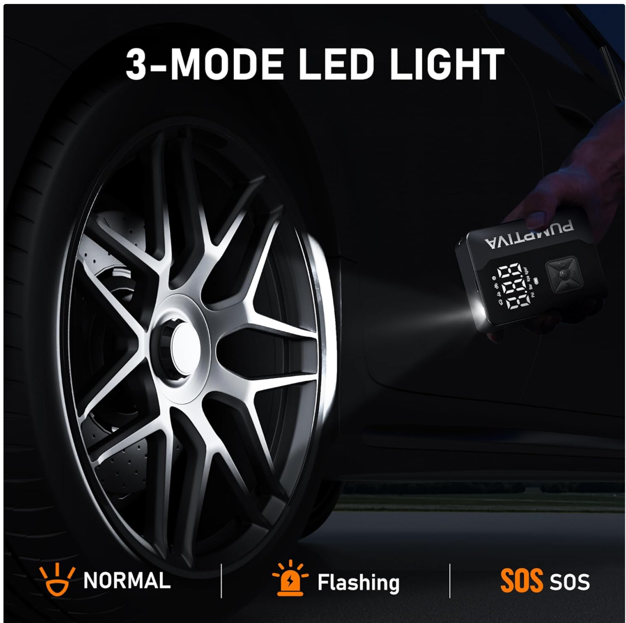
Image: The Pumptiva P011's integrated LED light, illustrating its three modes: Normal illumination, Flashing for attention, and SOS for emergency signaling.