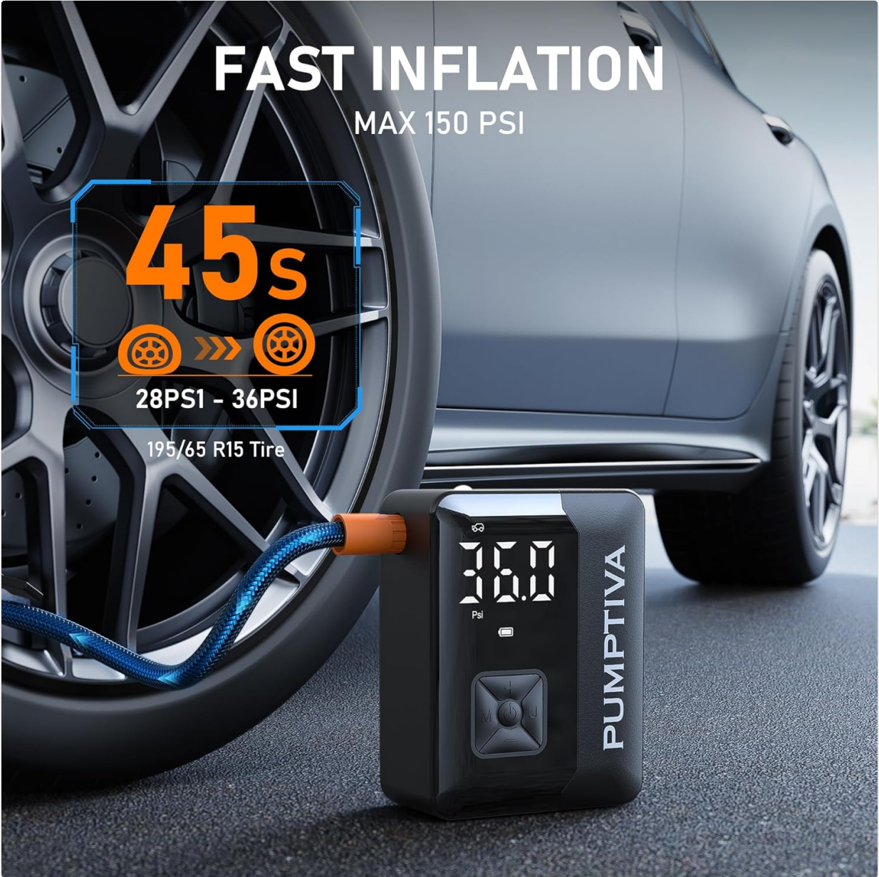
Image: The Pumptiva P011 inflating a car tire, highlighting its fast inflation capability (e.g., 28 PSI to 36 PSI in 45 seconds for a 195/65 R15 tire).