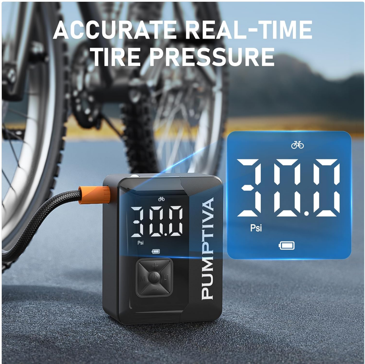
Image: The digital LCD display of the Pumptiva P011 showing accurate real-time tire pressure, ensuring precise inflation.