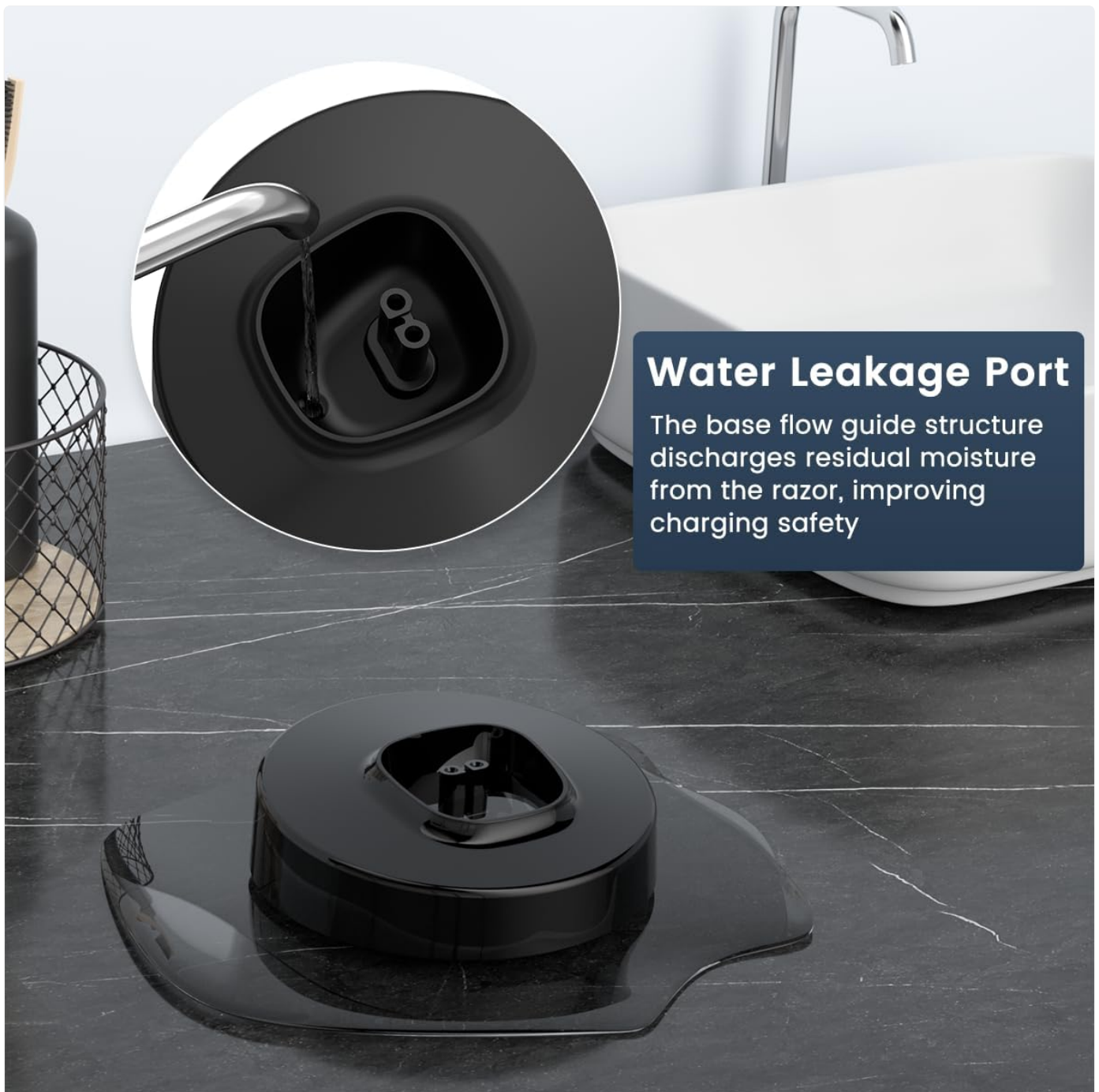
Image: A close-up view of the BENSN Charger Stand's base, highlighting the water leakage port designed to drain moisture and improve charging safety.