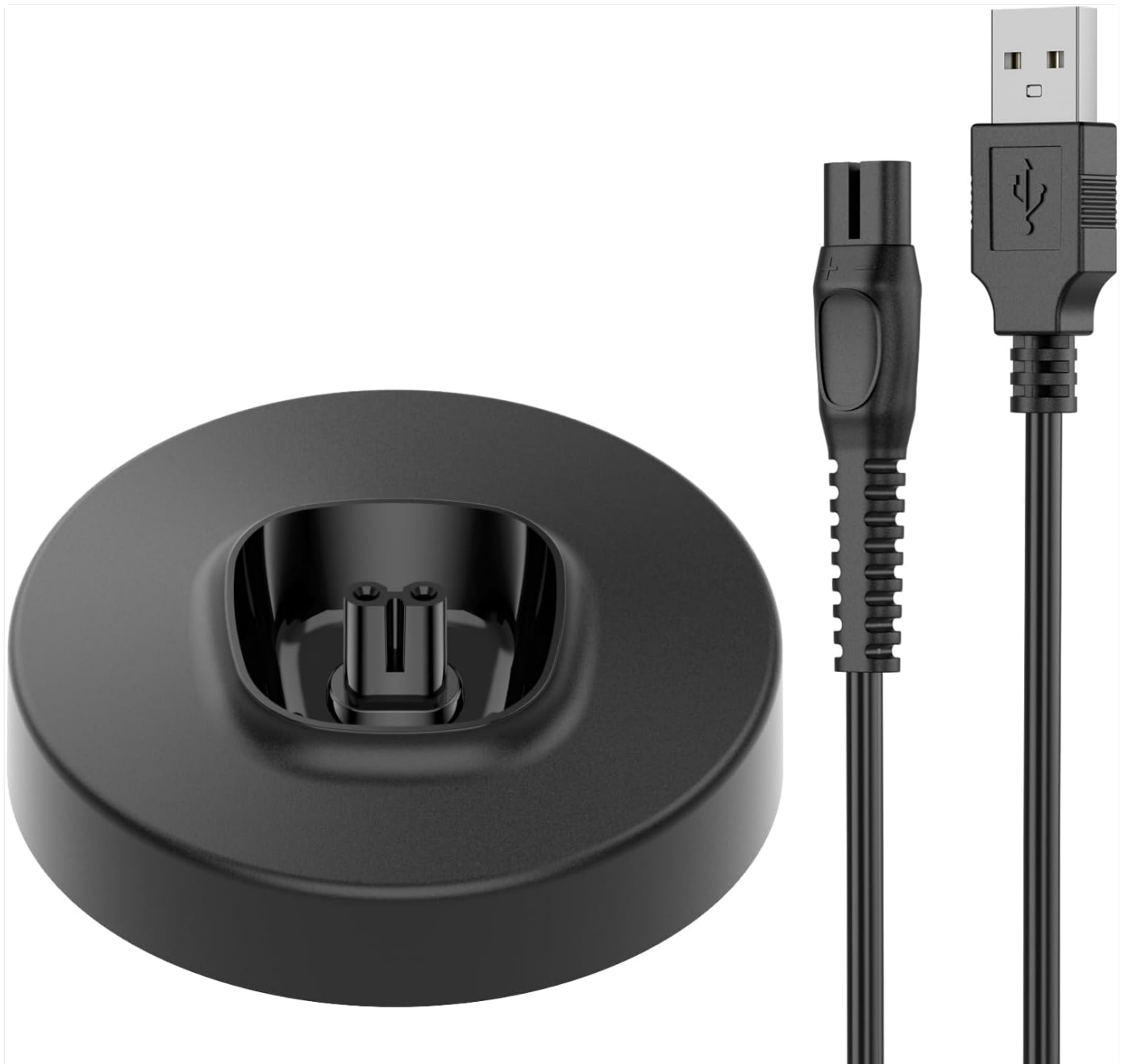
Image: The BENSN Charger Stand (black, circular base) and its accompanying USB charging cable. The stand features a proprietary connector for the shaver, and the cable has a standard USB-A connector on one end and the proprietary shaver connector on the other.