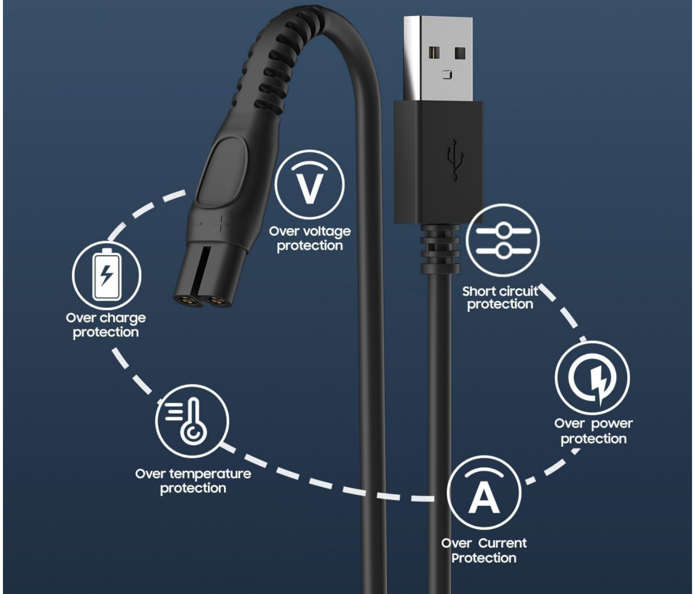
Image: Left: Illustration of the cable's ultra-durability with 30,000+ bend lifespan, highlighting military-grade materials and PVC material. Right: Diagram showing the efficient protection features of the charger, including over voltage, over charge, over temperature, short circuit, over power, and over current protection.