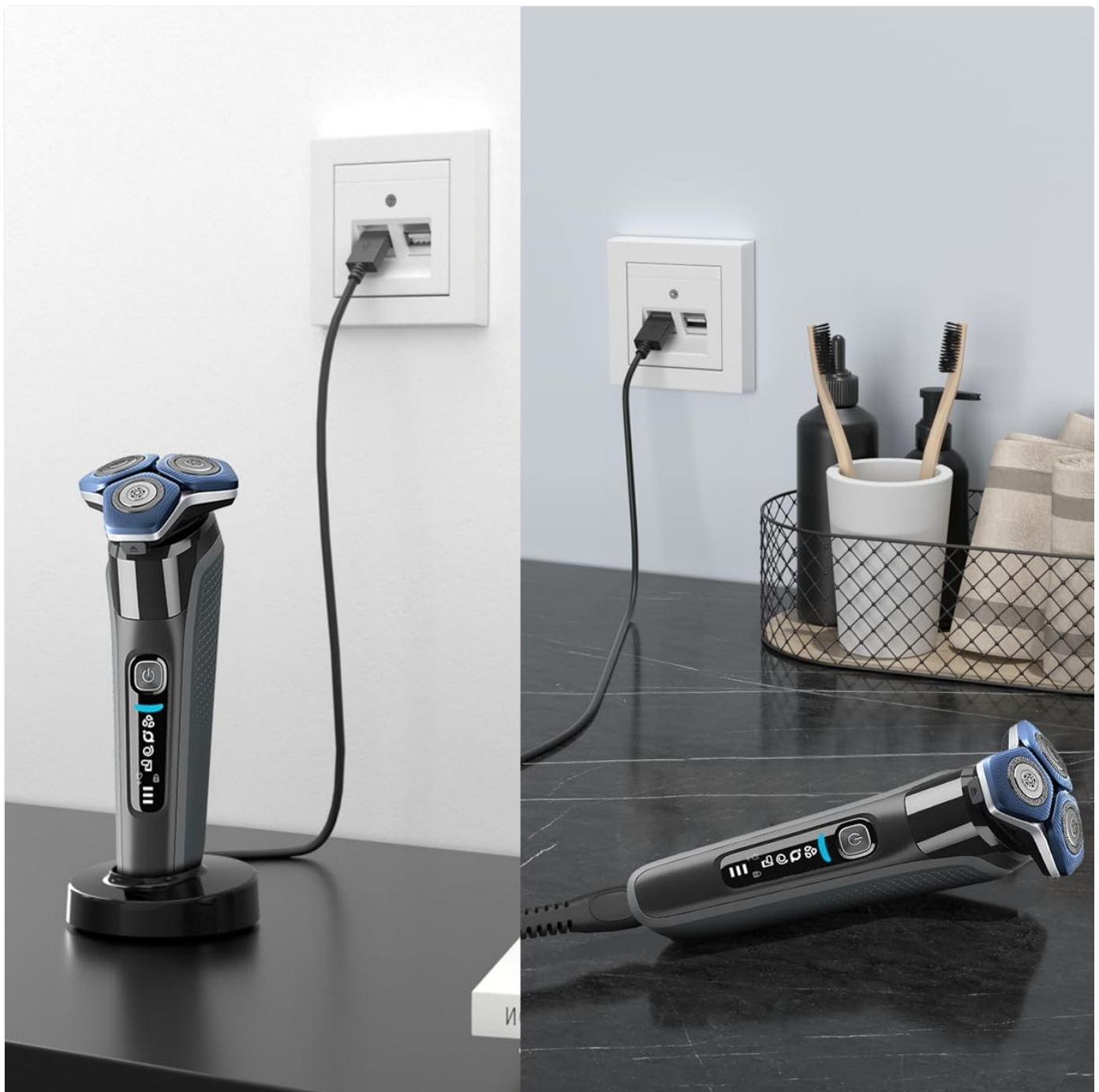
Image: A Philips Norelco Shaver placed upright on the BENSN Charger Stand, connected to a wall outlet via the USB cable, illustrating the charging process.