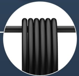
Military Grade Materials