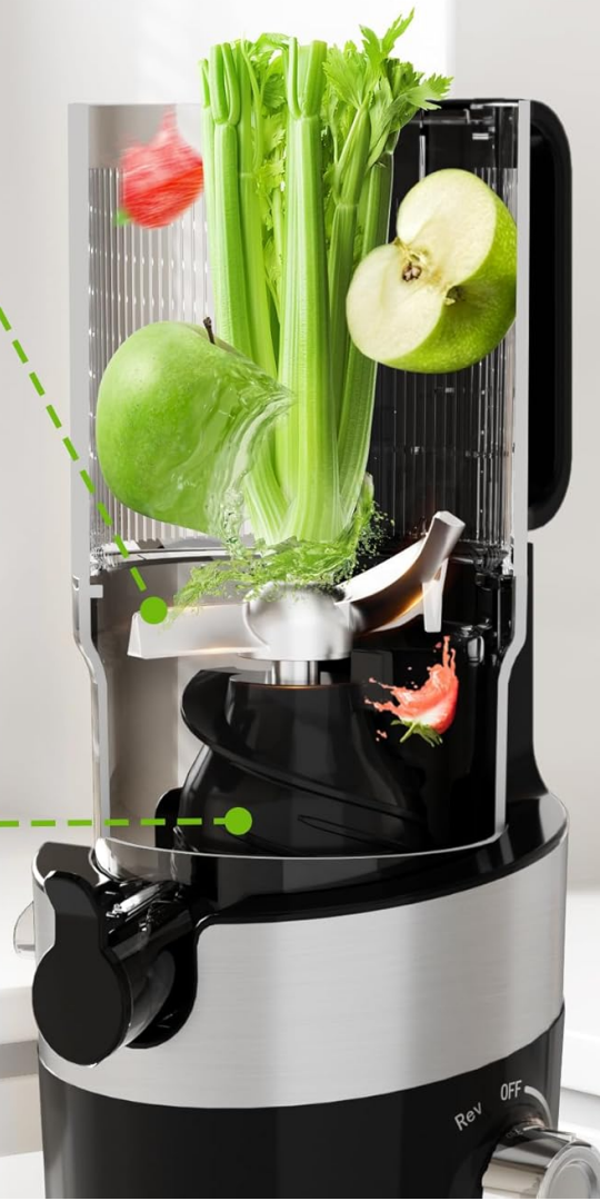
Image: An exploded view showing how the built-in blades automatically cut fruits and vegetables, and the multi-stage auger efficiently processes them.

Multi-Stage auger makes juicing more efficient