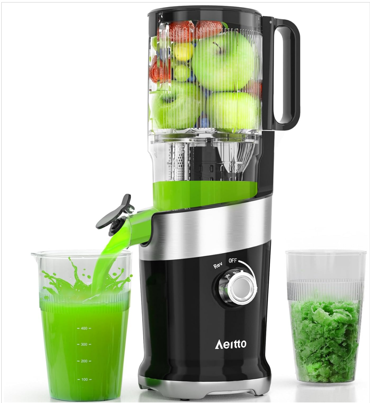
Image: The Aertto Masticating Juicer in operation, showing juice being dispensed into a measuring cup and pulp collected in a separate container.