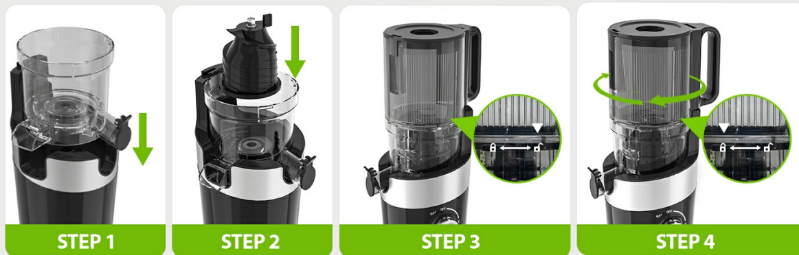
Image: Step-by-step visual instructions for assembling the juicer components.