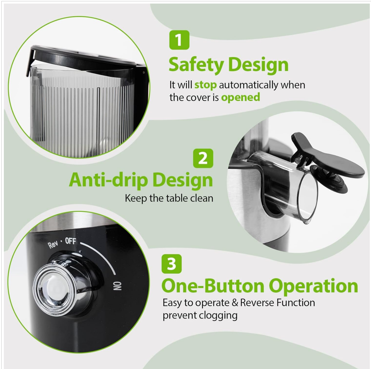
Image: Visual representation of the juicer's safety design, anti-drip feature, and one-button operation.