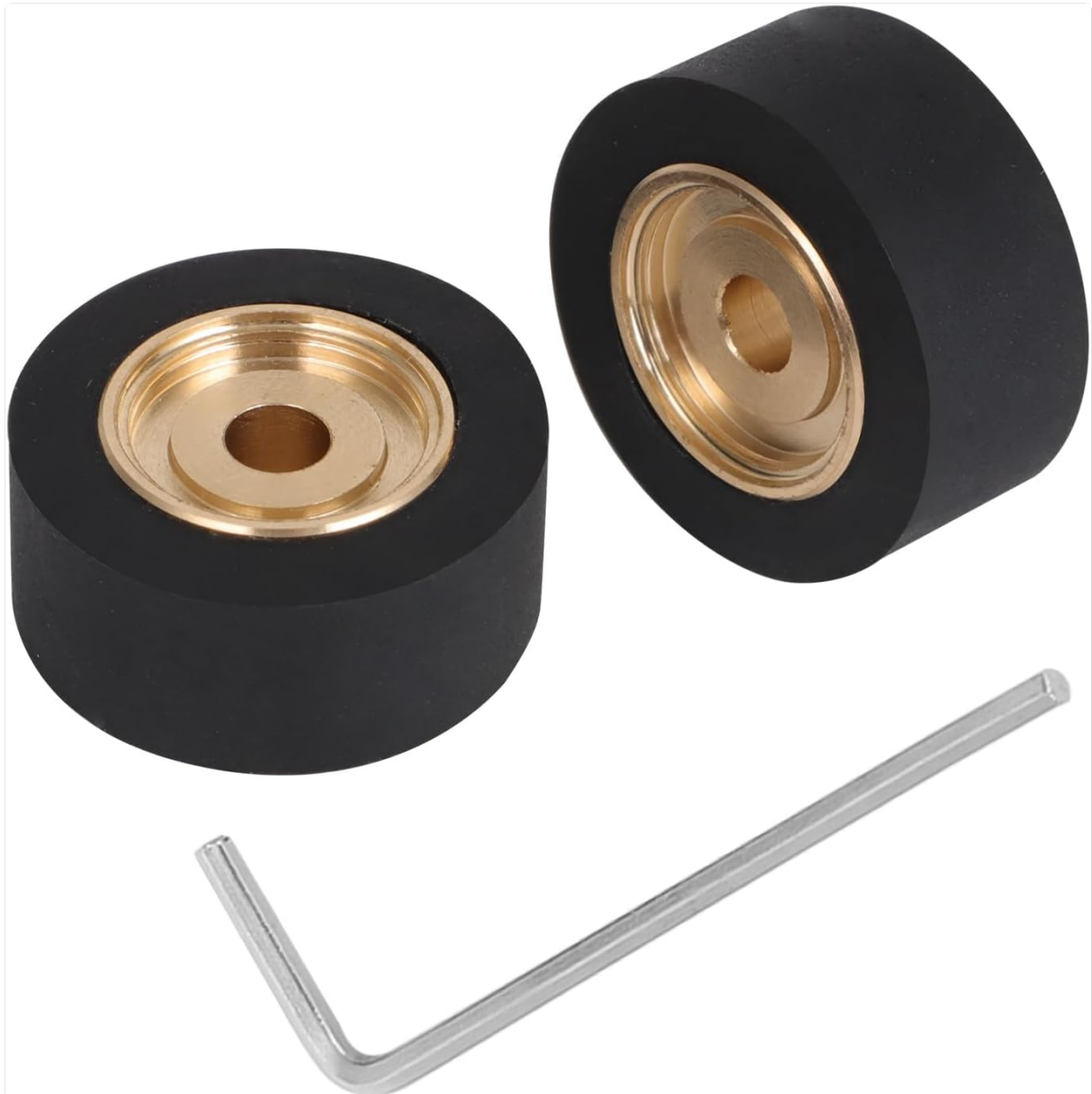
Figure 3.1: MOTOQUEEN Pinch Rollers Assembly with included hex wrench.