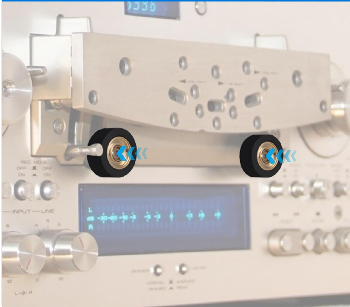
Figure 4.1: Visual representation of the straightforward installation process for the pinch rollers.

It can easily replace old or worn-out pinch rollers.