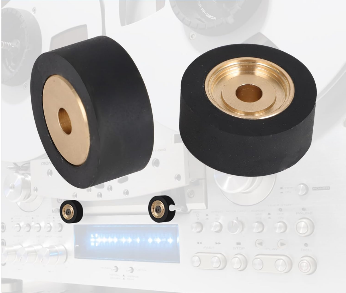
Figure 5.1: The new pinch rollers contribute to improved performance and stability of your tape deck's transport system.

Each tire is ground on a pulley for excellent impact and float.