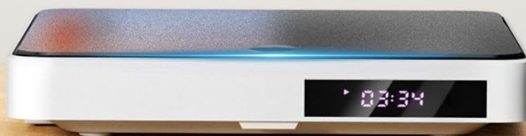
Image: The compact design of the DVD player, highlighting its small footprint for easy installation and storage.