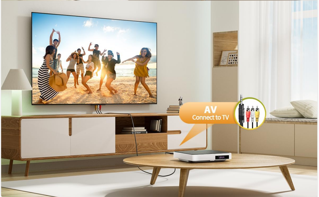
Image: Visual guide demonstrating how to connect the DVD player to a projector using an HDMI cable and to a television using an AV cable.