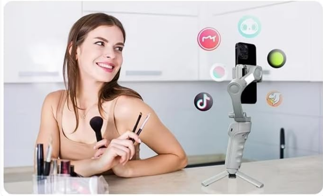
Figure 8: M01 gimbal set up for live streaming with face tracking.

The original camera of the phone, beauty photo software, short videos and live streaming software are all capable of face tracking.