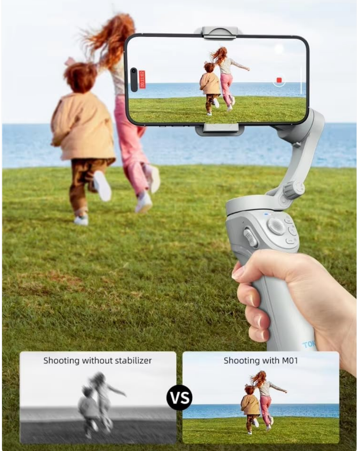
Figure 6: Visual comparison of stability with and without the M01 gimbal.

Walking, running, jumping without shaking the picture.