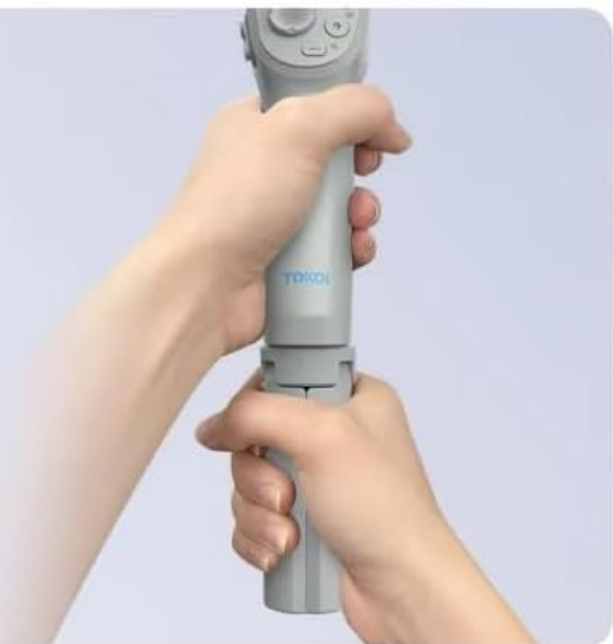
Figure 2: Key features including Three-Axis Stabilization, Powerful Motors, and Two-Handed Grip.