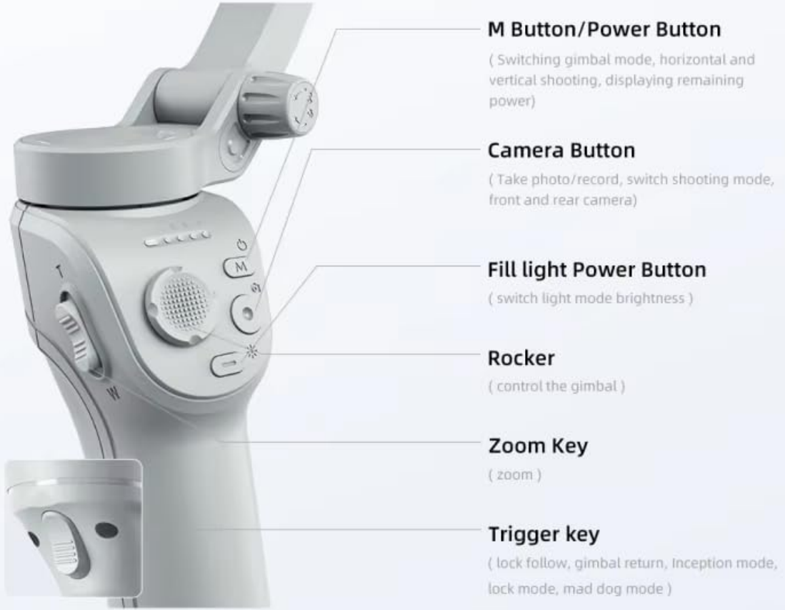
Figure 3: Multi-Functional Keyboard Layout.

Gimbal status at a glance, easy to check power, indicator status and gimbal mode.