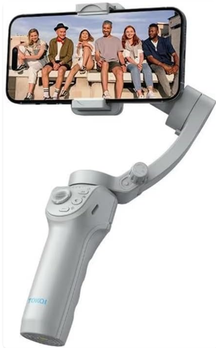
Figure 1: M01 AI Intelligent Gimbal with a smartphone mounted, ready for use.