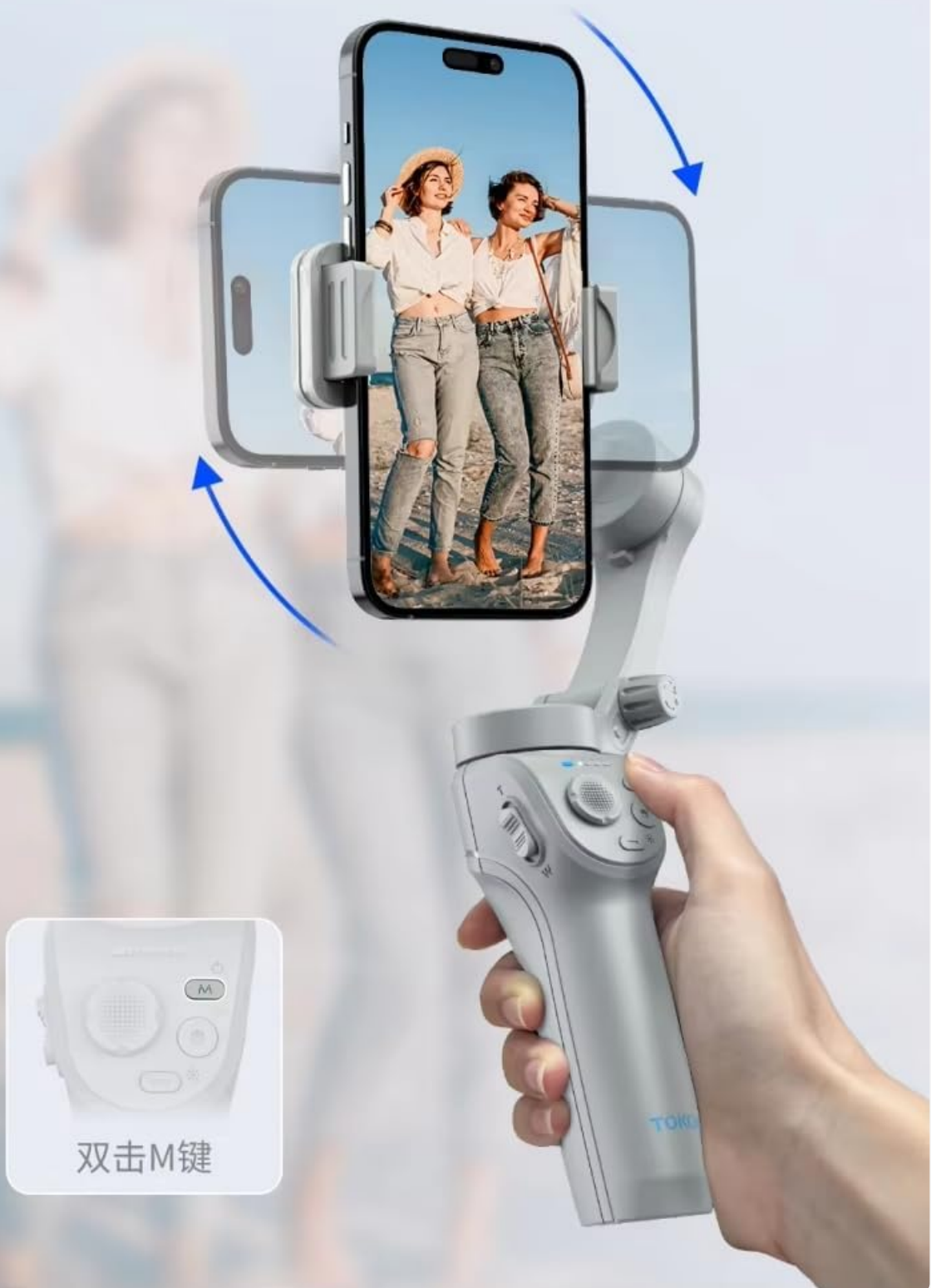
Figure 5: Seamless switching between landscape and portrait modes.

Easy switching with one click will not bump your phone.