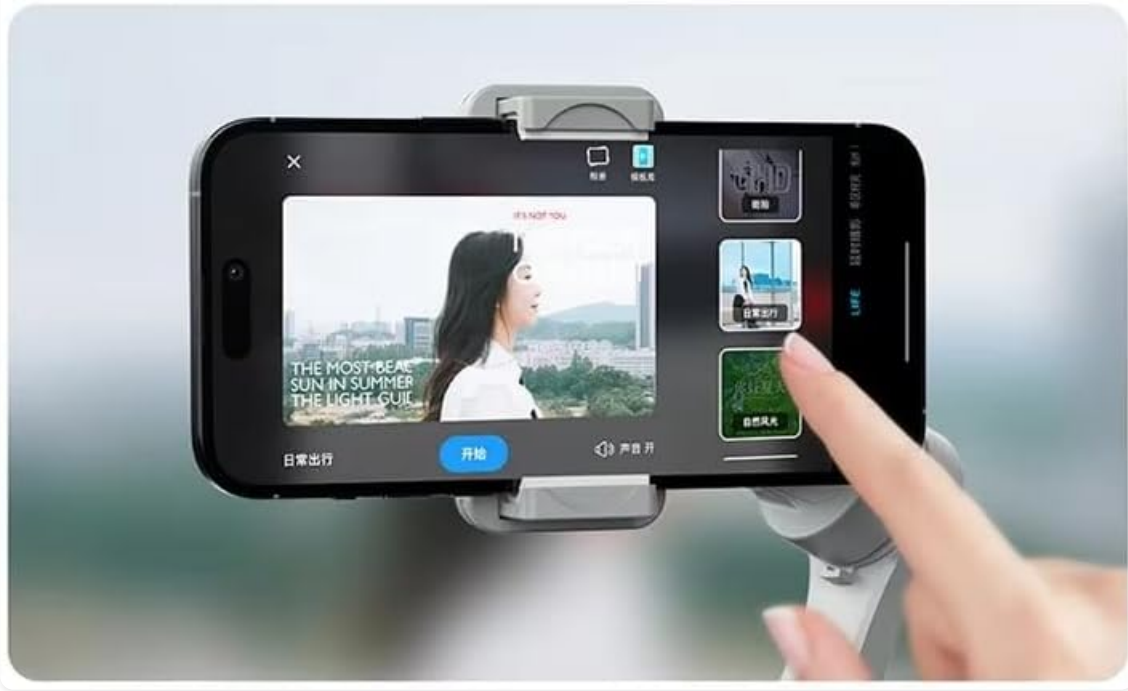
Figure 7: LIFE Mode interface for creative video production.

What to shoot, how to shoot, a wealth of templates for you to choose, more intelligent auxiliary lens, automatically synthesize a wonderful blockbuster. It's a masterpiece!