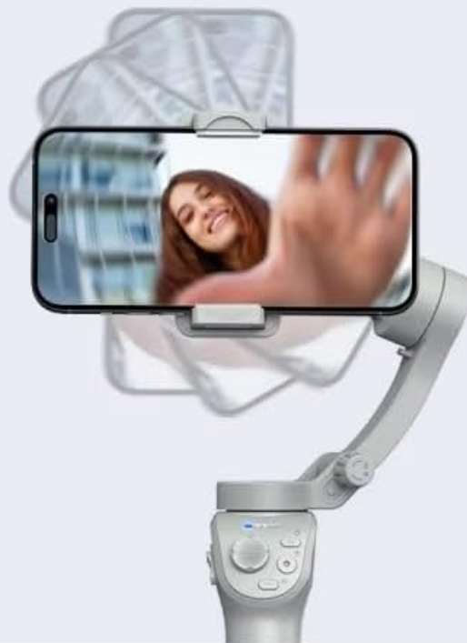
Figure 9: Inception Mode for dynamic, rotating video effects.

Pressing the trigger key three times in a row automatically shoots Inception.