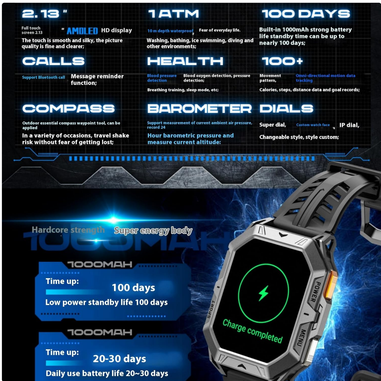
Image: Infographic detailing key features of the X1Pro Smartwatch, including AMOLED display, 1ATM water resistance, 100-day standby, call support, health monitoring, compass, barometer, and customizable dials.