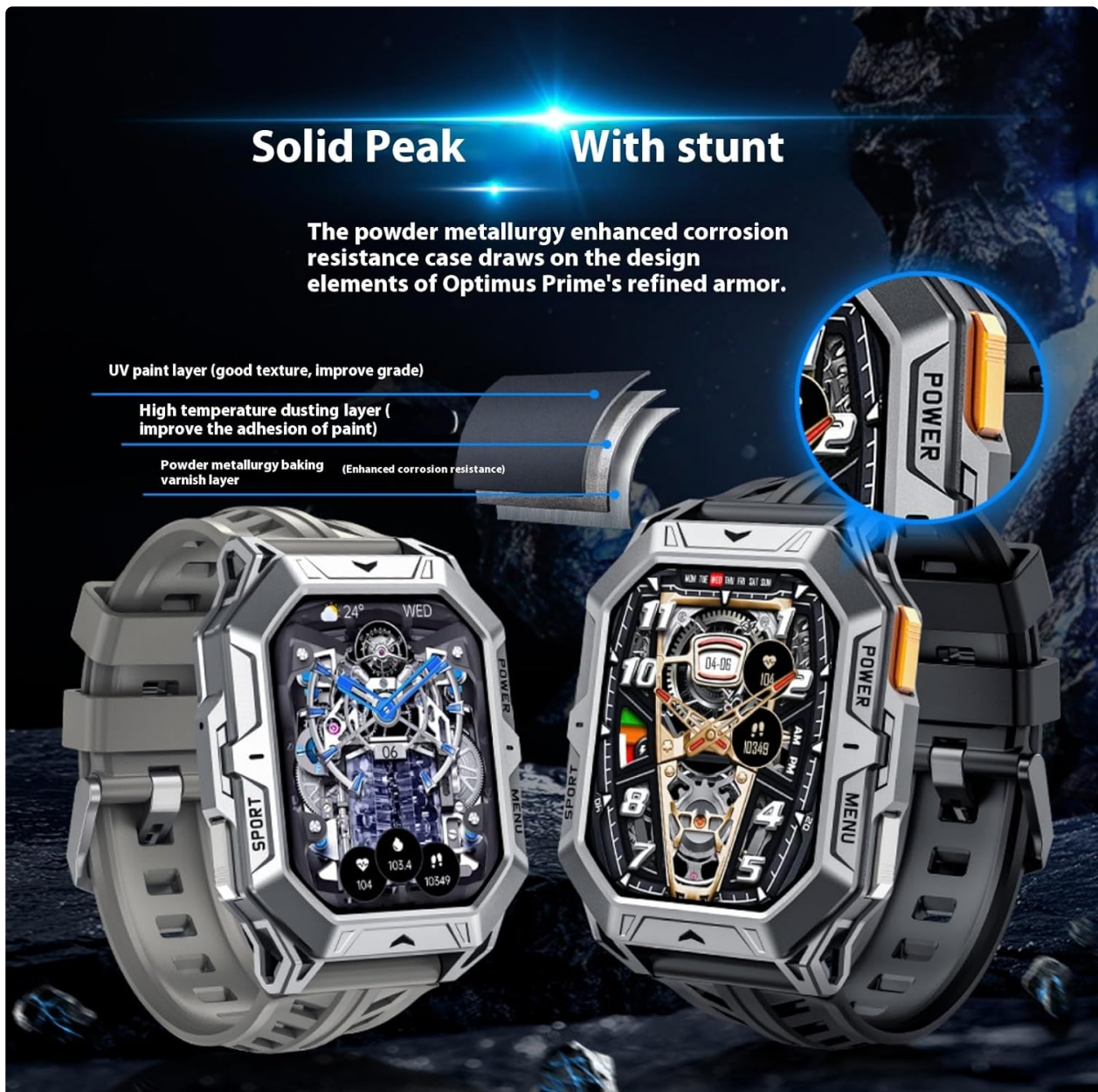
Image: Illustrates the 'Solid Peak' and 'With Stunt' design of the X1Pro Smartwatch, highlighting its enhanced corrosion resistance and durable construction layers.