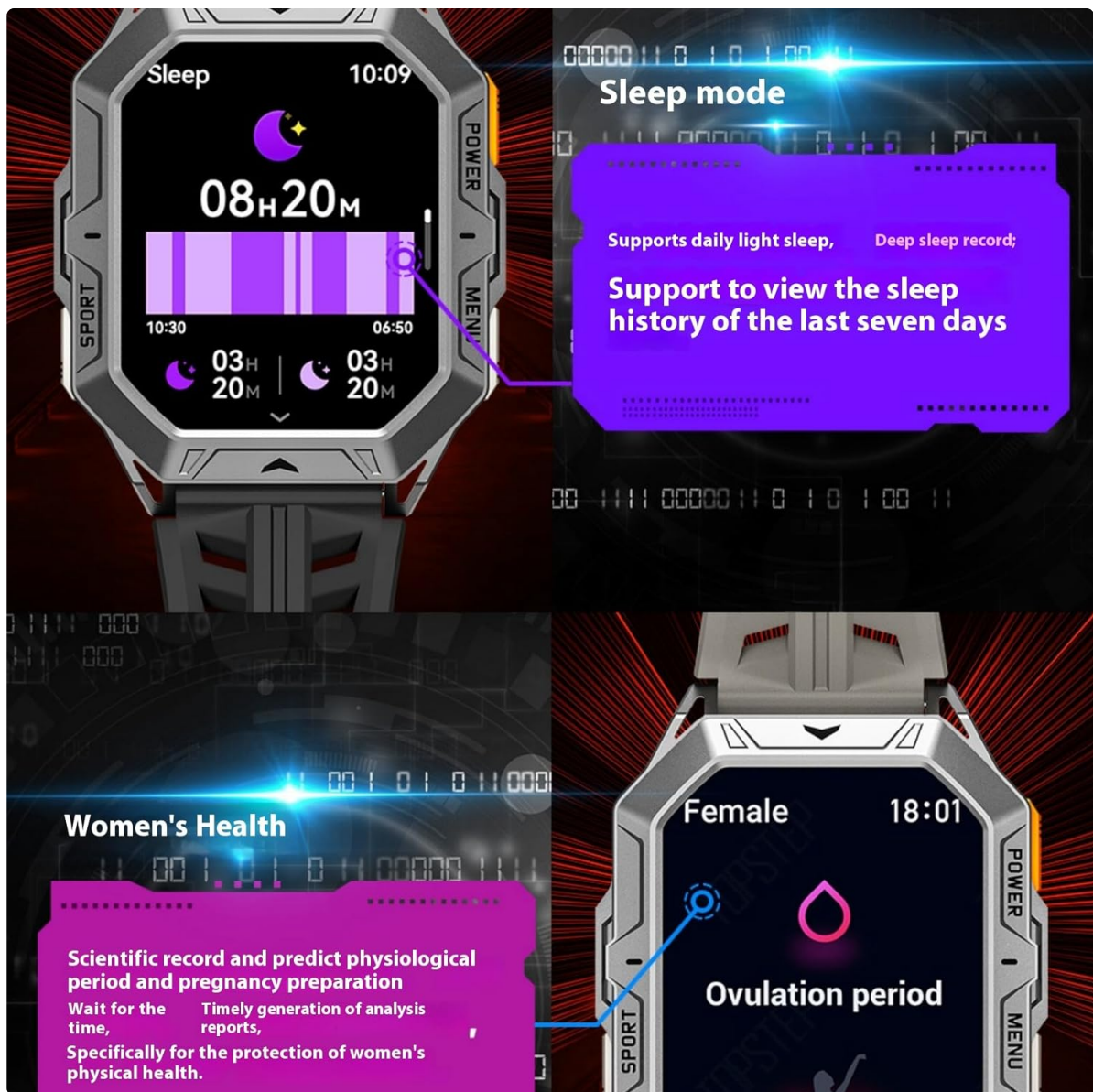
Image: Screenshots from the X1Pro Smartwatch interface showing sleep tracking data and the women's health feature for ovulation period tracking.