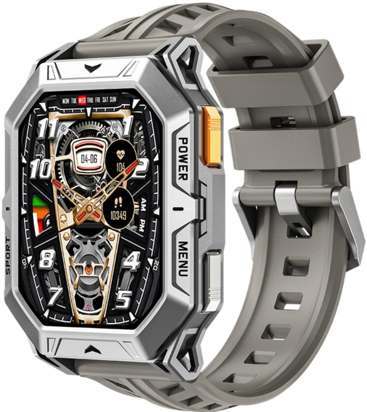
Image: Front view of the X1Pro Three-Defense Smartwatch in gray, showcasing its rugged design and digital watch face.