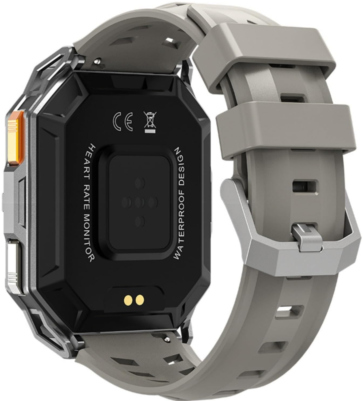
Image: Rear view of the X1Pro Smartwatch, highlighting the heart rate monitor and magnetic charging contacts.

Before first use, fully charge your X1Pro Smartwatch. Connect the provided charging cable to the magnetic charging contacts on the back of the watch and to a standard USB power adapter (not included). The screen will indicate charging status. A full charge typically takes approximately 2 hours.