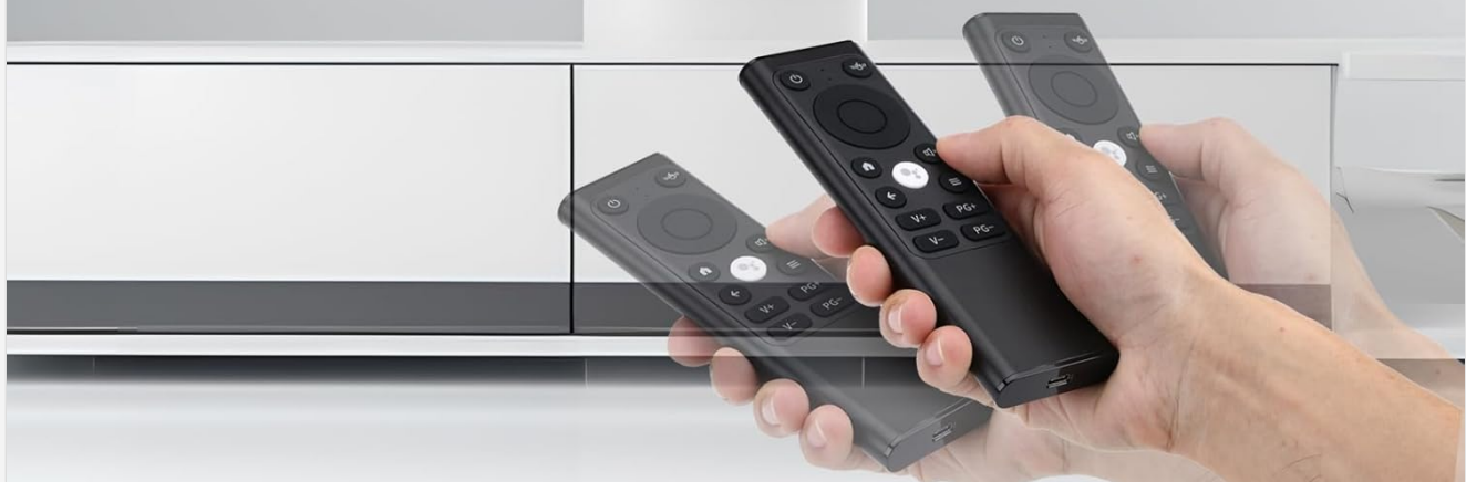
Image: A user demonstrating the air mouse functionality by moving the remote, which controls the cursor on a connected display. Instructions for adjusting cursor speed (OK+Volume+ for speed up, OK+Volume- for slow down) are also shown.