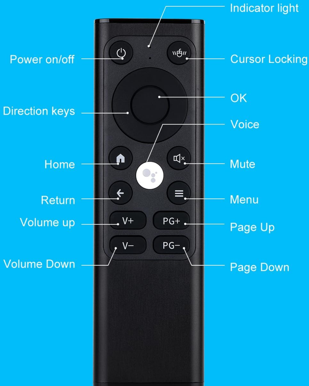
Image: A clear diagram outlining the functions of each button on the remote control side, including Power On/Off, Cursor Locking, Indicator Light, Direction Keys, OK, Voice, Home, Mute, Return, Menu, Volume Up/Down, and Page Up/Down.