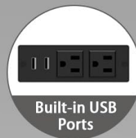
Built-in USB Ports