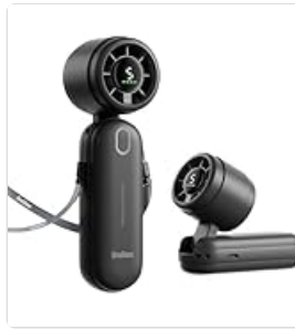
Figure 7.1: Key specifications of the Diveblues TurboBear Portable Handheld Turbo Fan.