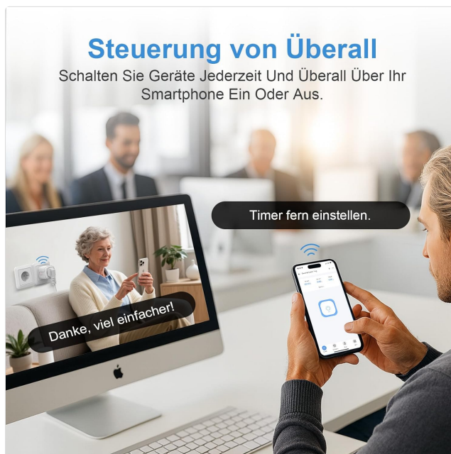
Figure 6.1: Remote control of appliances using the eWeLink app on a smartphone.