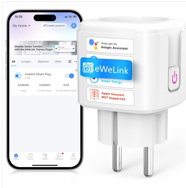
Figure 5.1: The SURFOU Smart Plug BSD33-E shown with the eWeLink application interface, highlighting compatibility with Google Assistant and eWeLink.