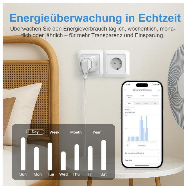
Figure 6.3: Real-time energy monitoring and historical data display in the eWeLink app.