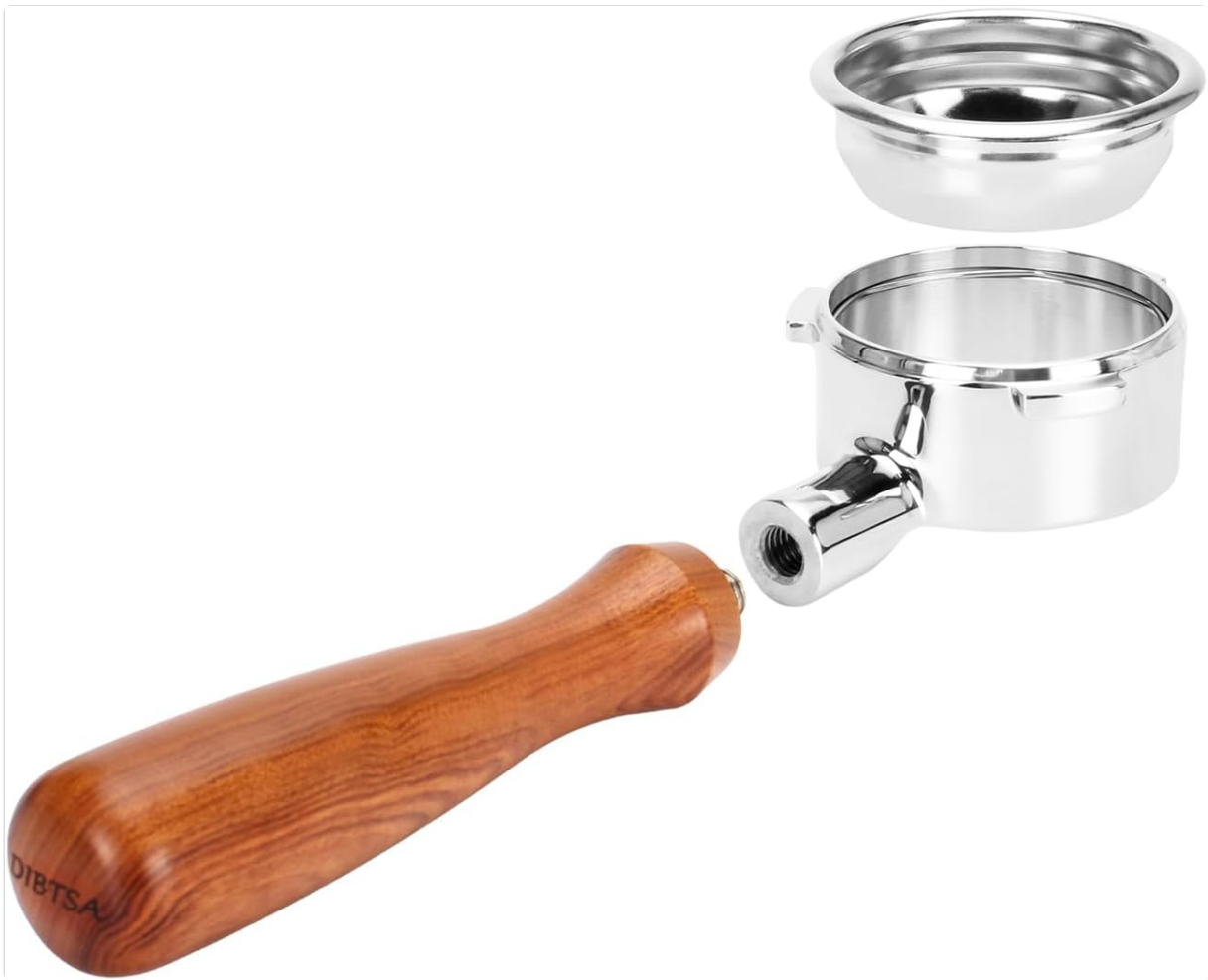
Figure 2: Disassembled view of the portafilter components.