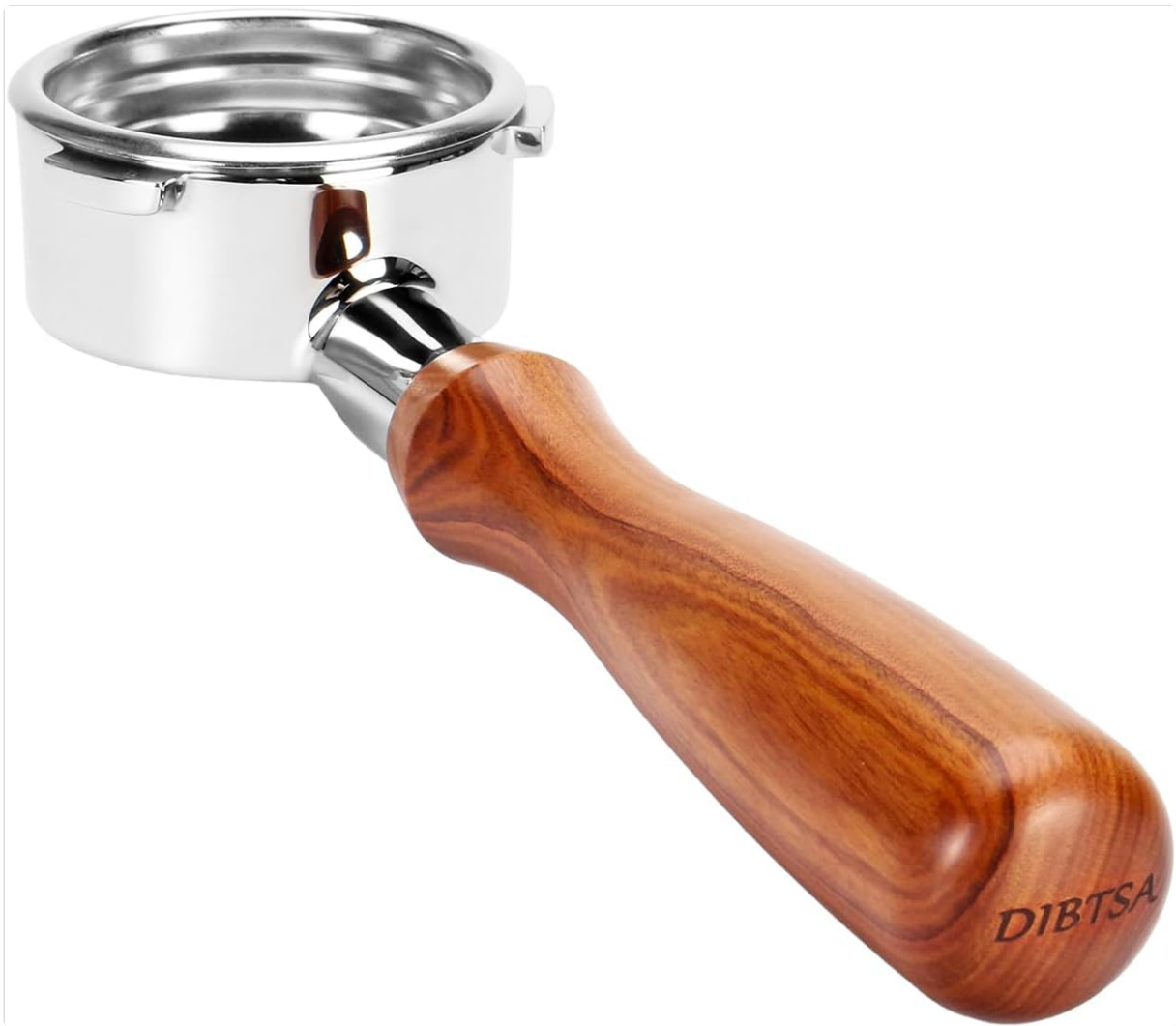
Figure 1: DIBTSA 58mm Bottomless Portafilter with wooden handle.