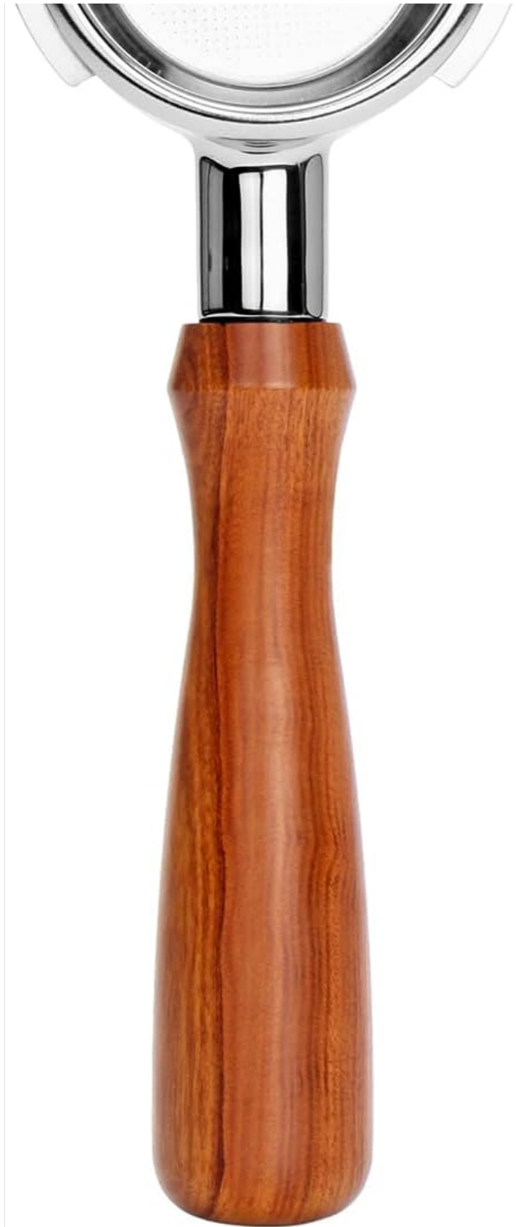
Figure 5: The bottomless design allows for clear observation of extraction.