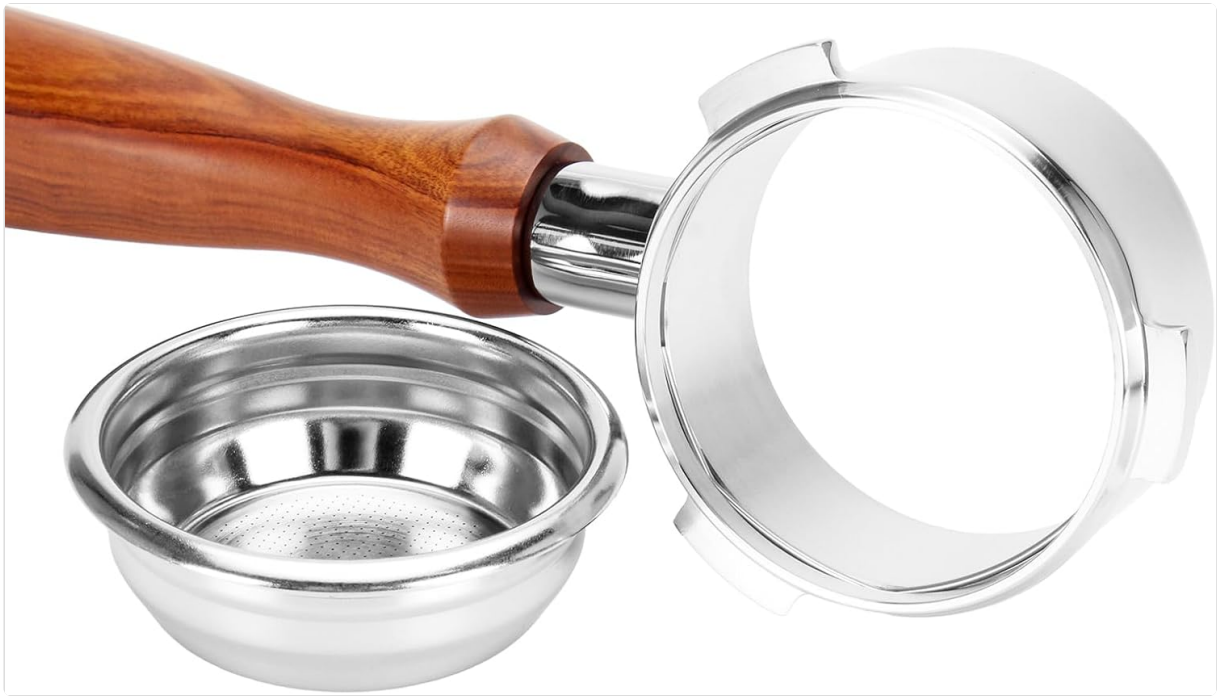
Figure 4: Portafilter head with filter basket removed, showing easy assembly.