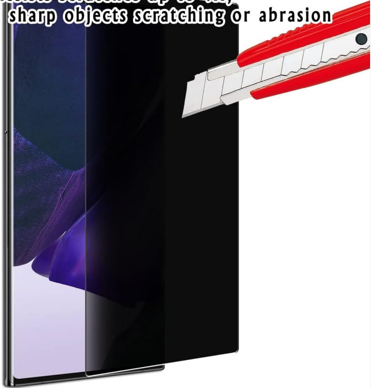
Image: A screen protector resisting scratches from a utility knife, illustrating its 4H hardness rating.

4H: Resists scratches up to 4H, avoid sharp objects scratching or abrasion