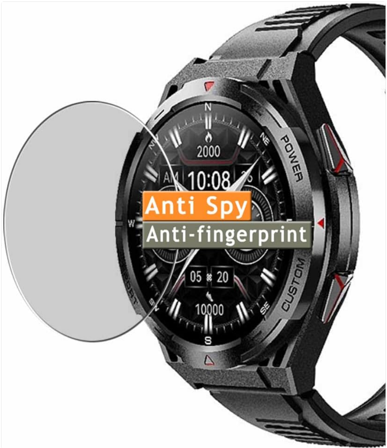
Image: The Vaxson Privacy Screen Protector applied to a smartwatch, highlighting its anti-spy and anti-fingerprint features.