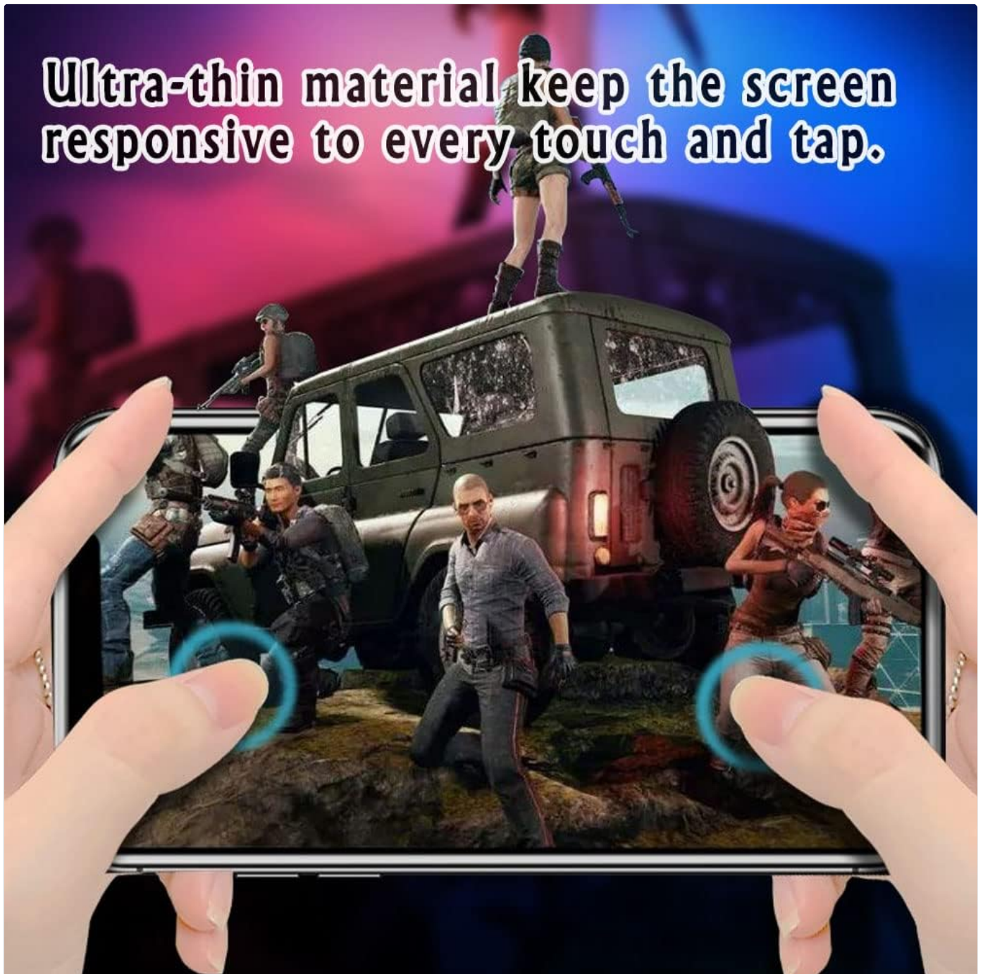
Image: A smartphone screen demonstrating high touch responsiveness, indicating the screen protector does not hinder interaction.

Ultra-thin material keep the screen responsive to every touch and tap.