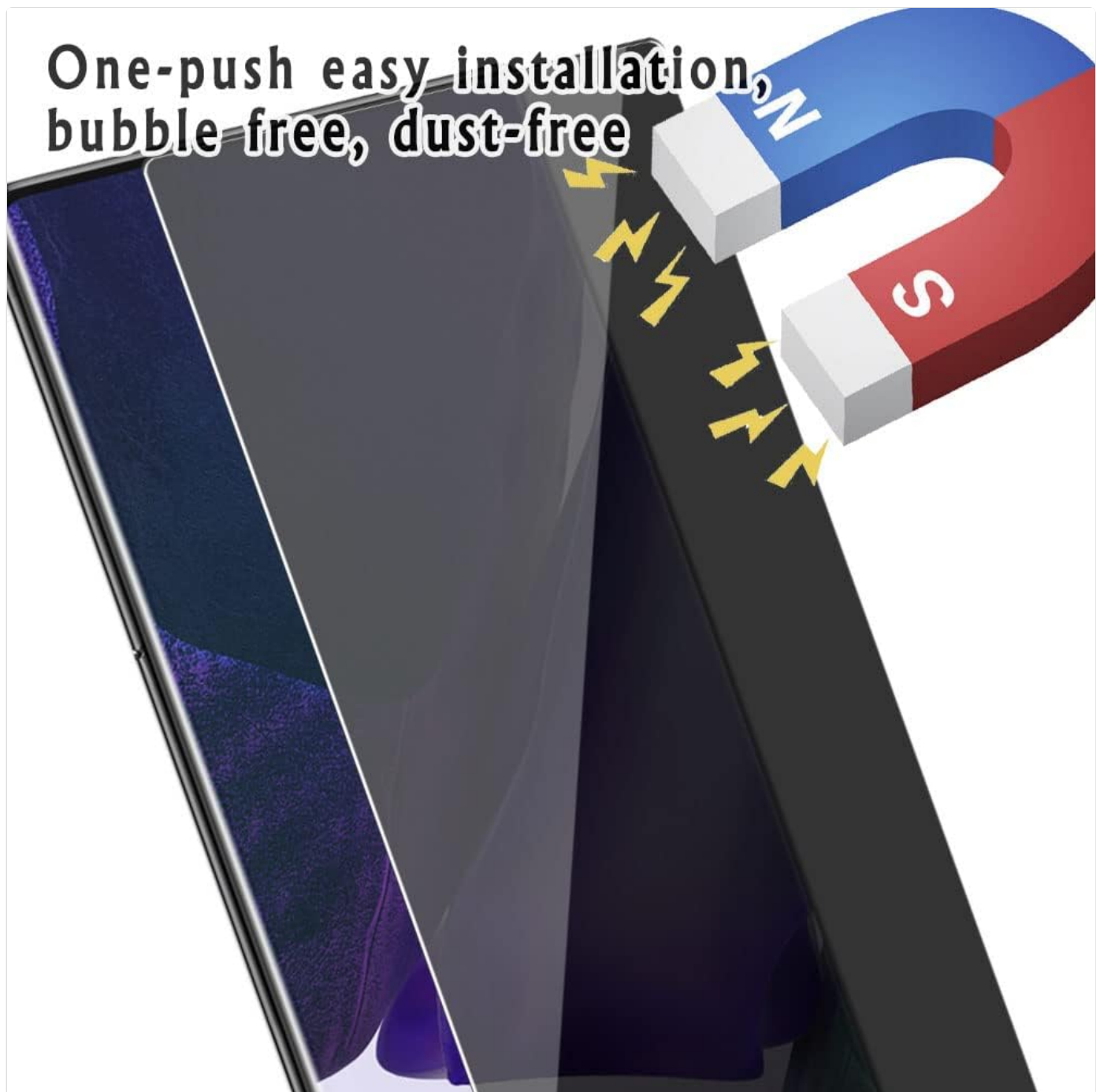
Image: Visual representation of the easy, bubble-free, and dust-free installation process, suggesting magnetic alignment.