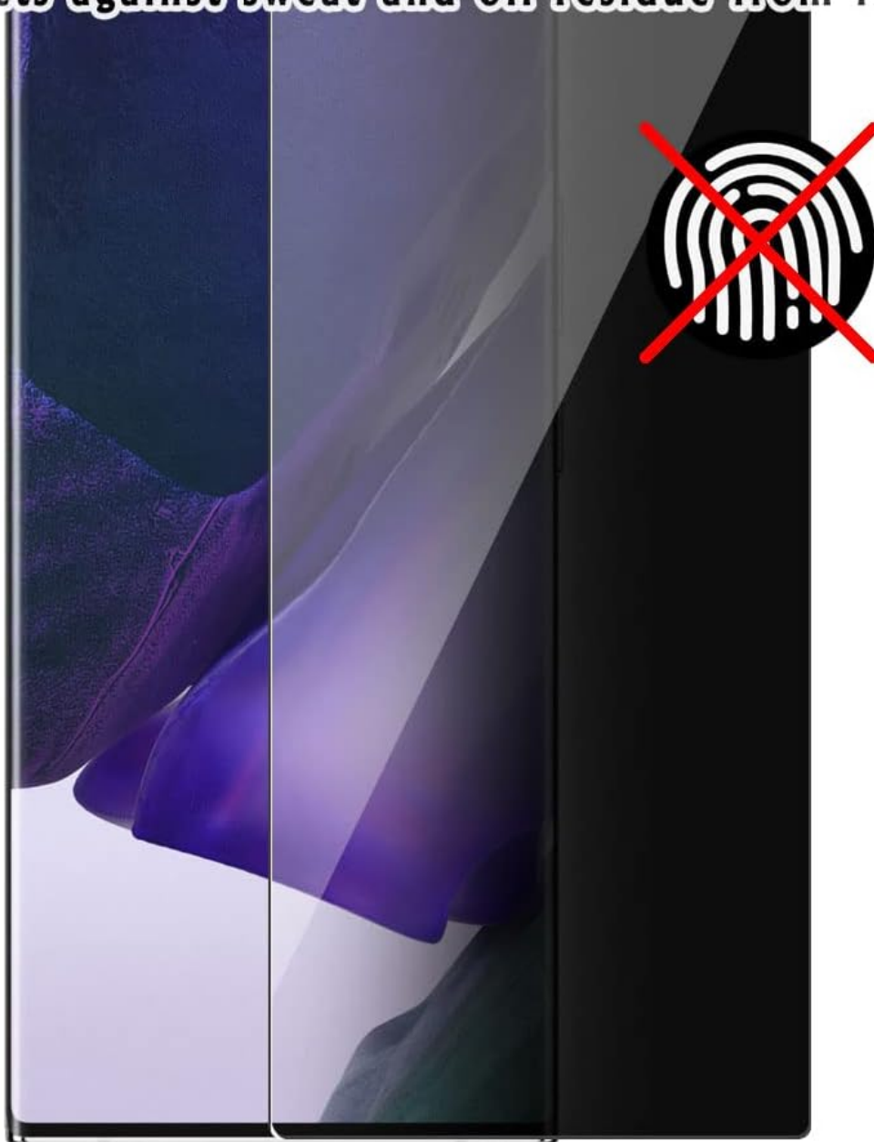
Image: A screen protector with a hydrophobic and oleophobic coating, showing how it repels sweat and oil residue to prevent fingerprints.