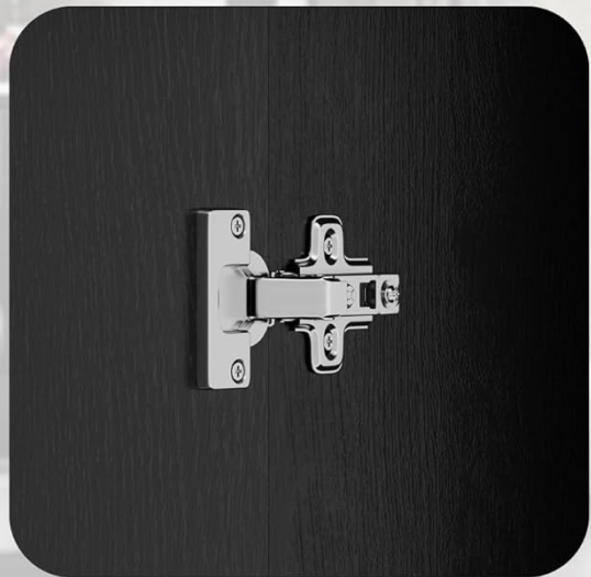
Sturdy Metal Hinges

Image: Detailed views highlighting the quality components of the cabinet, including the golden handles, fluted panel texture, and metal hinges.