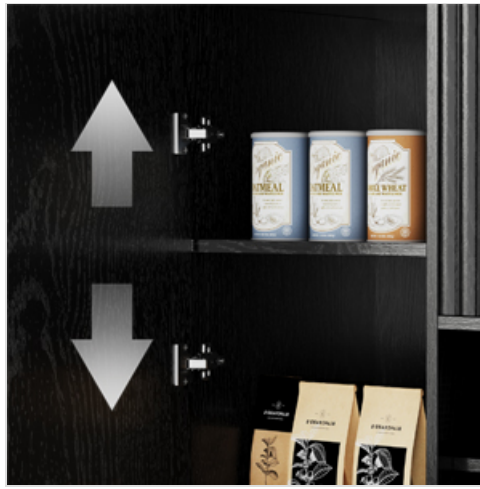
Image: Adjustable shelves feature, allowing customization of storage space during assembly and use.