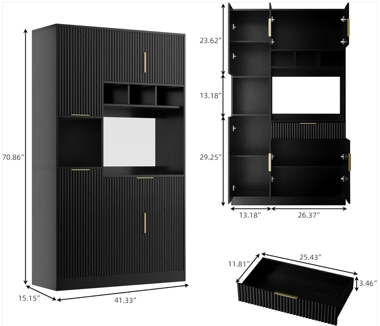
Image: Dimensional diagram of the cabinet, providing precise measurements for planning placement.