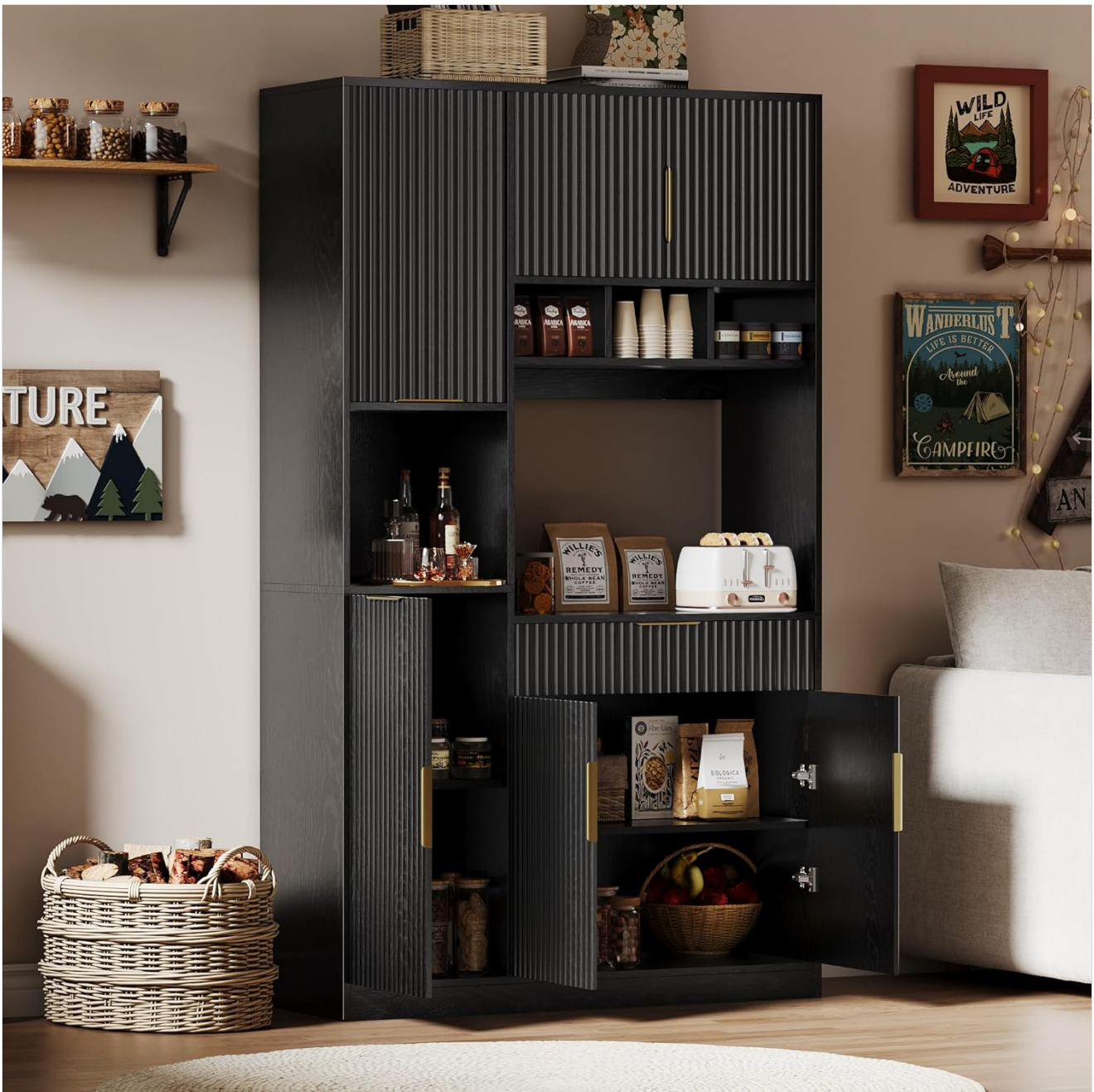
Image: Front view of the TOKSOM 71-inch Kitchen Pantry Storage Cabinet, demonstrating its capacity and design in a kitchen setting.