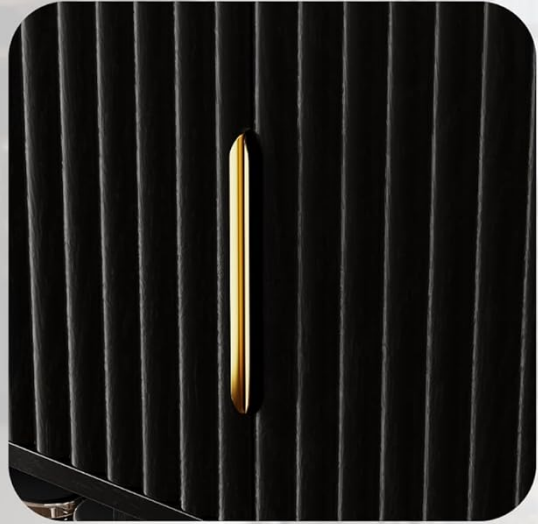
Exquisite Golden Handles