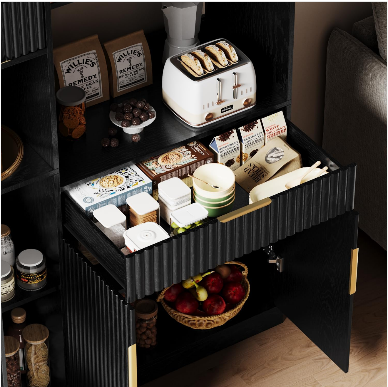
Image: The deep drawer in use, demonstrating its capacity for organizing kitchen items.