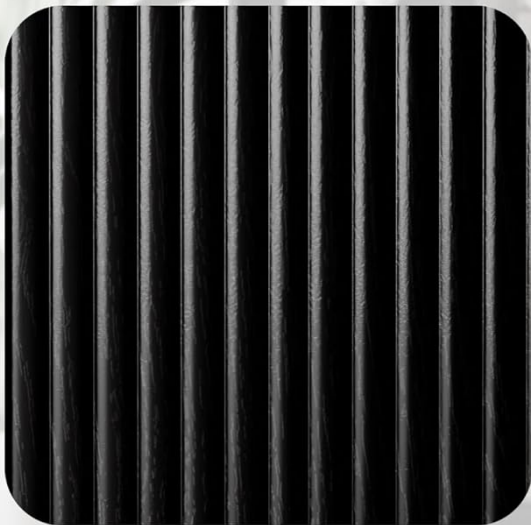
Fluted Panel Design