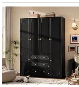
Image: Visual representation of the cabinet's multifunctional and ample storage space for various items.