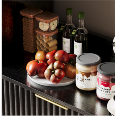
Image: Detail of the cabinet's countertop, emphasizing its durable and easy-to-clean surface.