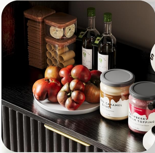
Durable Wooden Countertop