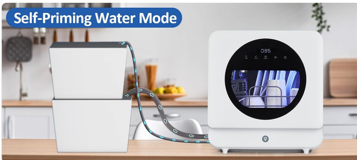
Image: Illustration of the two water inlet modes: Faucet Mode connected to a kitchen faucet and Self-Priming Water Mode using an external water tank.

Your browser does not support the video tag.