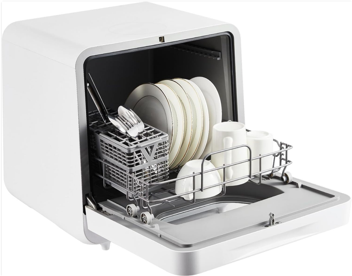
Image: The interior of the portable dishwasher showing a loaded rack with plates, cups, and cutlery, demonstrating its capacity.