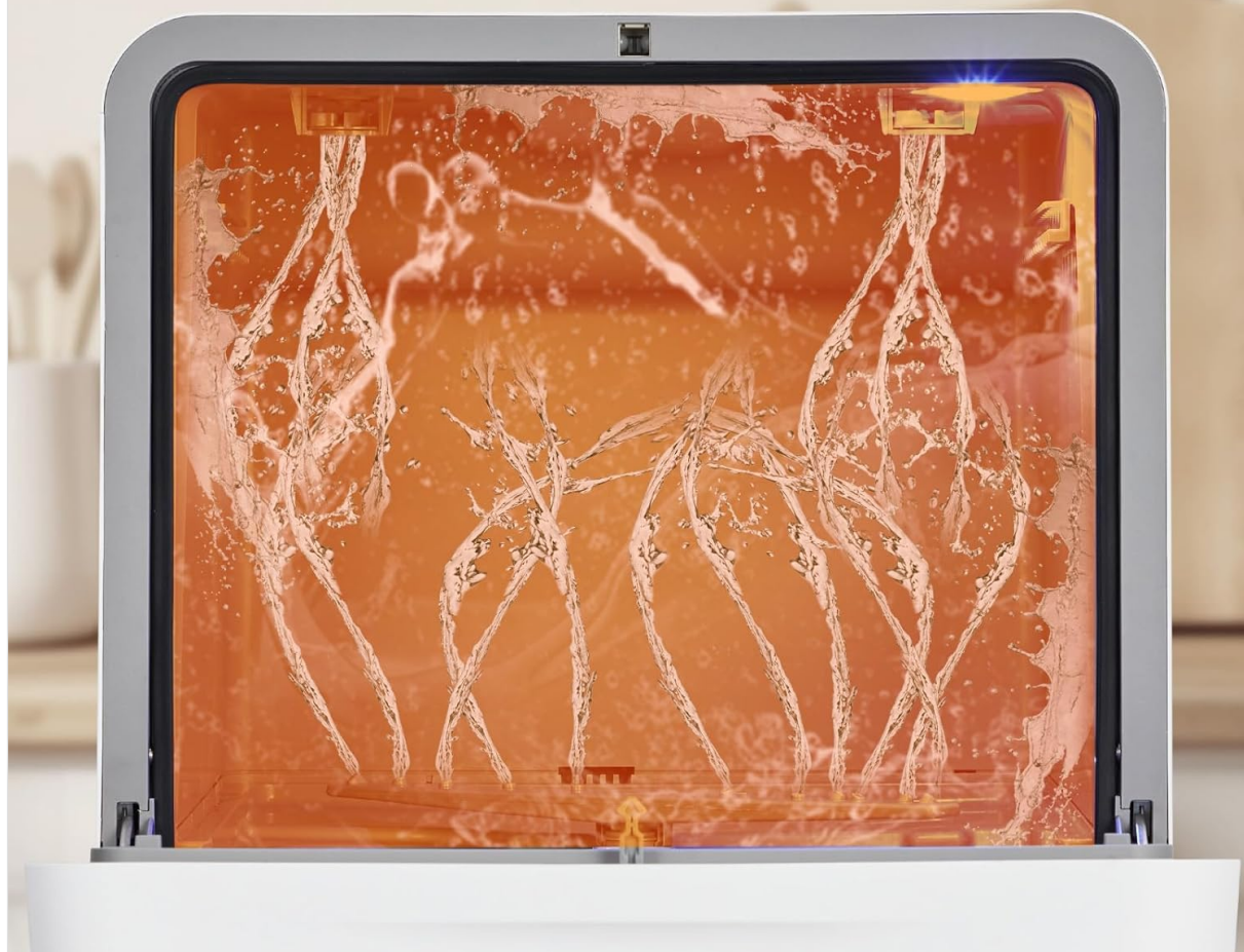
Image: An internal view of the dishwasher showing water jets and indicating 162°F high-temperature hygiene care, 720° full coverage, and 3 spray arms for thorough cleaning.