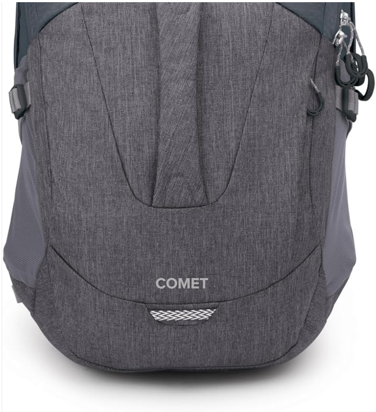
Image: Dedicated laptop compartment of the Osprey Comet Backpack, designed to securely hold a 16-inch laptop.