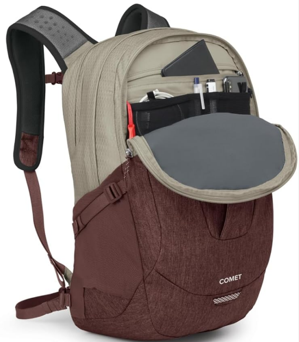
Image: Front organization pocket of the Osprey Comet Backpack, showing internal dividers and a key clip.

Designed with comfortable, capable suspension and a commitment to technical fit, features and fabrics.