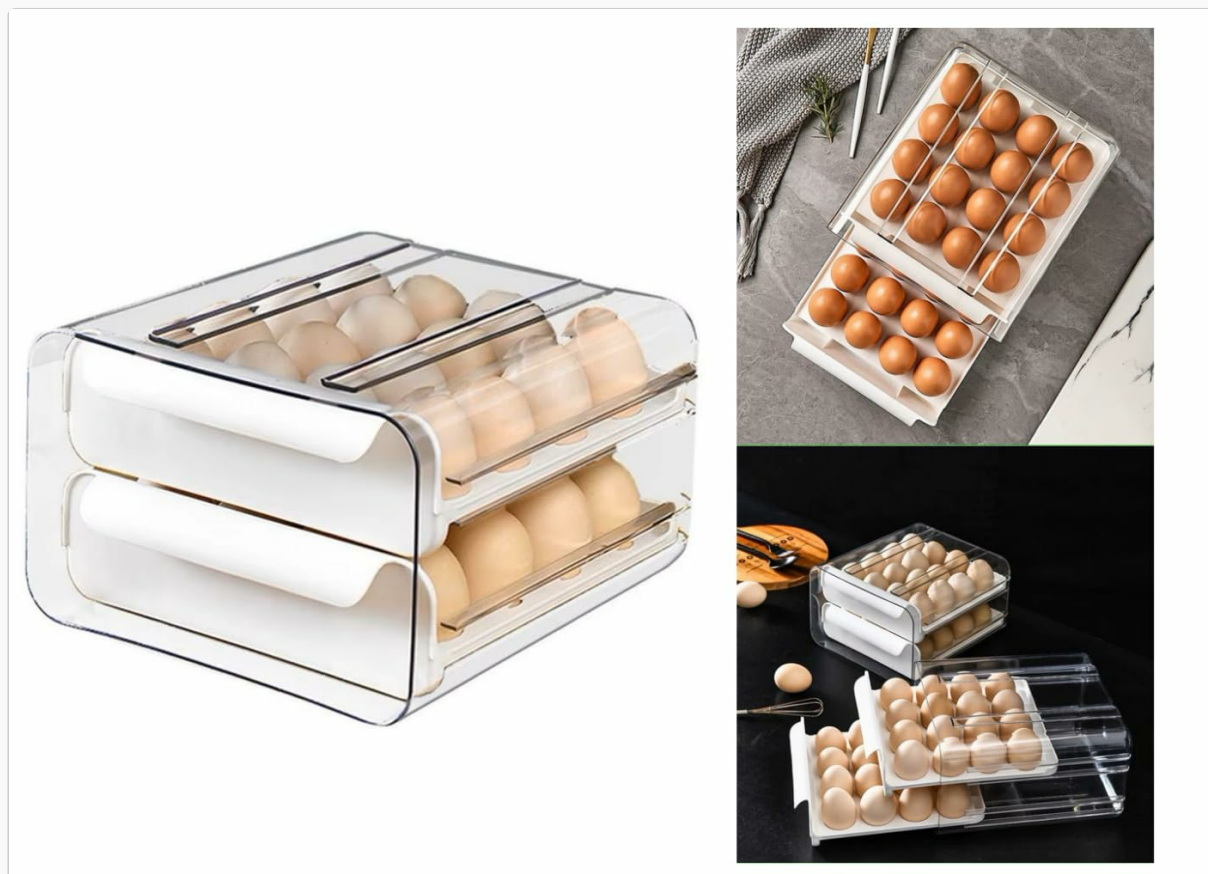
Image 1.1: The Double Plastic Egg Drawer, Model O320, shown with eggs stored inside.

The Generic Double Plastic Egg Drawer (Model O320) is designed to efficiently organize and store up to 32 eggs within your refrigerator or kitchen space. Its compact, double-layer design helps optimize storage, keeping eggs secure and easily accessible. Constructed from durable plastic, this organizer is built for longevity and ease of cleaning.