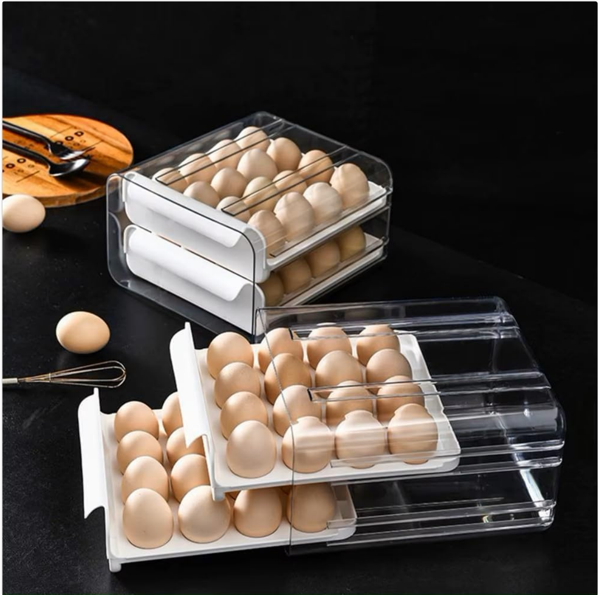
Image 2.1: Two egg drawers, one demonstrating the drawer mechanism.