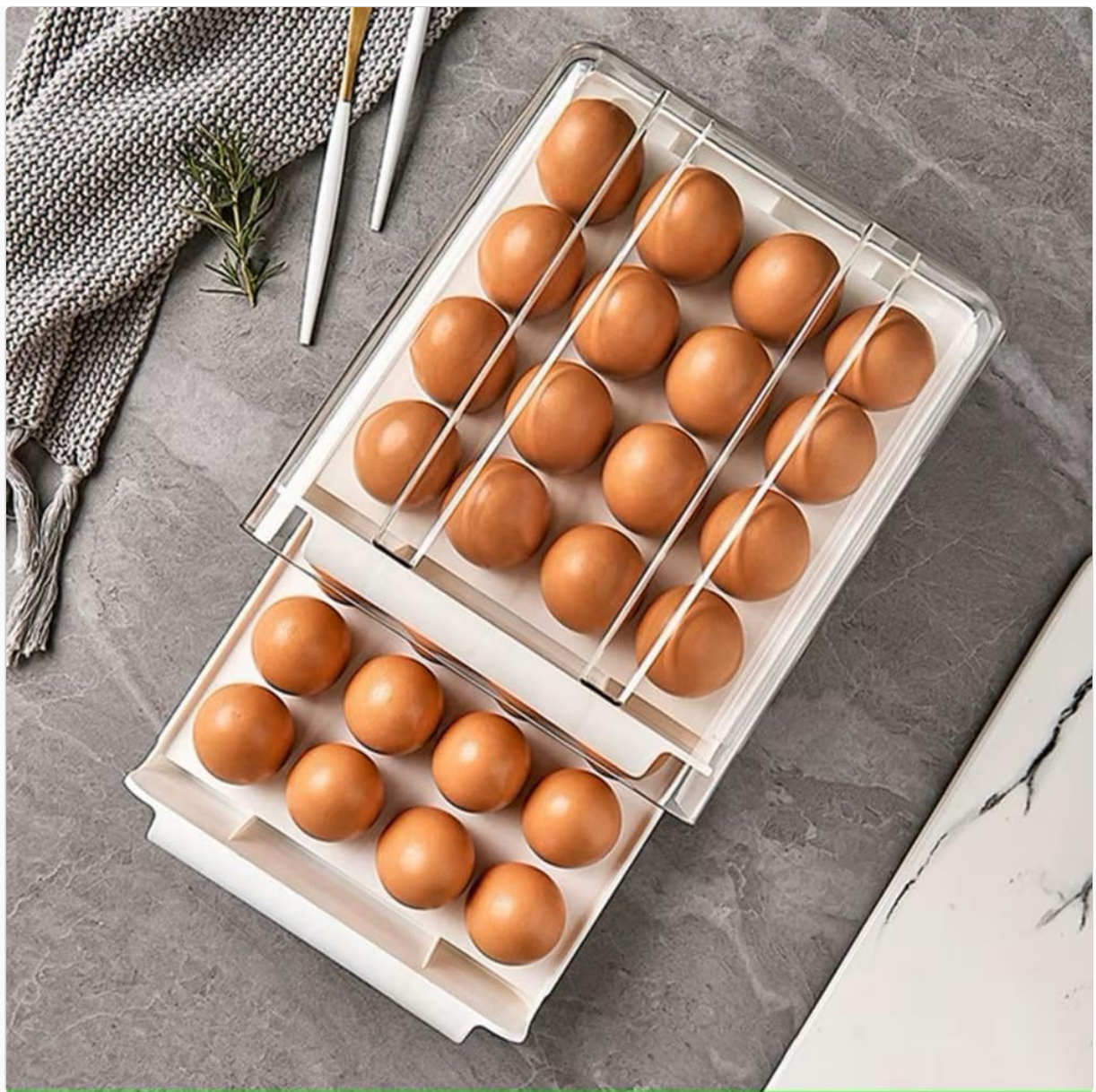
Image 3.1: Top-down view showing a drawer pulled out for loading or retrieving eggs.