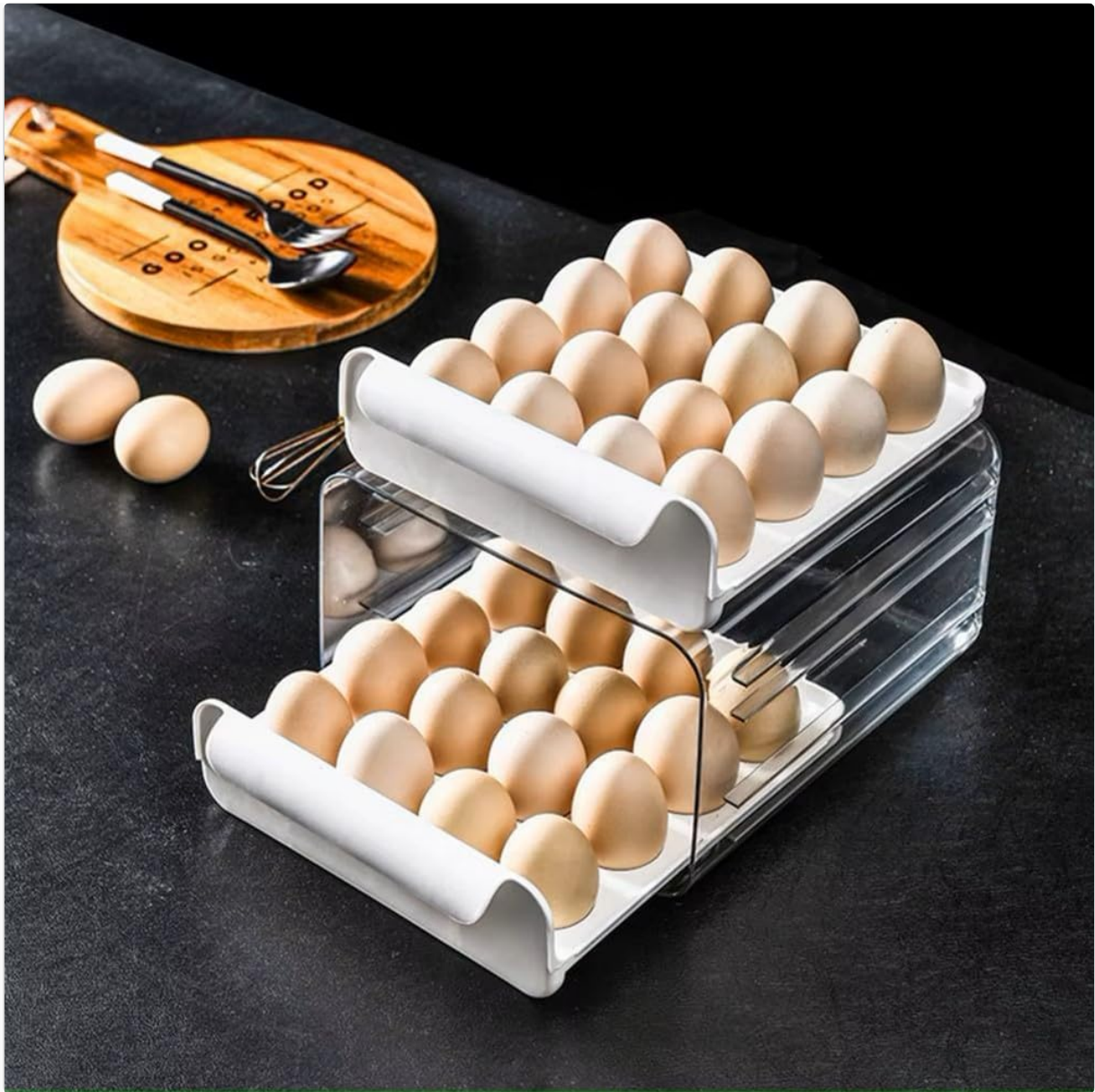
Image 3.2: Both drawers extended, demonstrating full access to all 32 egg slots.