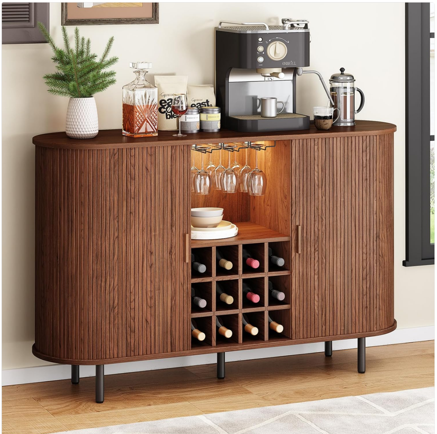
Image: The ONBRILL 55" Wine Bar Cabinet in walnut finish, showcasing its design with a coffee machine and decorative items on top, and wine glasses hanging inside the illuminated central compartment.