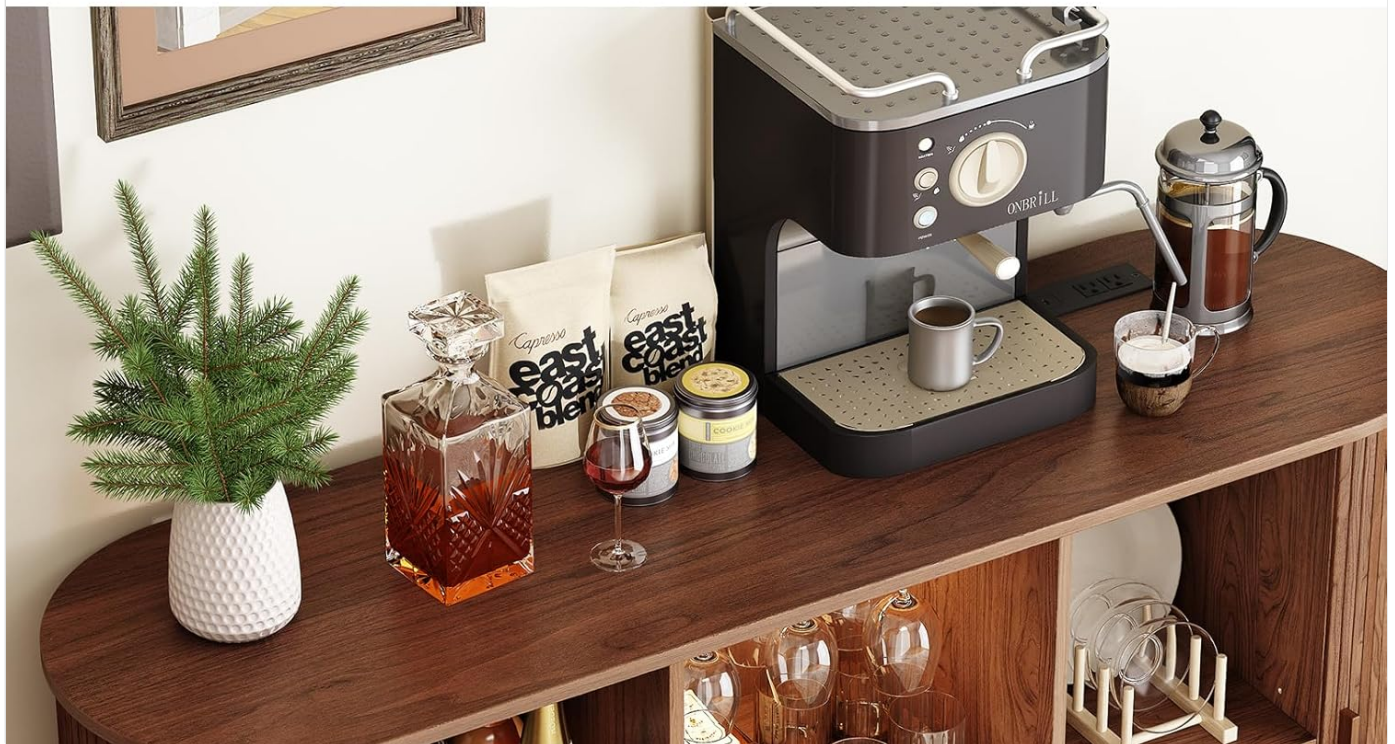
Image: This image highlights the multi-function charging station on the cabinet's top surface, featuring AC outlets and USB ports, alongside a demonstration of the customizable RGB LED lighting within the central compartment.