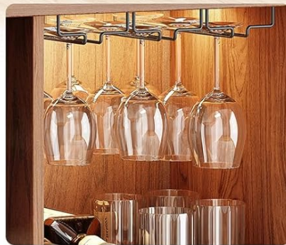
Wine Glass Holder Hanging 9 Glasses