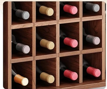
Wine Rack Hold 12 Wine Bottles

Image: A detailed view of the cabinet's interior, illustrating the adjustable shelf mechanism, the integrated wine glass holder, and the structured wine bottle rack, all designed for optimal organization.