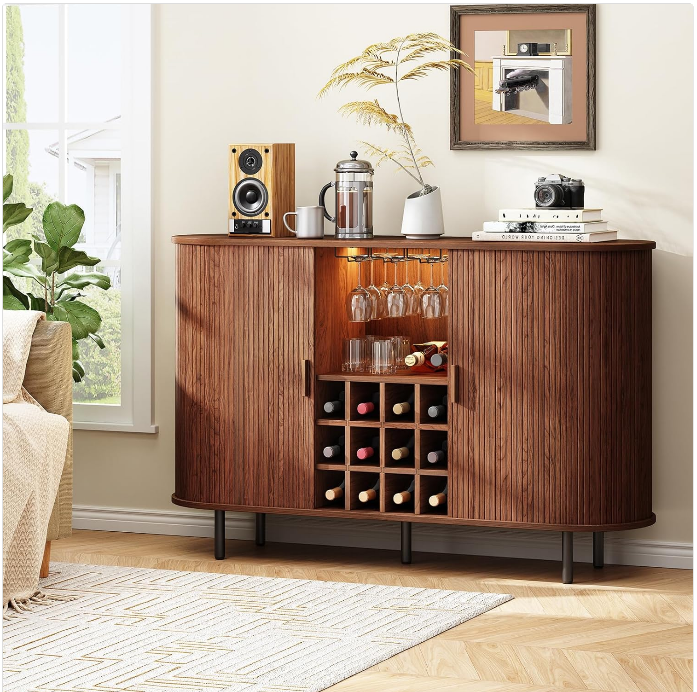
Image: The fully assembled ONBRILL Wine Bar Cabinet, demonstrating its integration into a modern living space, highlighting its functional and aesthetic appeal.