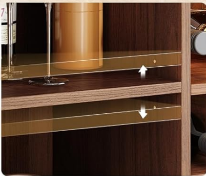
Adjustable Shelf 3 adjustable heights