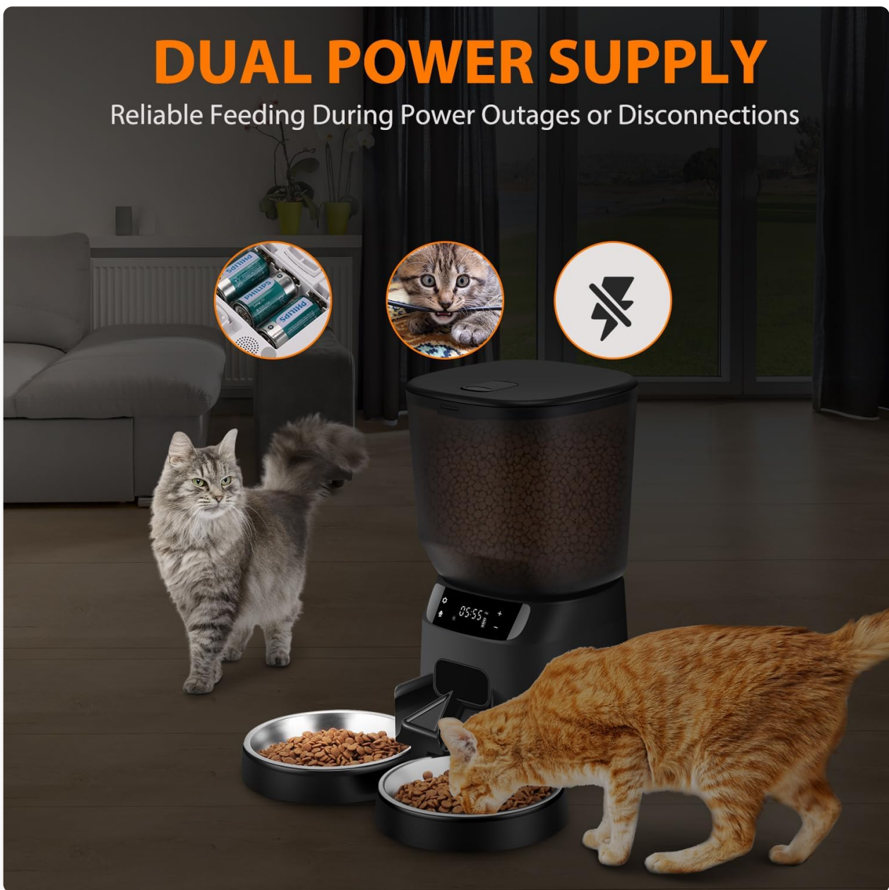
Image 3.1: The feeder can be powered by a wall adapter or D-size batteries for backup.