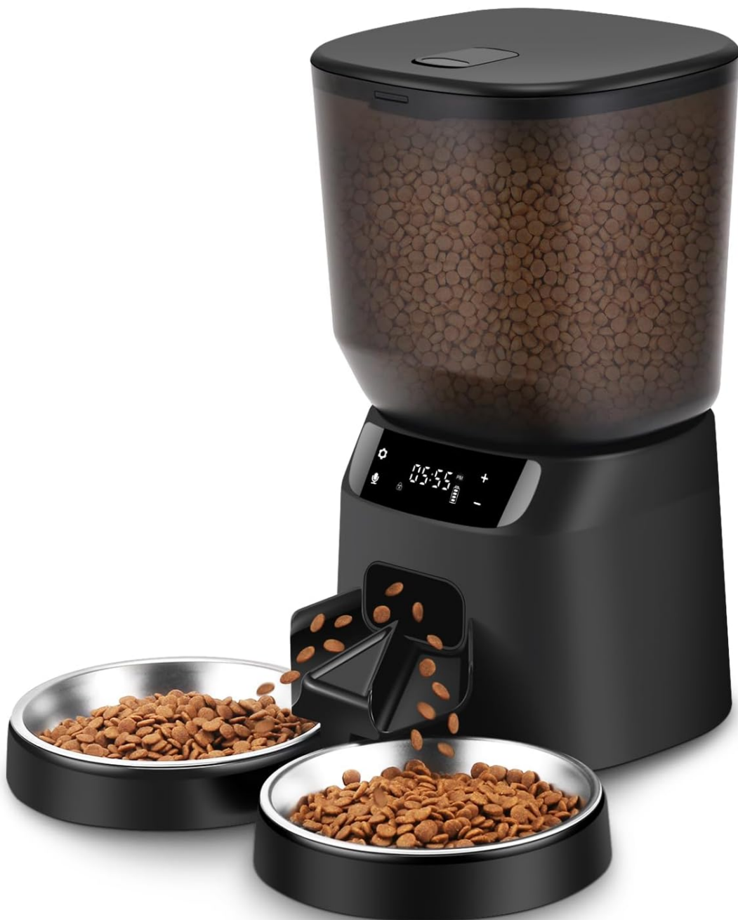
Image 1.1: The Katalic Automatic Cat Feeder, showcasing its design and dual feeding capability.