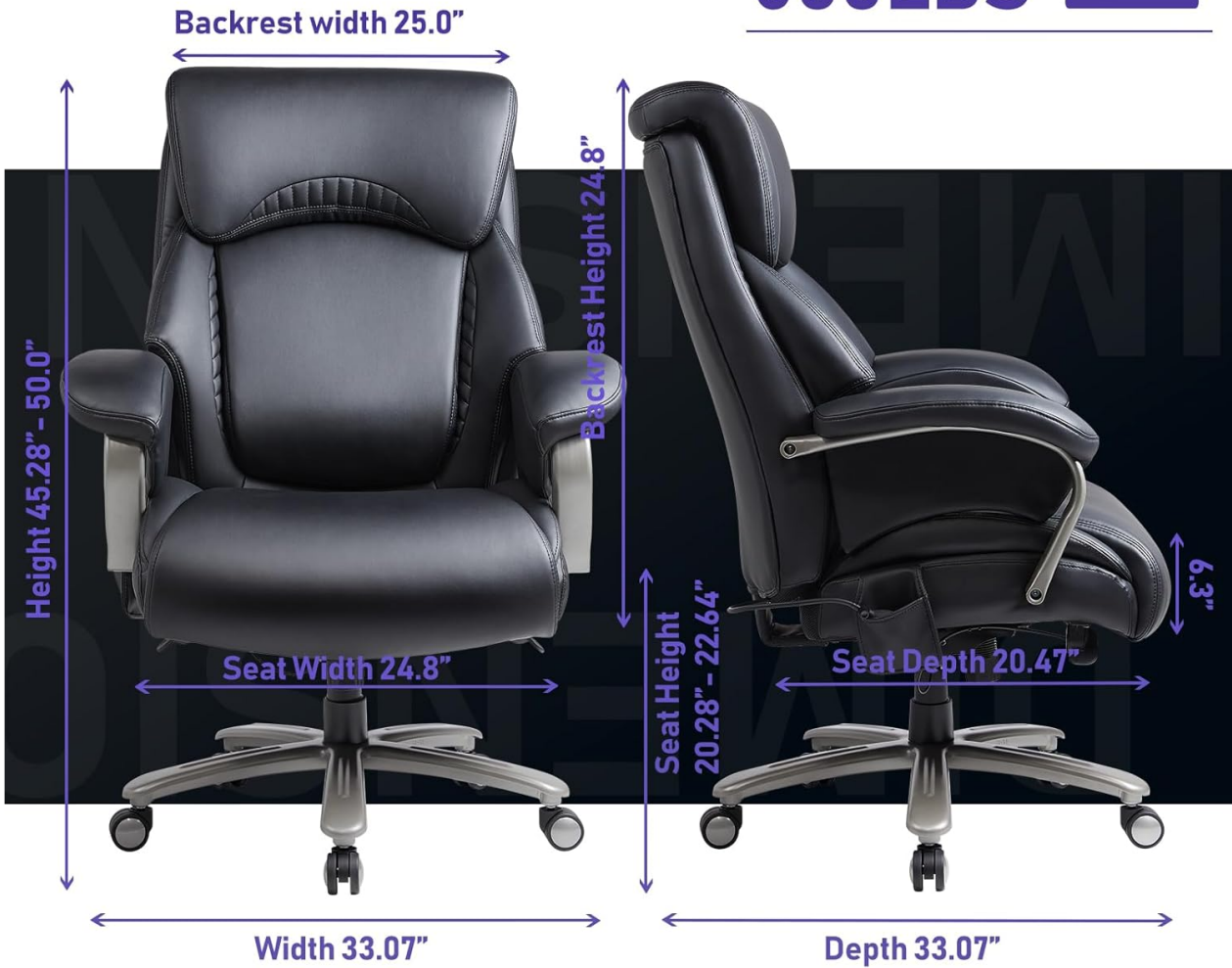
Image: Detailed product dimensions and weight capacity of the office chair.