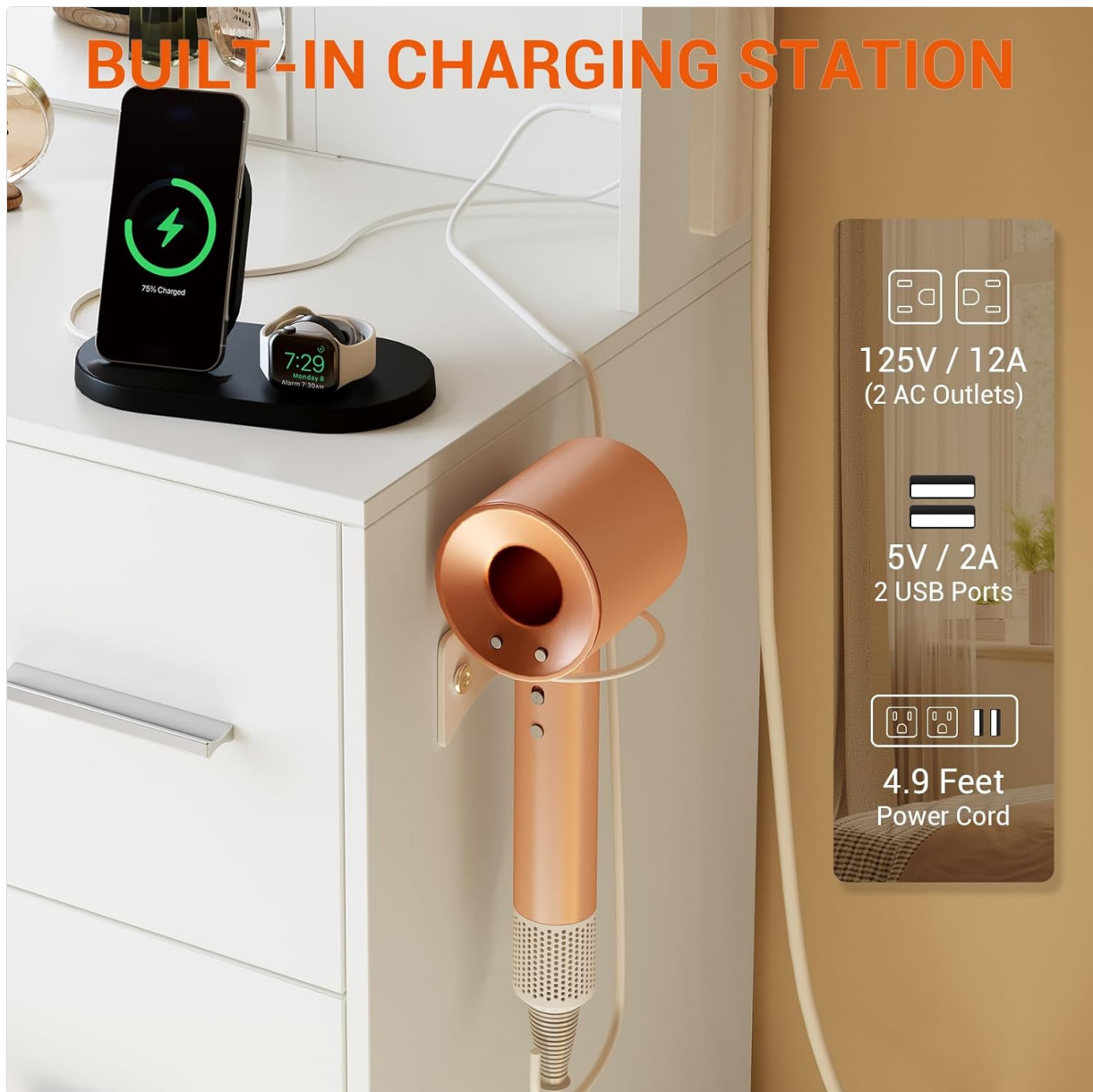
Image: Detail of the built-in charging station, showing two 125V/12A AC outlets and two 5V/2A USB ports, with a 4.9-foot power cord. A hair dryer is shown in its dedicated rack.