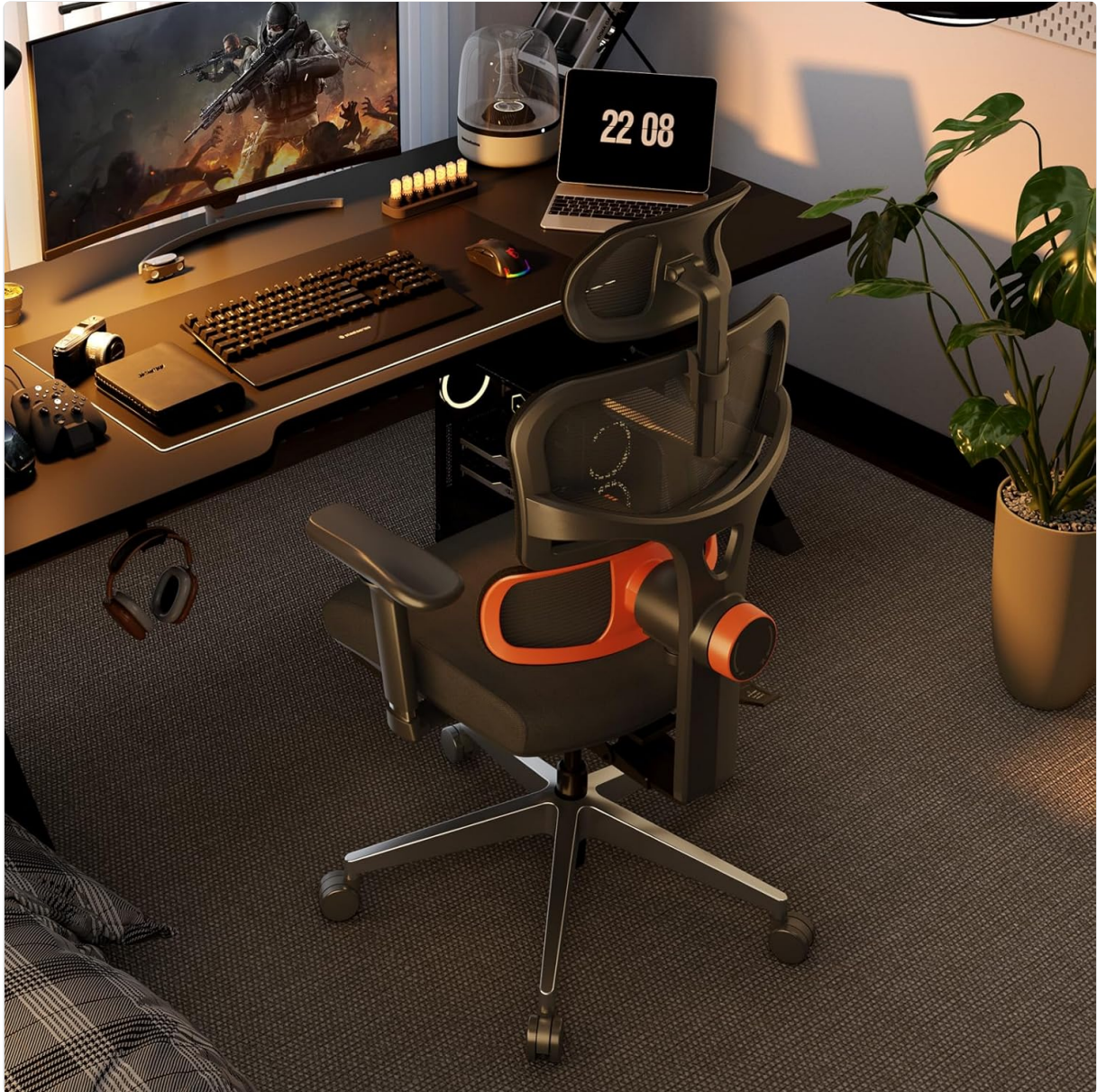
Figure 4: Visual guide to the chair's multiple adjustment functions, including headrest, armrest, backrest tilt, and seat adjustments.

The backrest can be tilted and locked at various angles between 96° and 136°. Use the tension knob to adjust the resistance for rocking mode. The integrated footrest can be extended for full body relaxation.