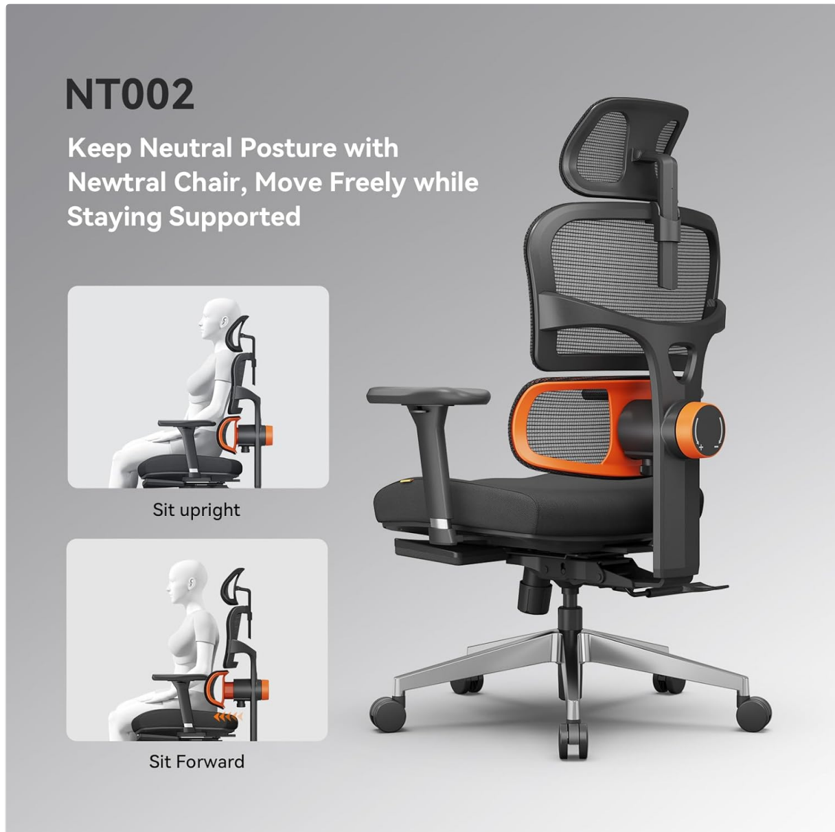
Figure 3: Close-up view of the adaptive lumbar support mechanism, illustrating its auto-following movement.

The chair features a unique auto-following lumbar support mechanism that automatically adjusts to the natural curve of your lower back as you move, providing continuous support and helping to alleviate lower back pain.