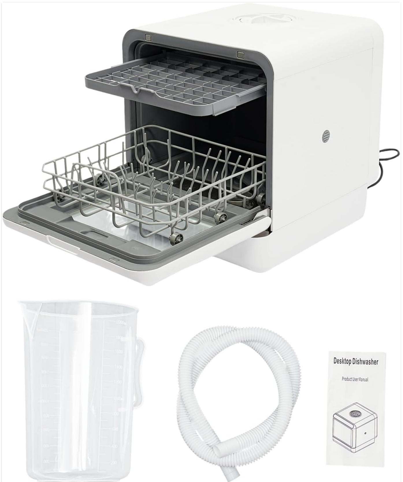
Image: The QLK-T18 Mini Countertop Dishwasher displayed alongside its accessories, including the water pipe, measuring cup, and the product user manual.