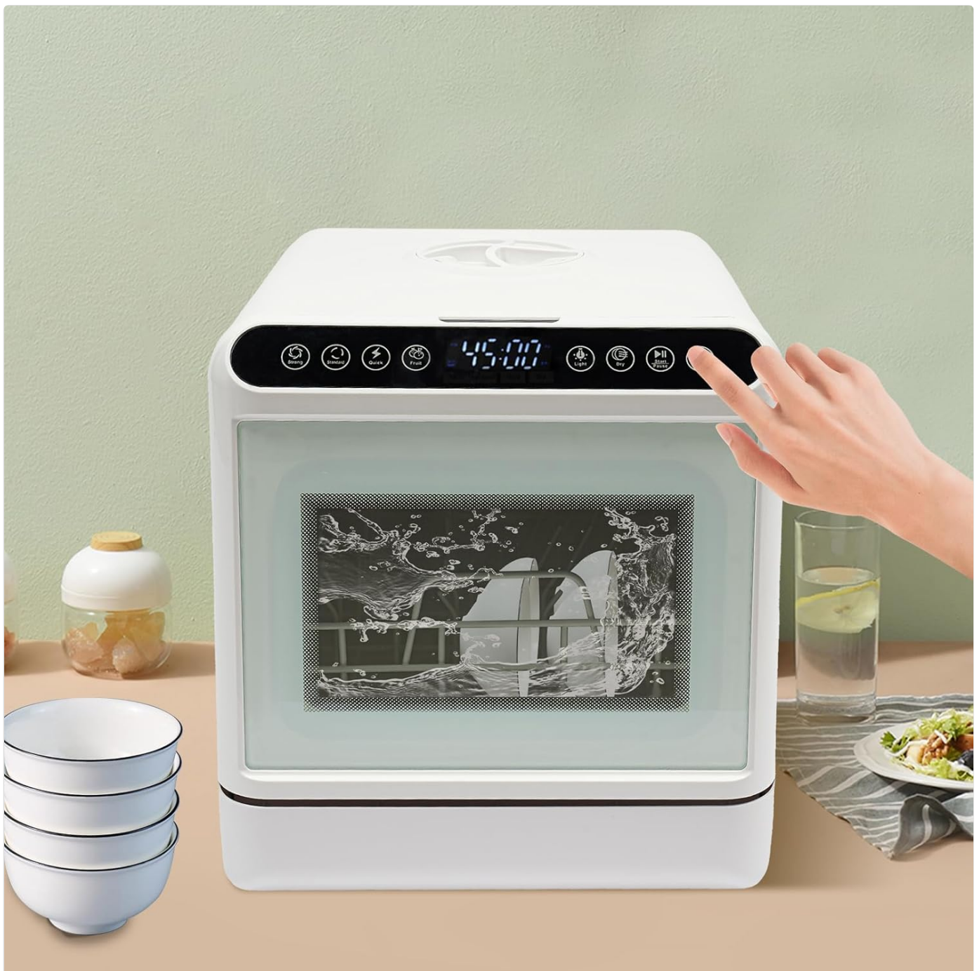
Image: A user's hand is shown pressing a button on the touch control panel of the QLK-T18 Mini Countertop Dishwasher, which is actively washing dishes inside.