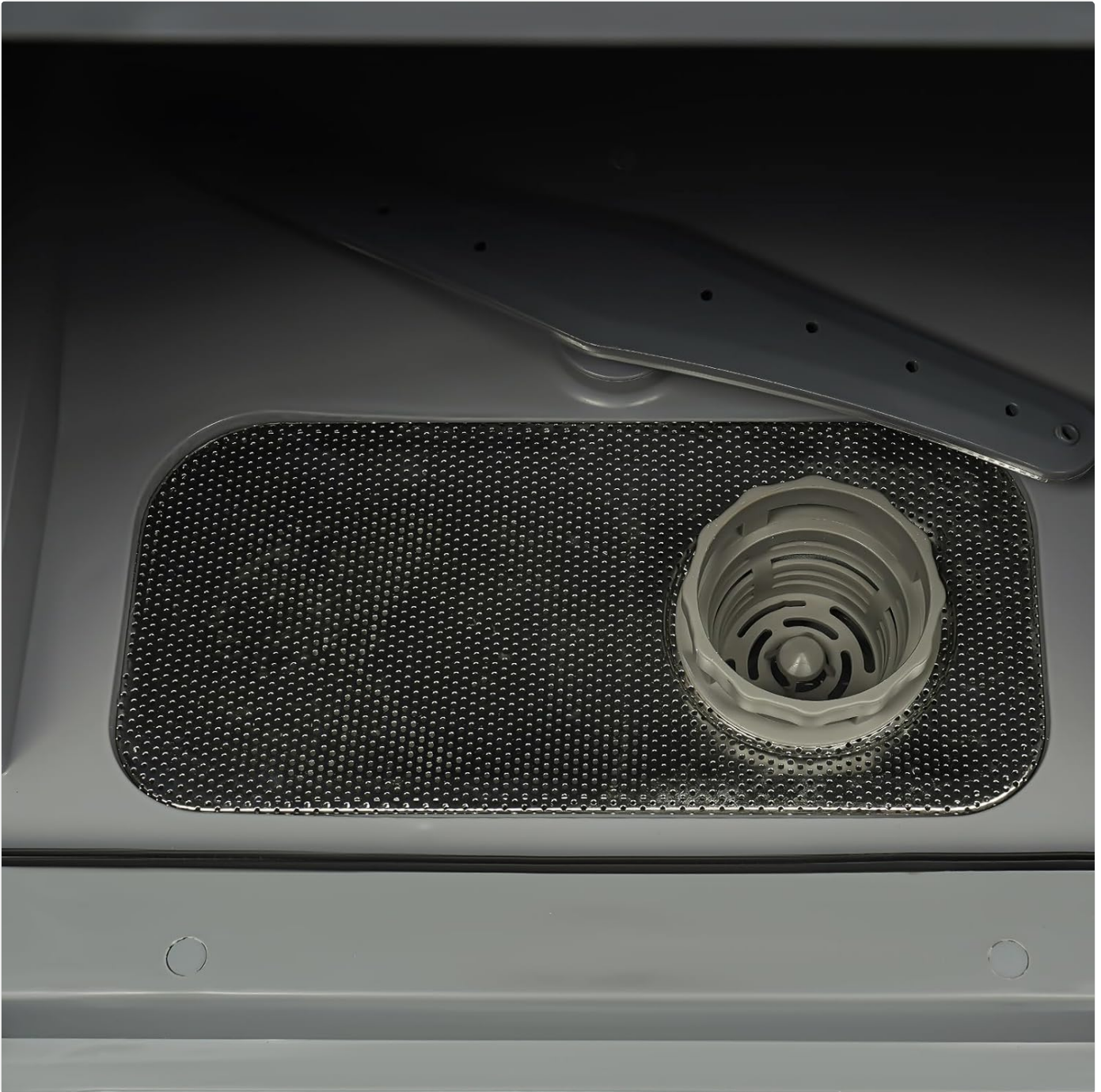
Image: An interior shot of the dishwasher, focusing on the circular drain filter located at the base of the washing compartment.

clean the filter located at the bottom of the wash tub to prevent blockages and ensure efficient drainage. The removable basket can also be easily removed for cleaning.