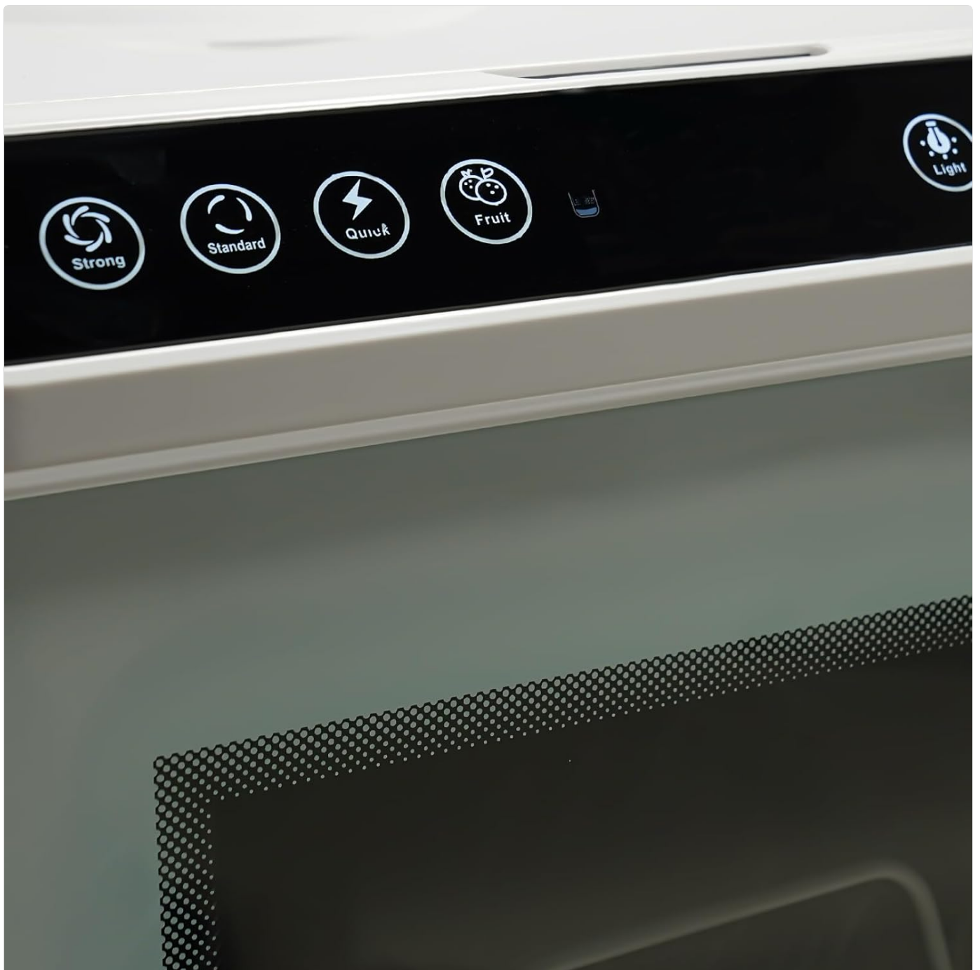
Image: A detailed view of the dishwasher's touch control panel, highlighting the icons for different wash modes such as Strong, Standard, Quick, and Fruit.