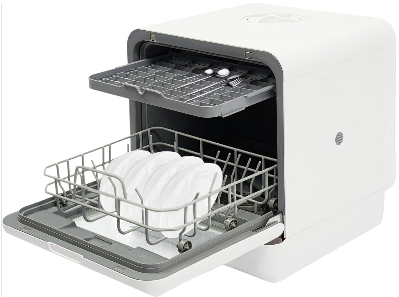
Image: The QLK-T18 Mini Countertop Dishwasher with its door open, revealing the internal dish rack and a separate tray for cutlery. The compact design is visible.