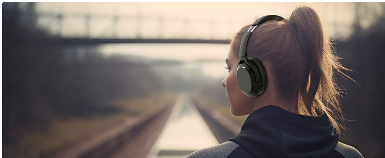
Image: Memory Foam Ear Cushions and Foldable Design for Comfort. This image shows the soft ear cushions and highlights the foldable design for portability.