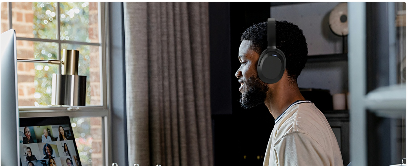
Image: 40mm Dynamic Driver for Deep Bass in Falebare Q20. This image illustrates the internal 40mm driver responsible for audio quality.

You can use the headphones with the included 3.5mm audio cable for a wired connection, even if the battery is depleted. Simply plug one end into the 3.5mm audio port on the headphones and the other end into your audio device's 3.5mm jack.