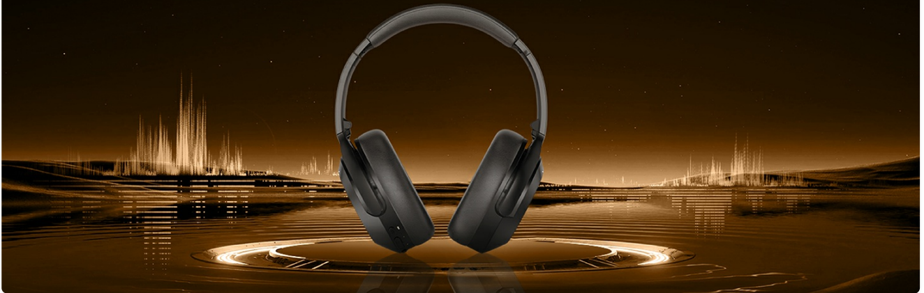
Image: Active Noise Cancellation in Falebare Q20 Headphones. This visual represents the noise-cancelling effect around the headphones.

Powerful and immersive deep bass for a rich, resonant sound experience.