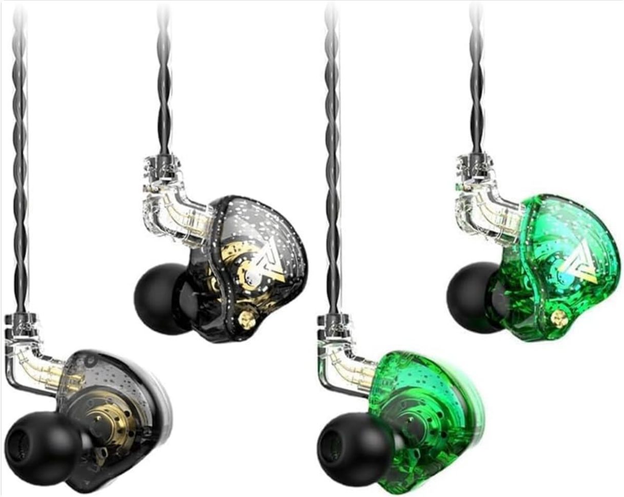
Image: The Yeabomy AK6 PRO Wired Gaming Earbuds, showing both black and green color variants with their detachable cables.