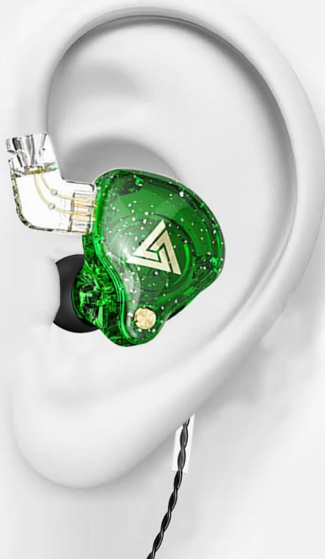
Image: Visual guide demonstrating the ergonomic fit of the earbuds, showing how they sit securely in the ear with the cable looped over.