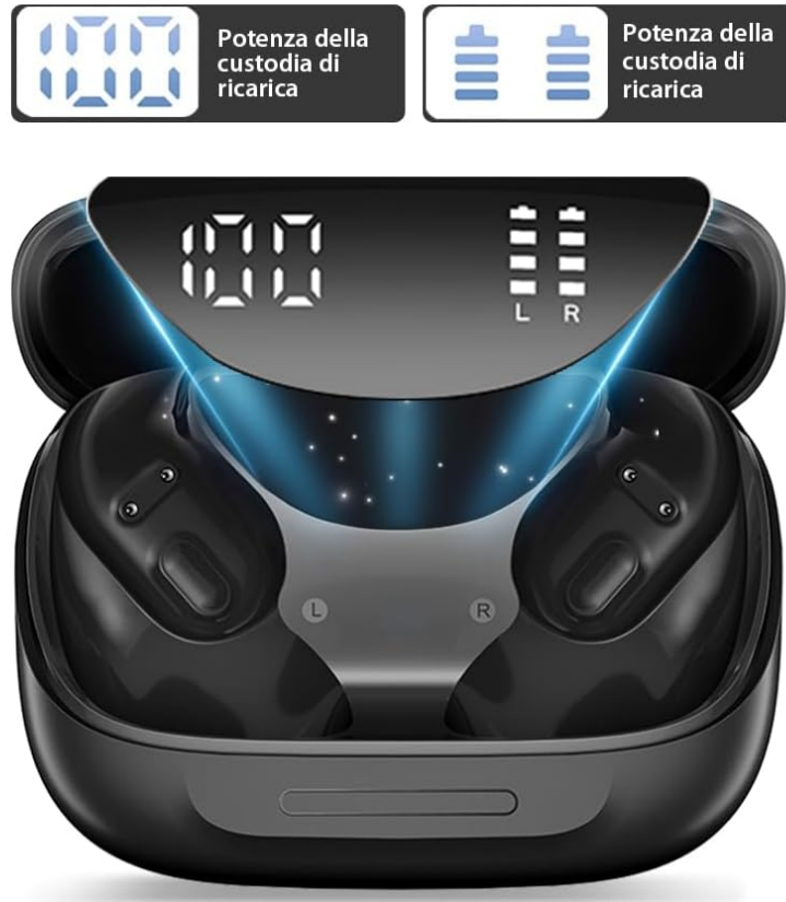
Figure 4.1: The charging case features an intelligent LED display that shows the remaining battery percentage for the case and individual earbud charging status.

Display di alimentazione a LED intelligente Vedere con chiarezza, ricaricare in modo più intelligente Combinando estetica e praticità, il display LED intelligente mostra la carica residua in un colpo d'occhio.