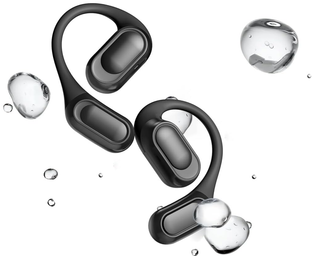
Figure 6.1: The IP68 rating ensures the AirPods 200 are protected against sweat, rain, and dust, making them ideal for various environments.

Con una classificazione IP68 per la resistenza all'acqua e alla polvere, AirPods 200 ha una struttura robusta e solida, in grado di affrontare qualsiasi situazione, dagli spruzzi d'acqua multidirezionali alla sudorazione intensa, fino agli acquazzoni torrenziali.