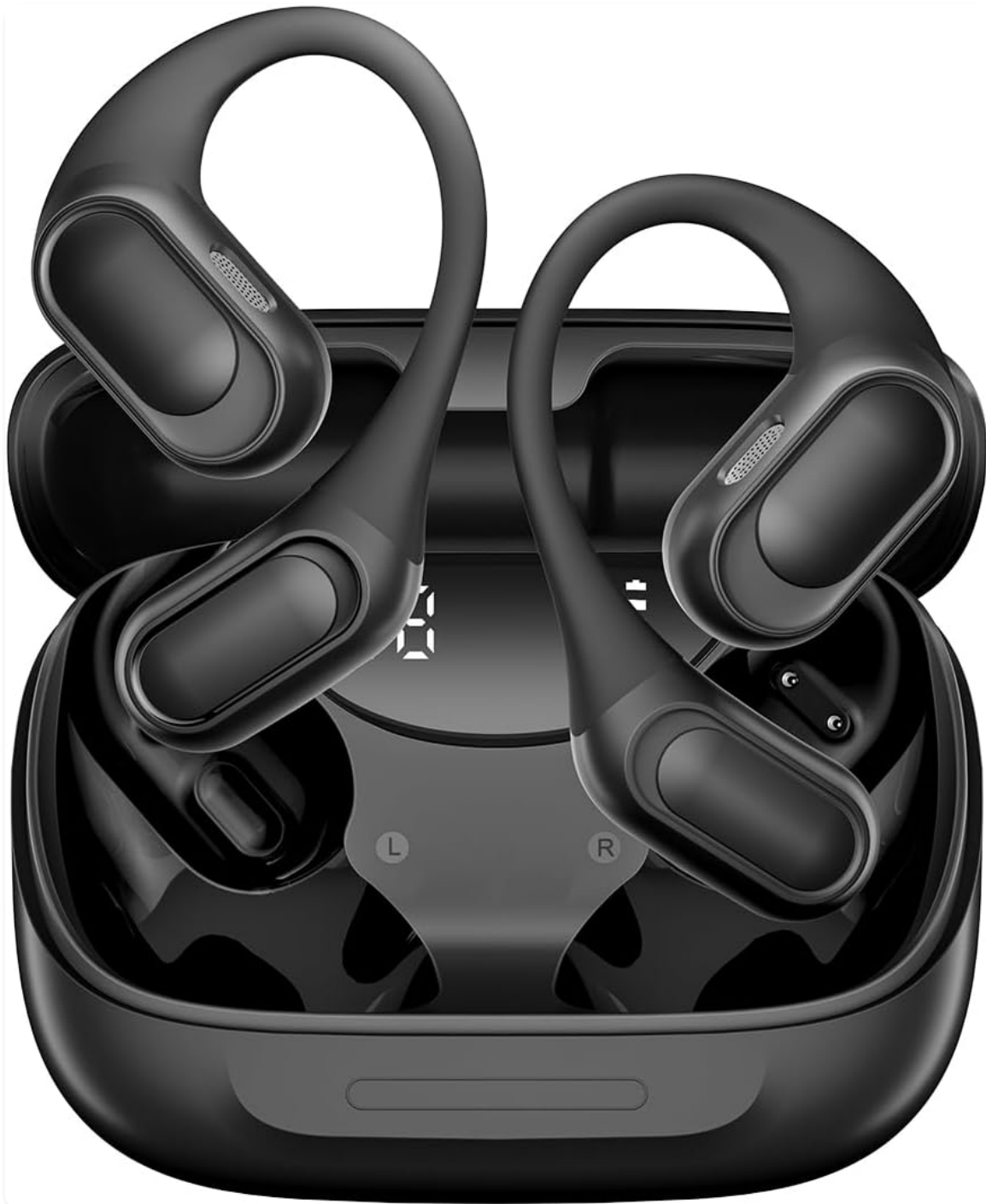
Figure 4.2: The Blackview Airbuds 200 earbuds and their charging case, ready for pairing.