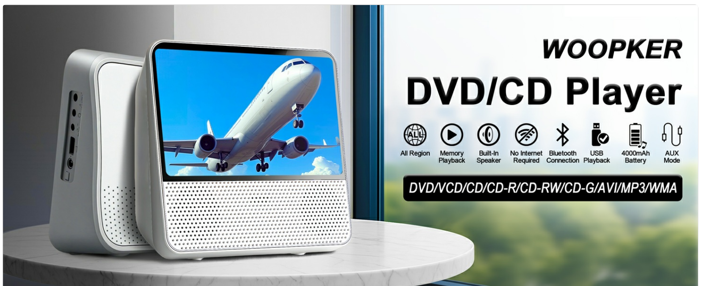
Image 1.2: Overview of key features including All Region support, Memory Playback, Built-in Speaker, No Internet Required, Bluetooth Playback, 4000mAh Battery, and AUX Mode.