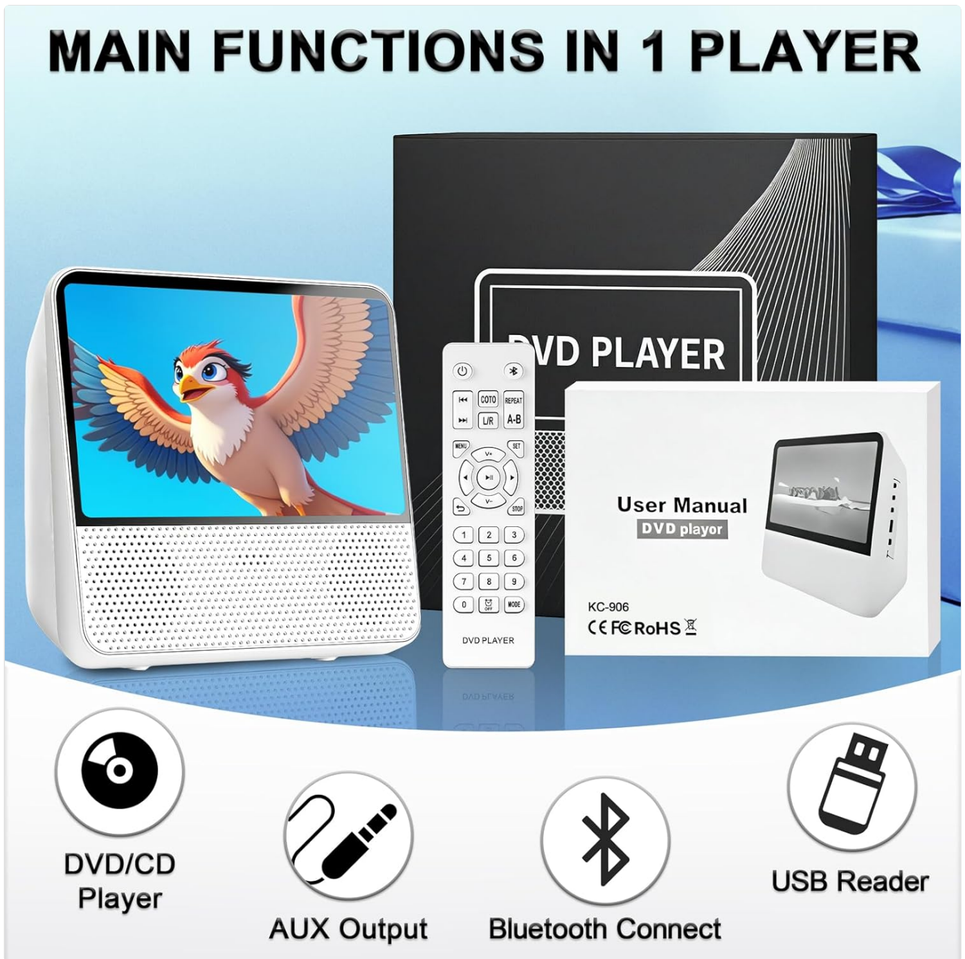
Image 2.1: The portable DVD player, remote control, user manual, and power adapter, illustrating the main components included in the package.