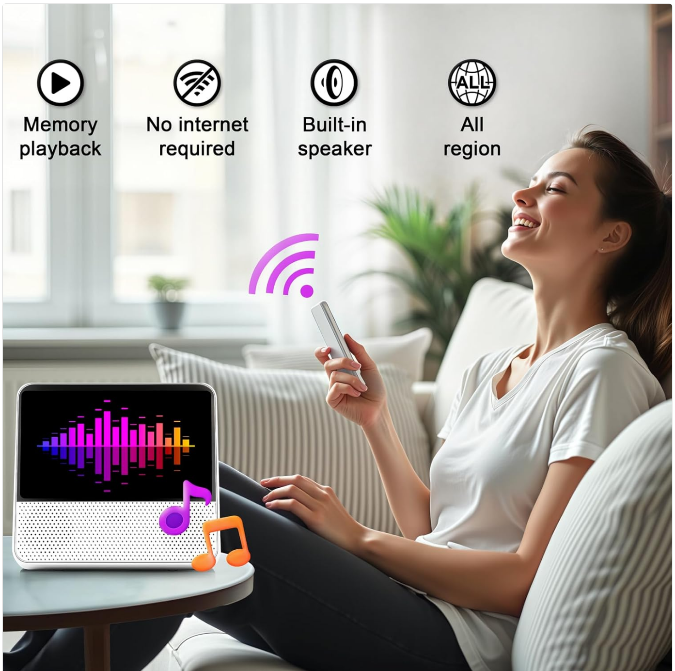
Image 4.1: A user enjoying music from the portable DVD player, demonstrating its wireless Bluetooth capability.