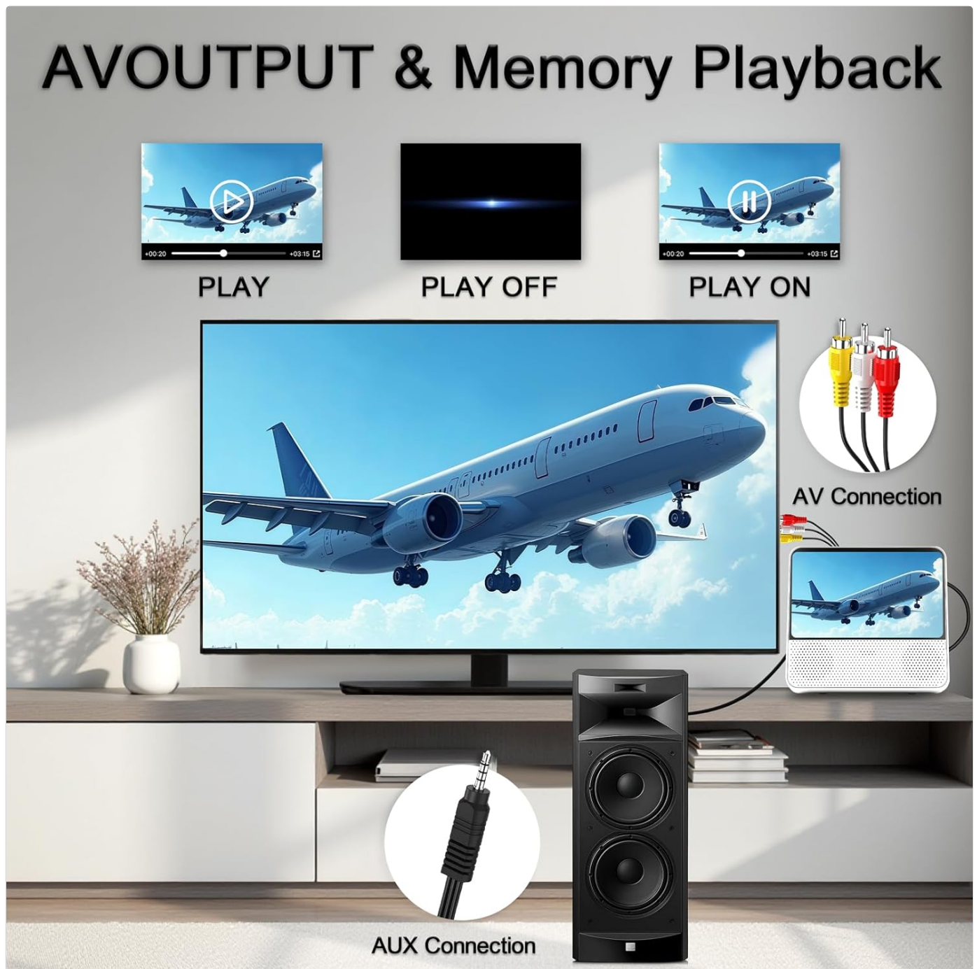
Image 3.2: Illustration of the portable DVD player connected to a television using an AV cable, demonstrating how to share content on a larger display.