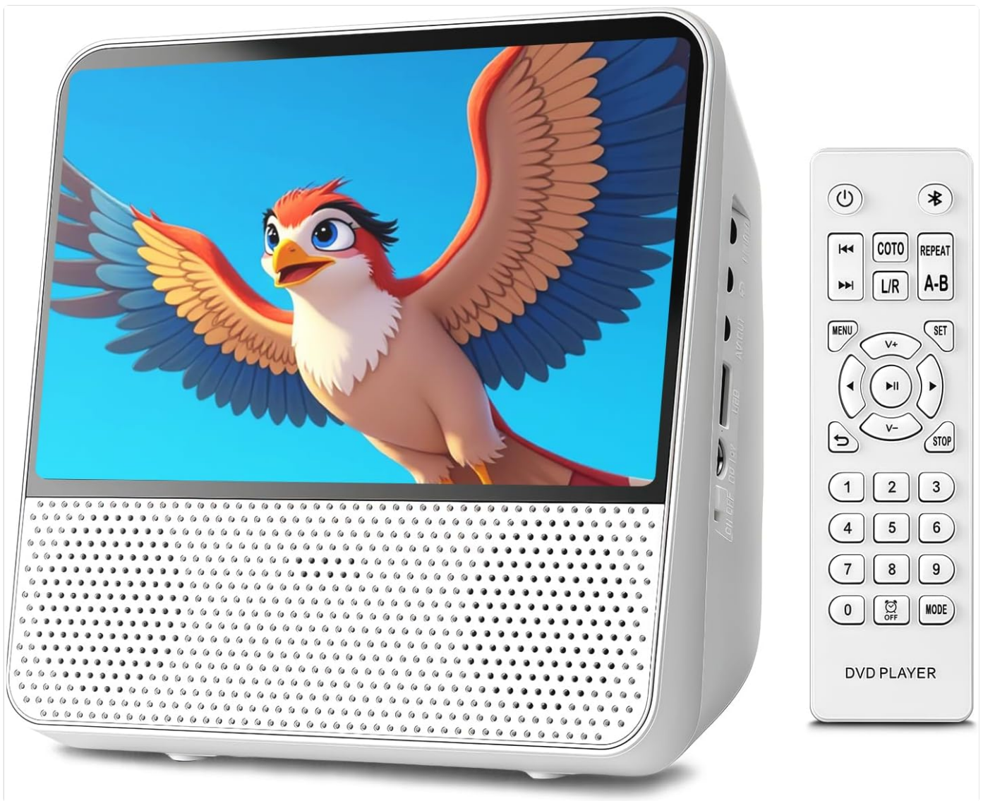
Image 1.1: Front view of the WOOPKER Portable DVD Player with its remote control, displaying a vibrant image on screen.