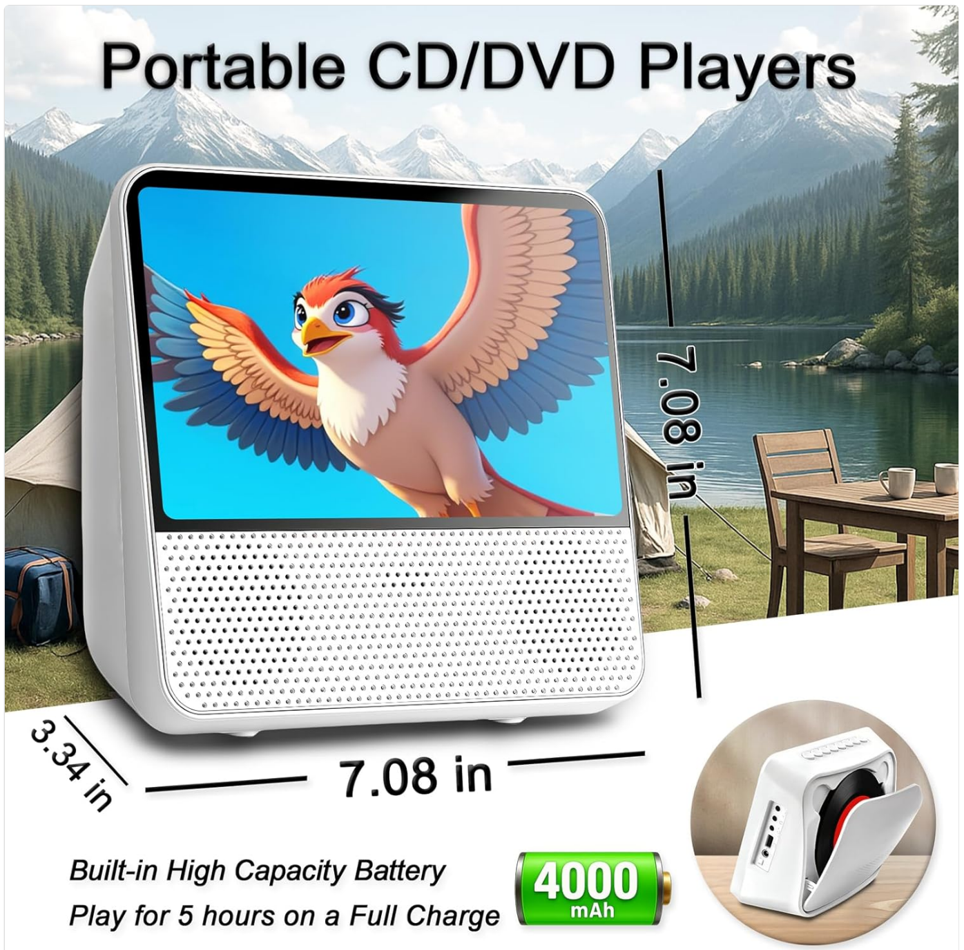
Image 7.1: The portable DVD player with its dimensions (7.08 inches width, 3.34 inches depth) and battery capacity (4000mAh) highlighted.