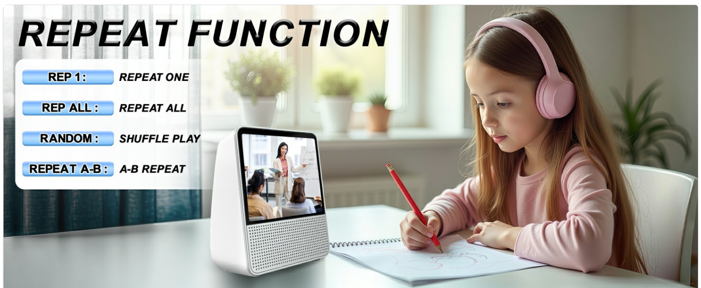
Image 4.2: Display of the repeat function options: Repeat One, Repeat All, Shuffle Play, and A-B Repeat.