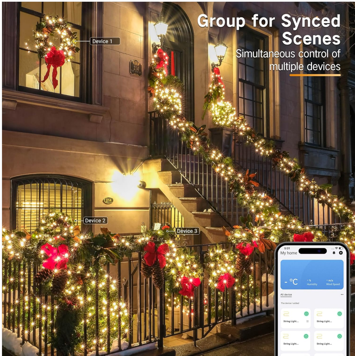
Image: Group control feature in the Brizled app for simultaneous management of multiple light sets.