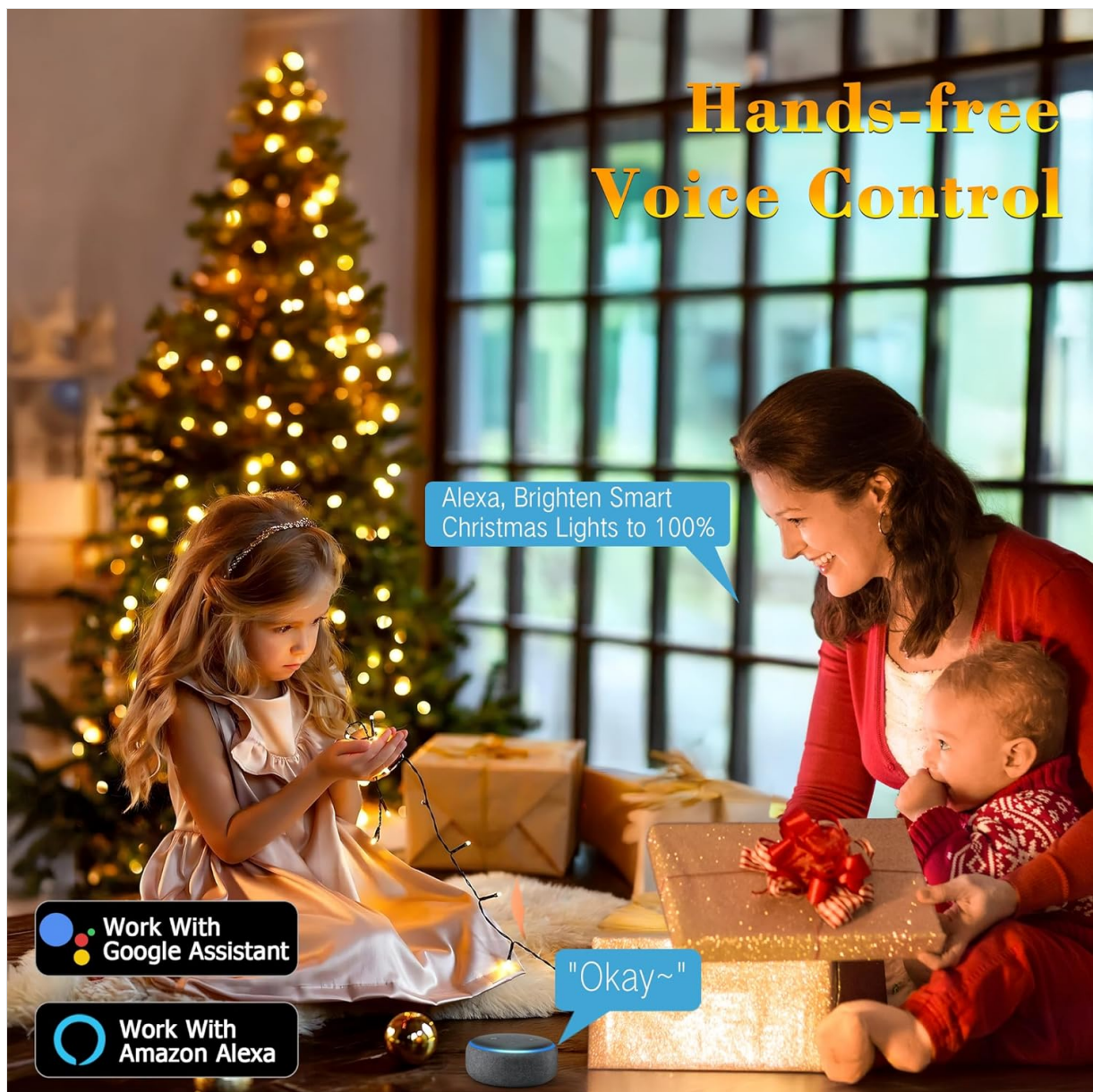
Image: Hands-free voice control with Alexa and Google Assistant.