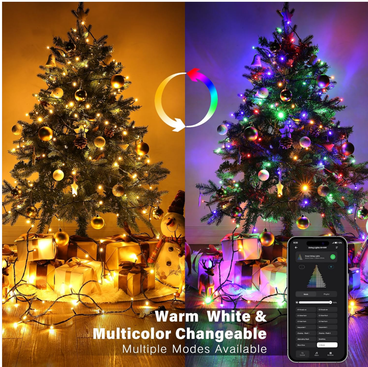
Image: Warm White and Multicolor changeable options.