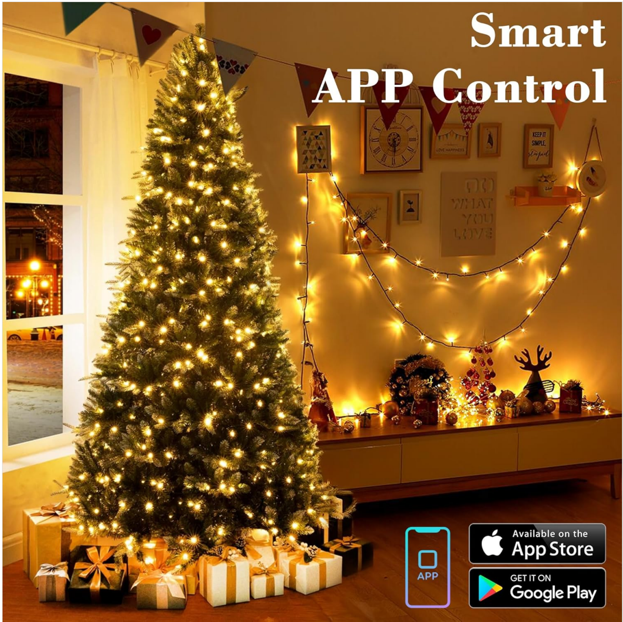
Image: Smart App Control interface for Brizled string lights.