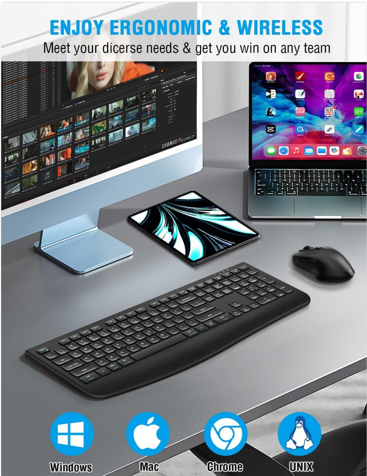
Image 5.2: Visual representation of the wide compatibility of the keyboard and mouse with various operating systems and devices, including Windows, Mac, Chrome, and UNIX.