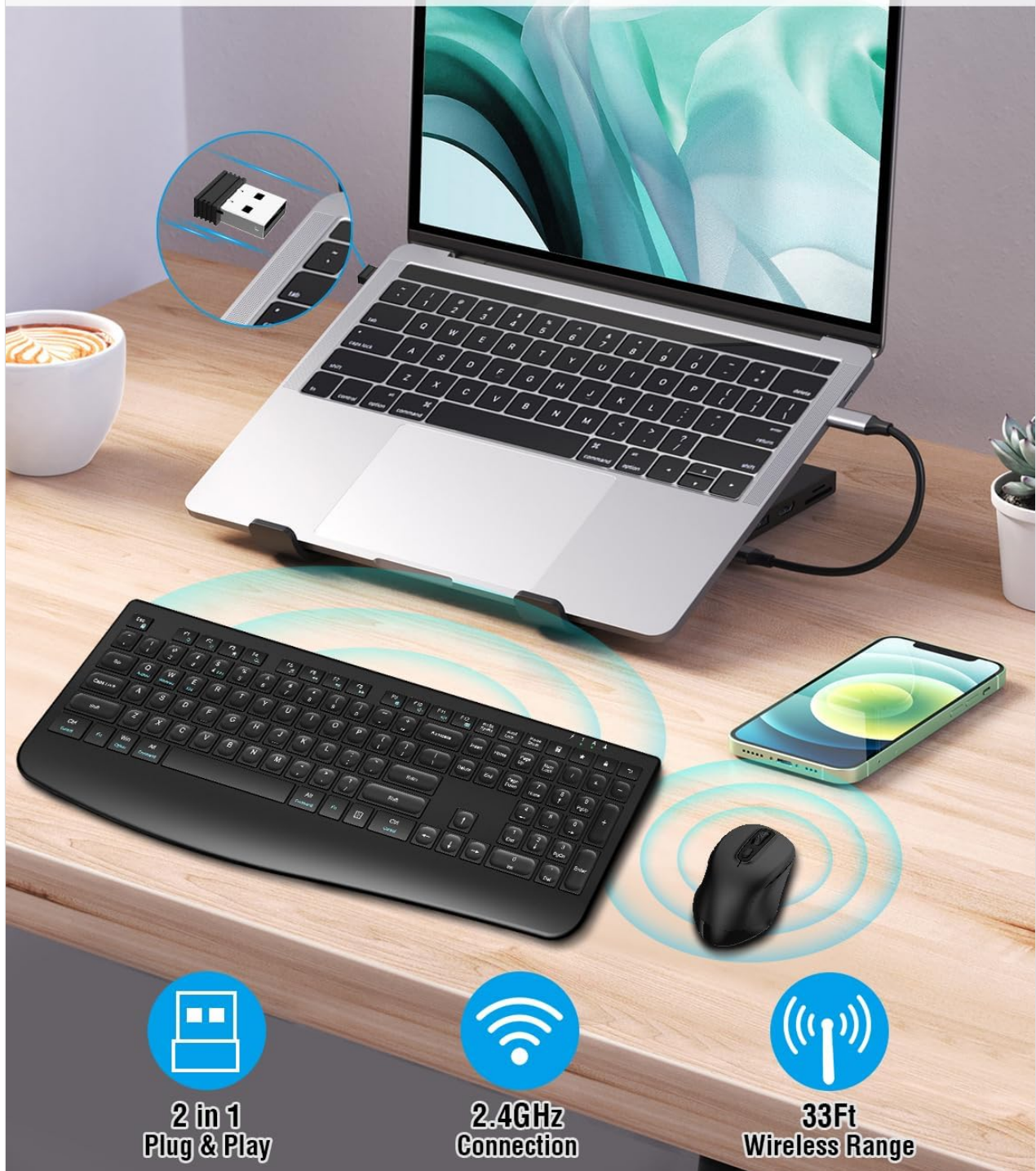
Image 4.1: Diagram showing the single USB receiver connecting both the keyboard and mouse to a laptop, illustrating the 2.4GHz wireless connection and 33ft wireless range.