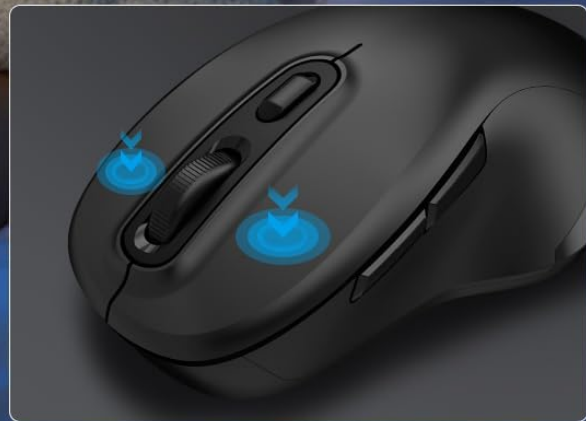
Ultra Silent Click