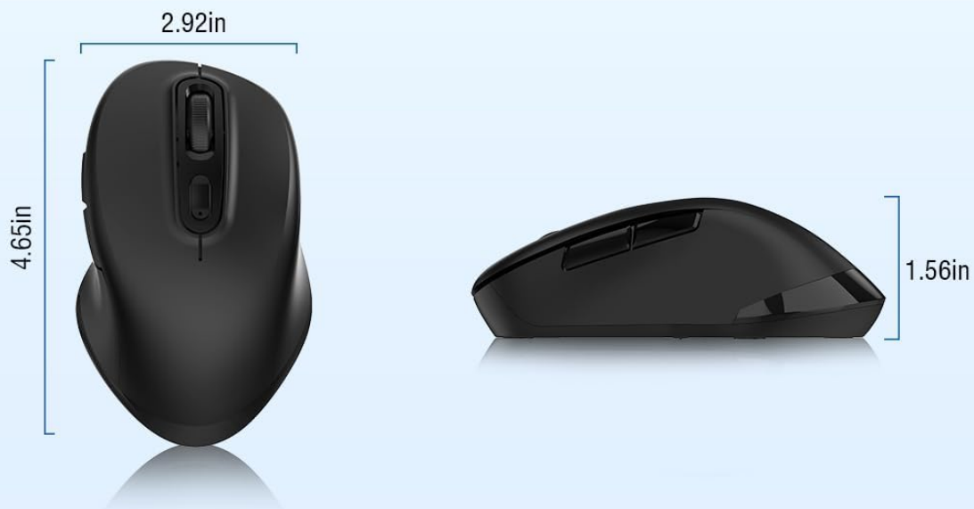
Image 3.1: Detailed dimensions of the full-size wireless keyboard and mouse, highlighting their compact and ergonomic design.