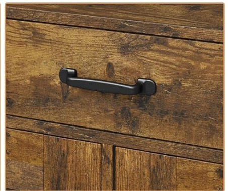
Durable Engineering Board