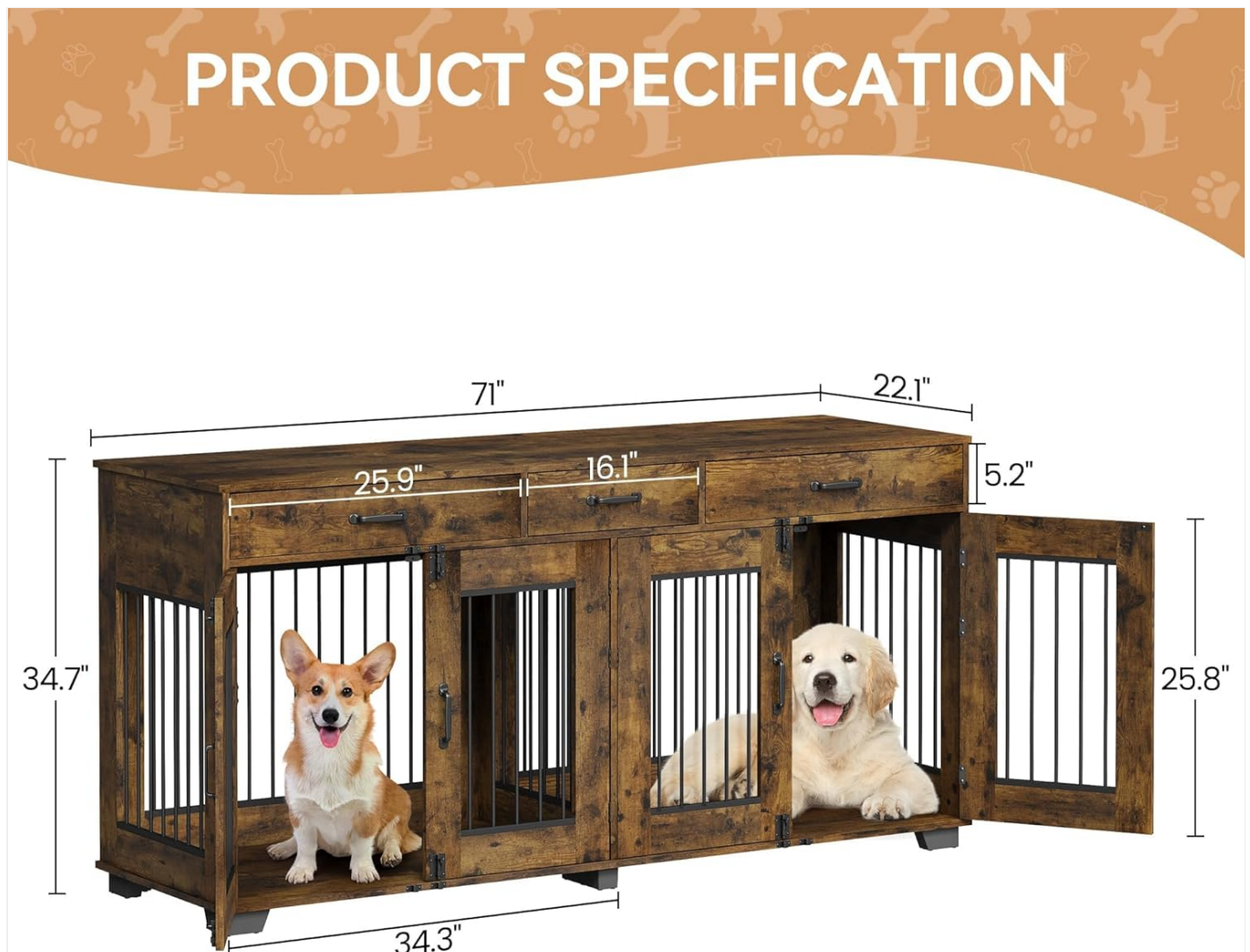
Figure 7: Product Dimensions and Specifications.