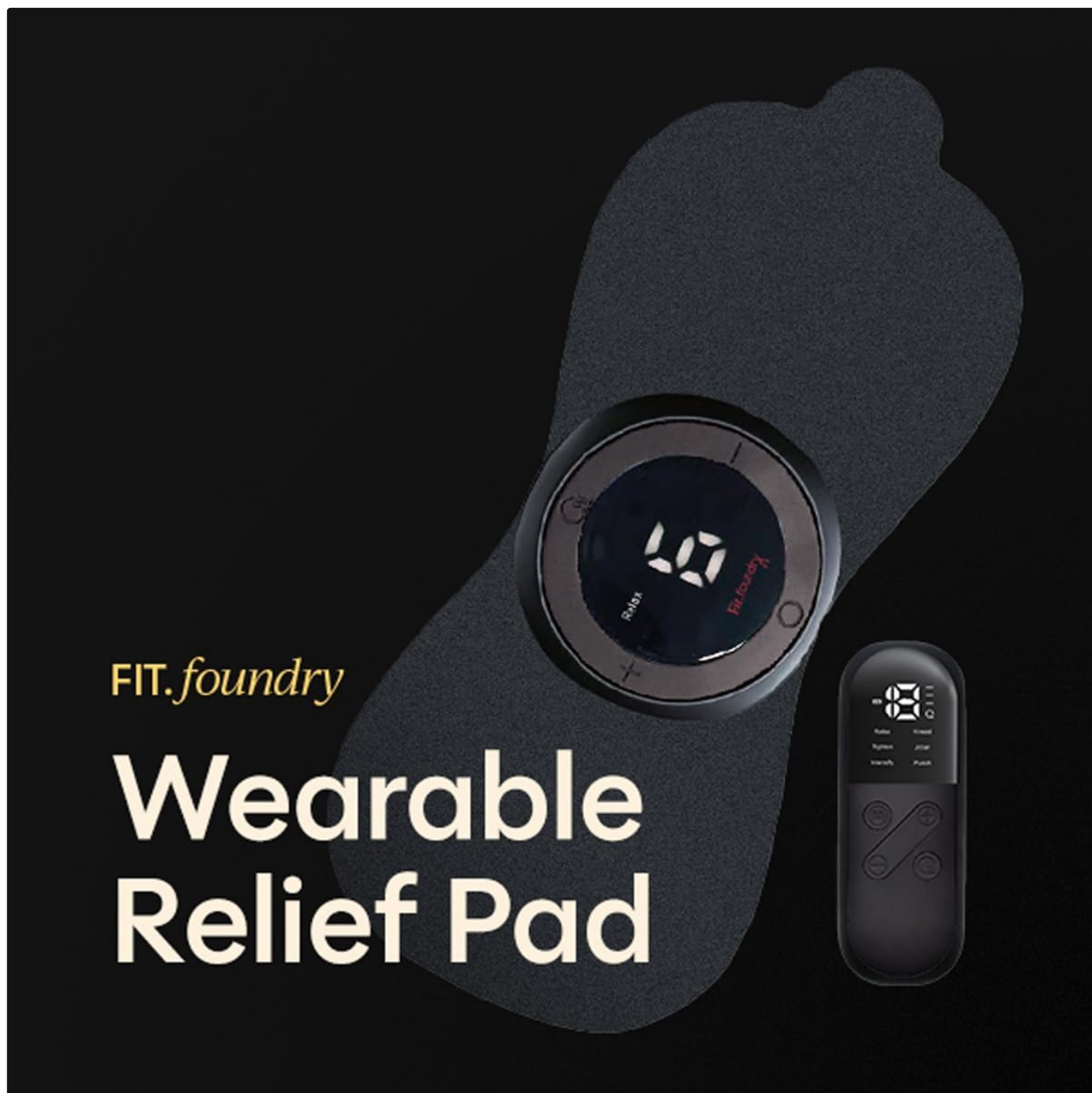
Image: The Fit Foundry Wearable Relief Pad, a black, flexible pad with a central control unit, shown alongside its compact remote control. The pad is designed to adhere to the body for targeted relief.