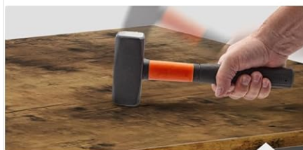
Not Easy to Deform