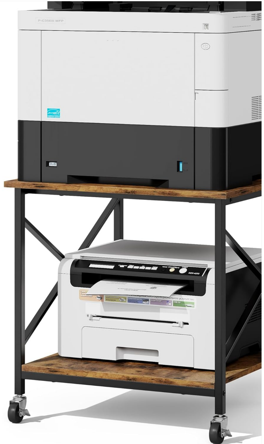
Image: A detailed view highlighting the quality features of the stand, including its waterproof and scratch-resistant wooden panels, and the sturdy "X" design metal frame.