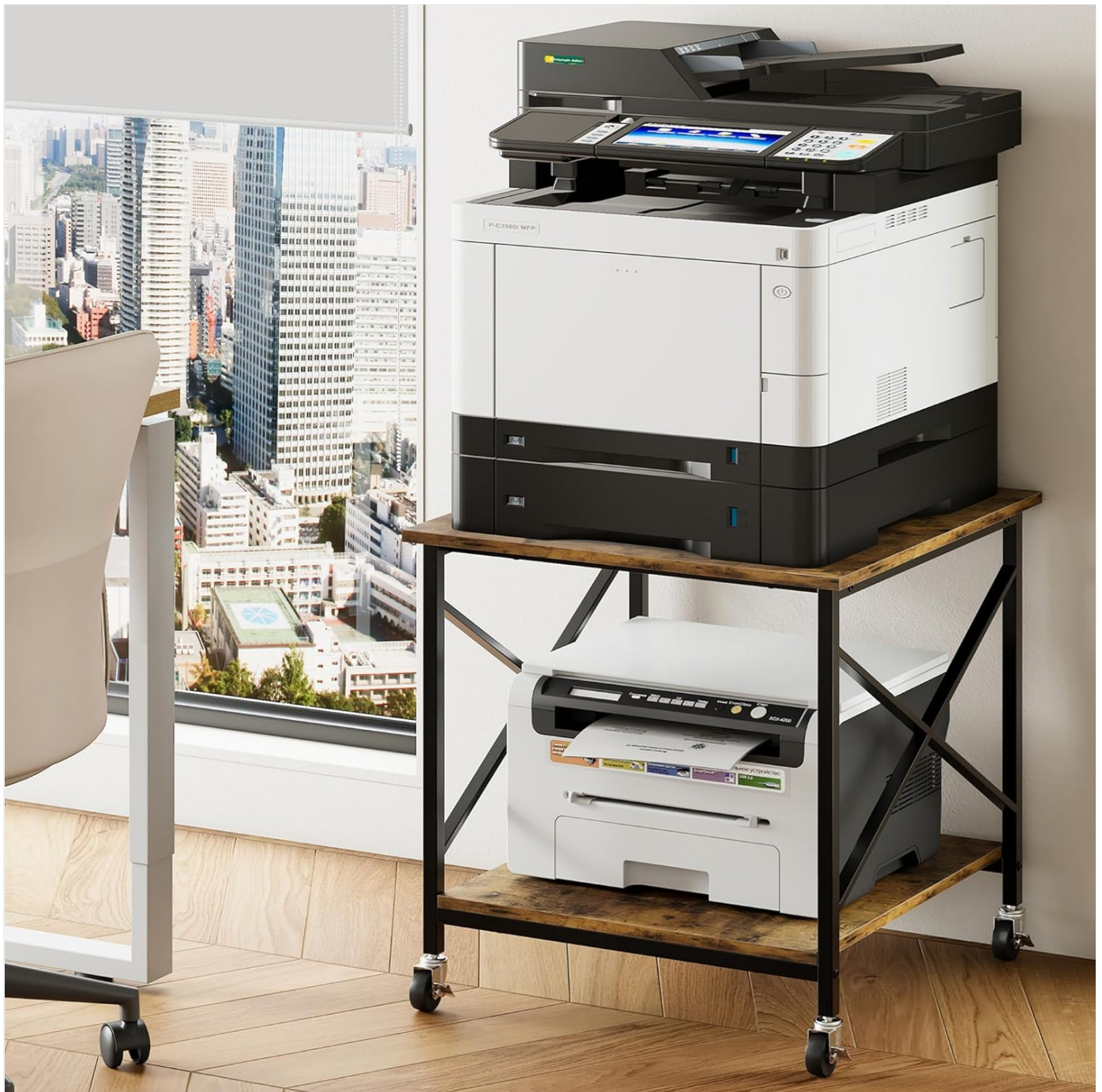
Image: The Warmiehomey 24x24x24 Inch Printer Stand in Rustic Brown, showcasing its two tiers and overall design.