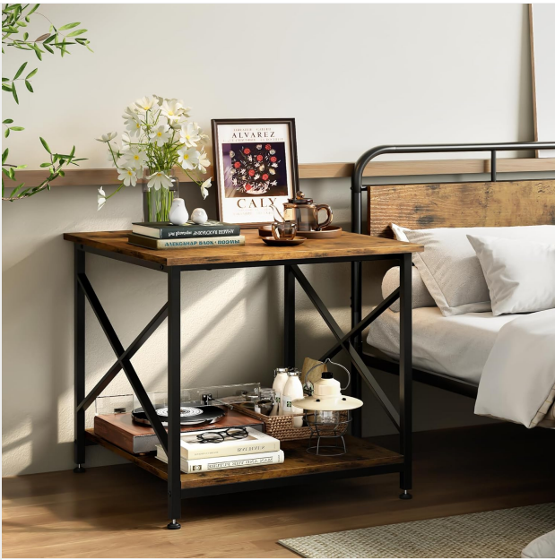
Image: The stand functioning as a nightstand in a bedroom, holding a lamp, books, and other personal items.