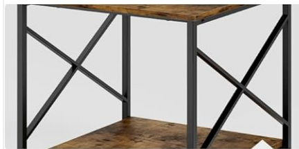
Sturdy "X" design