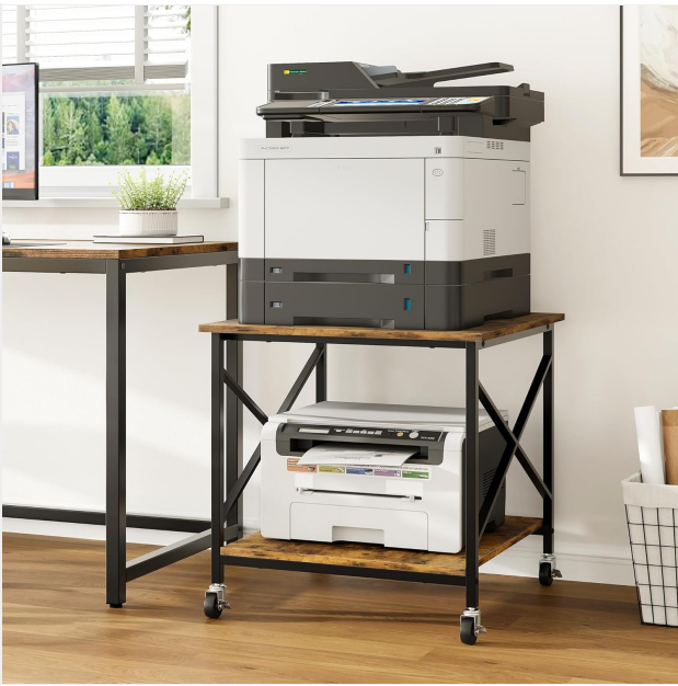
Image: The printer stand in an office, holding a large printer on the top tier and paper on the bottom shelf, demonstrating its primary function.