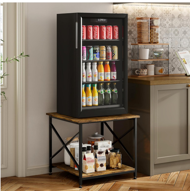
Image: The stand used as a mini-fridge stand in a kitchen, with snacks stored on the lower shelf, highlighting its versatility.