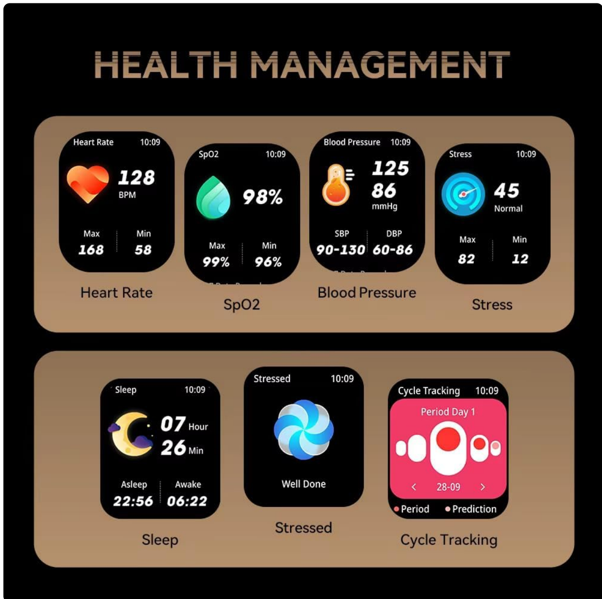
Image: A graphic displaying the smartwatch's health management features, including heart rate, SpO2, blood pressure, stress, sleep, and cycle tracking data.