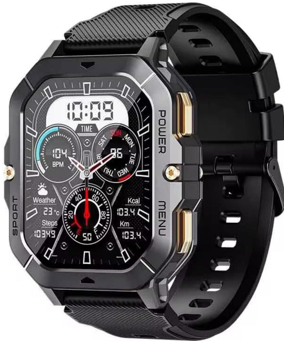
Image: Front view of the CUBOT Smartwatch C28, displaying the time, heart rate, steps, and weather on its screen.