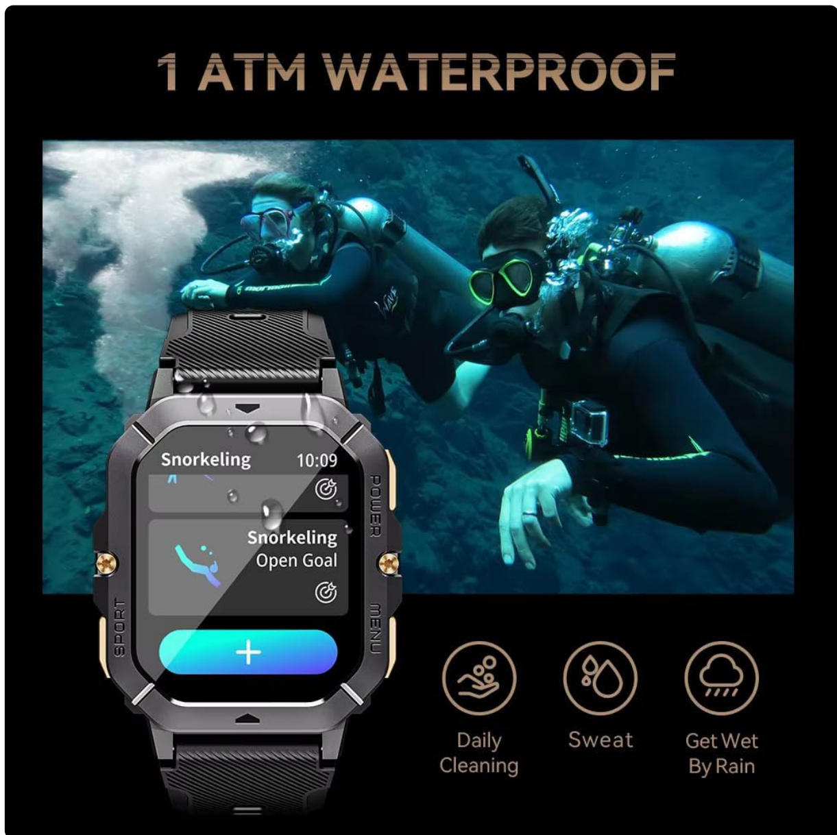
Image: The CUBOT Smartwatch C28 displayed with a background of divers, illustrating its 1 ATM waterproof rating, suitable for daily cleaning, sweat, and rain.