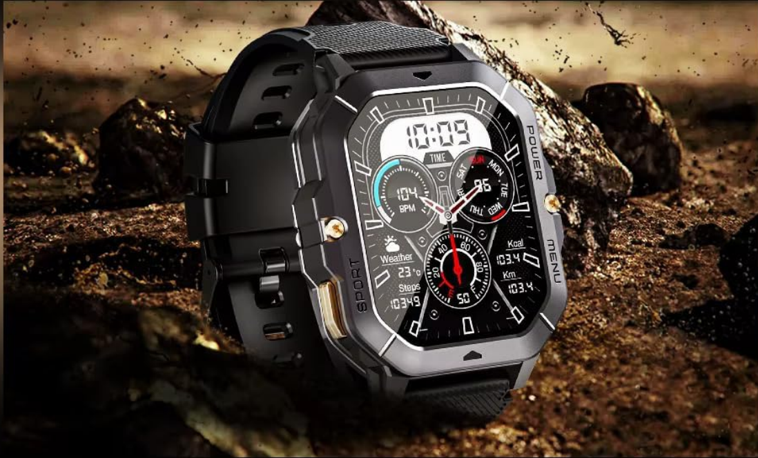
Image: The CUBOT Smartwatch C28 positioned on a rocky surface, highlighting its toughness, shock-proof, and drop-resistant qualities.