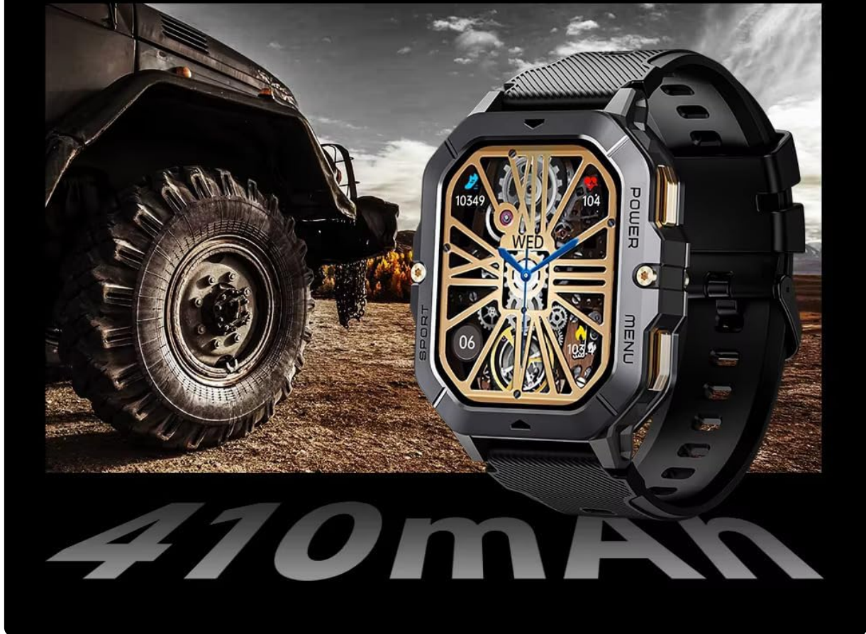
Image: The CUBOT Smartwatch C28 with a large "410mAh" text, indicating its battery capacity and long endurance.