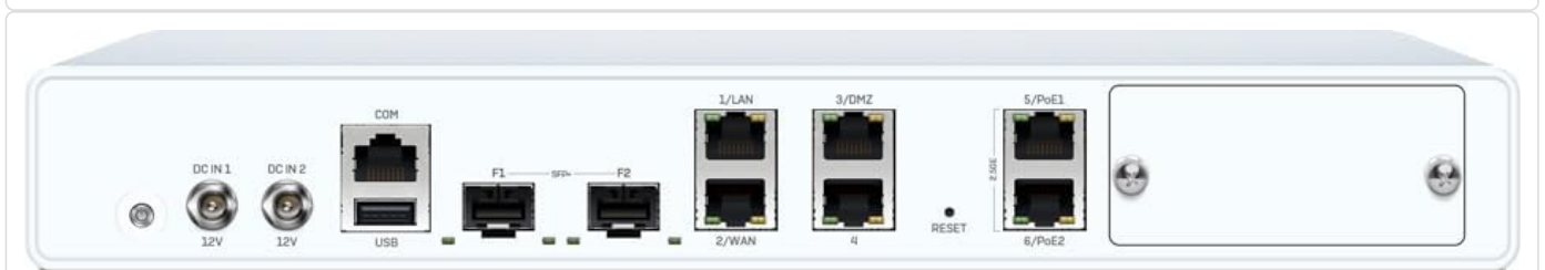
Figure 2: Rear view of the Sophos XGS 138 Security Appliance, displaying various network and power ports.