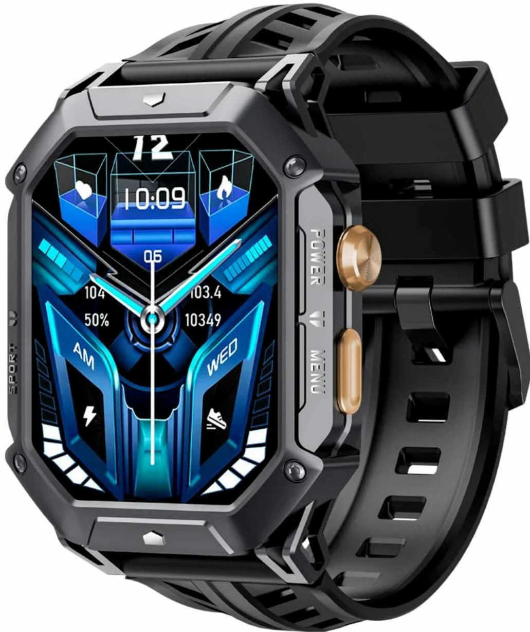
Image: The CUBOT X1 Smart Watch displaying its blue digital interface with time, battery, and activity metrics.